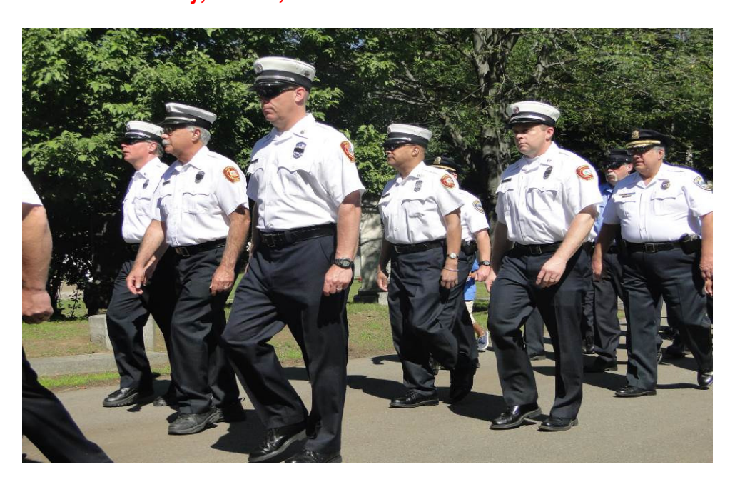
CFD members march into Cambridge Cemetery to pay respects to our deceased firefighters.