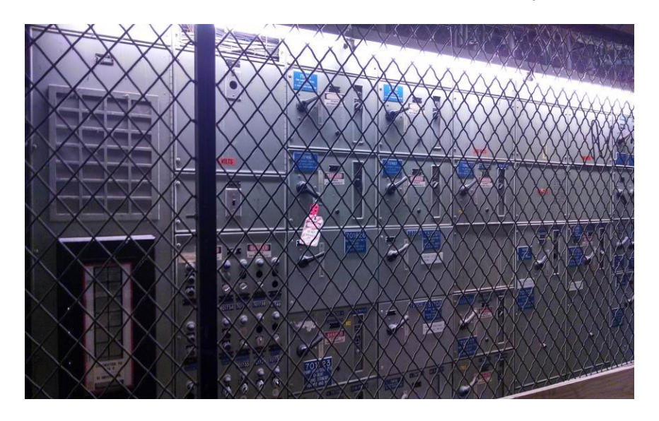
Ask yourself, what's burning at the bottom of those stairs? This is the electrical panel exposed (through the protective fence) at the bottom of those same stairs.