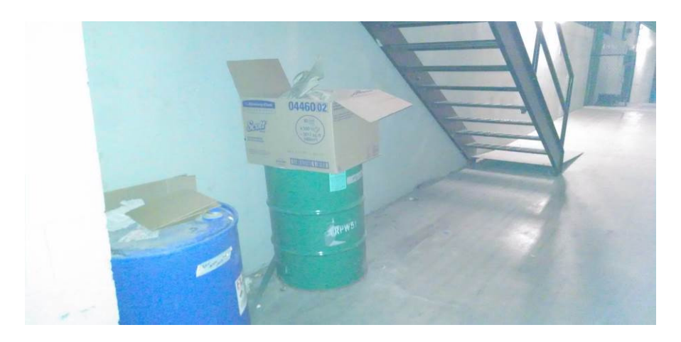
Although we inspect buildings regularly, we can't be on top of them all. Expect combustible and flammable materials to be stored under stairways!

In the last issue, we covered saw safety for the Truck Companies. This time, we will cover a few simple reminders for the Engine Companies. The following photos were taken in one building in Cambridge and can pose challenges to an Engine Company advancing a hose line in limited visibility.