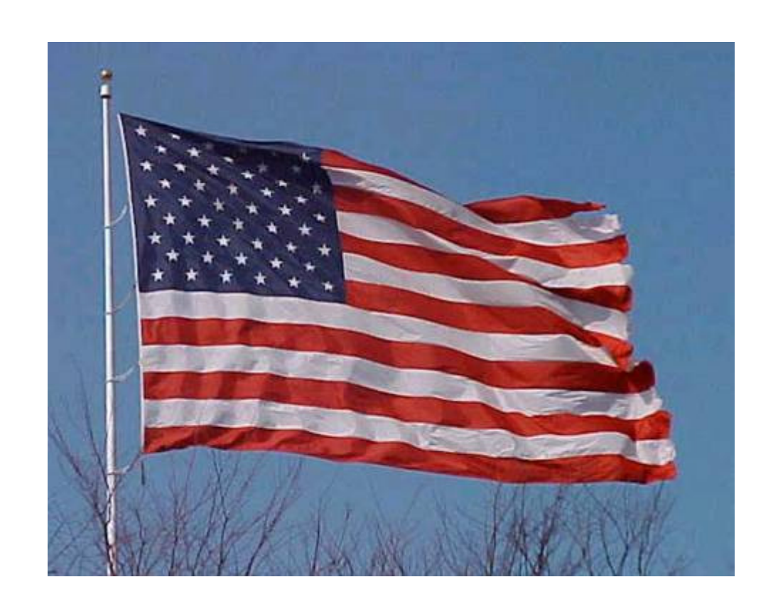
Brothers and Sisters, STAY BRAVE! STAY VIGILANT! STAY SAFE!