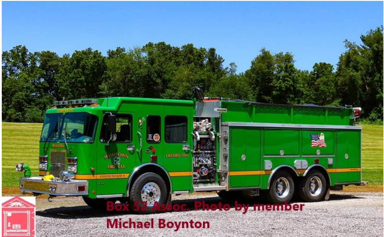
Irishtown Volunteer Fire Company New Oxford Township 2006 Spartan/Darley 1500/2500