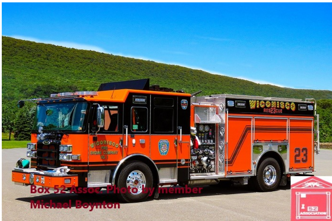
Wiconisco Engine Company No. 1 Rescue 23 2018 Pierce Enforcer 2000/500