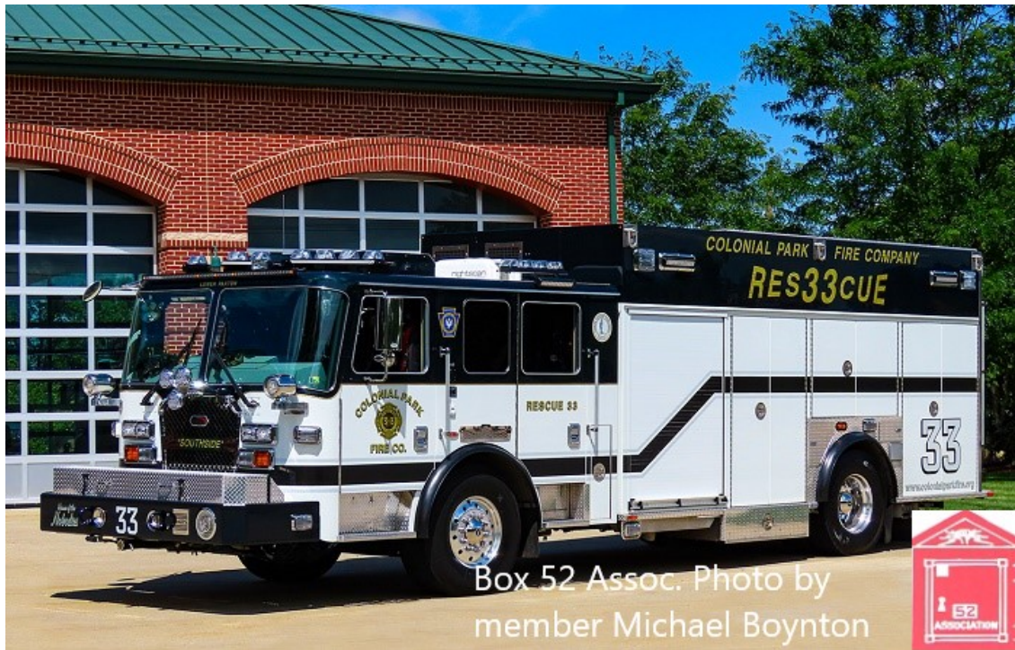
Colonial Park Fire Company Rescue 33 Lower Paxton Township 2008 KME Predator 1500/750/15 class A/35 class B foams