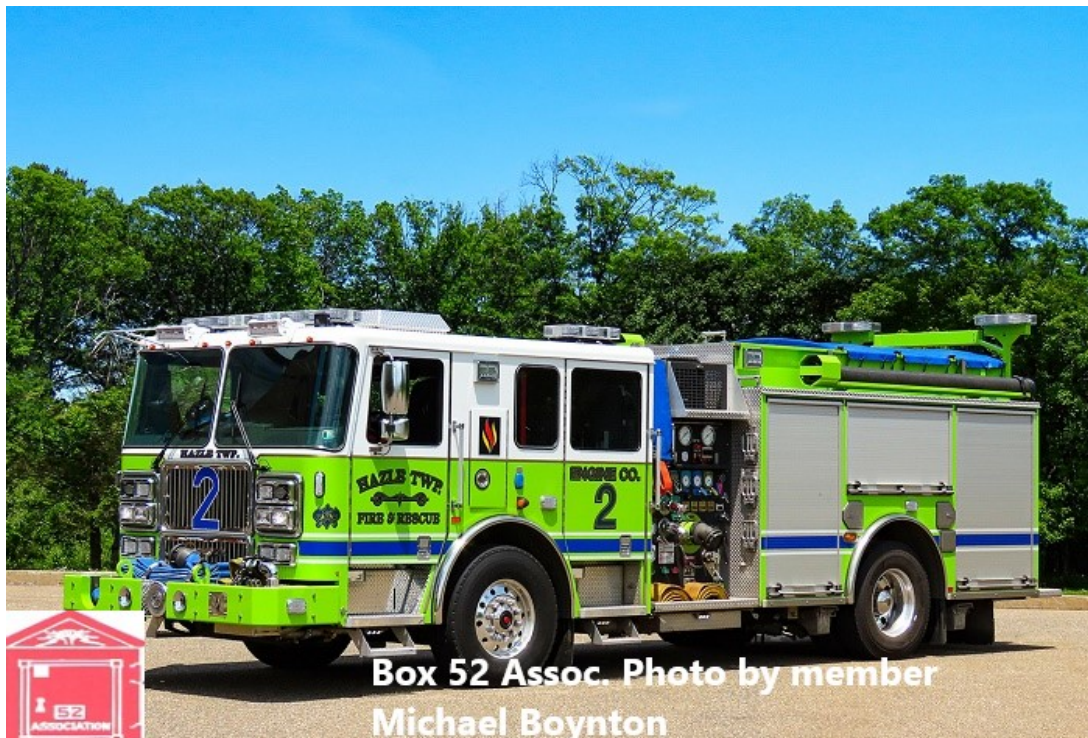
Hazel Township Engine 2 2017 Seagrave Marauder II 2000/750/40 class A foam