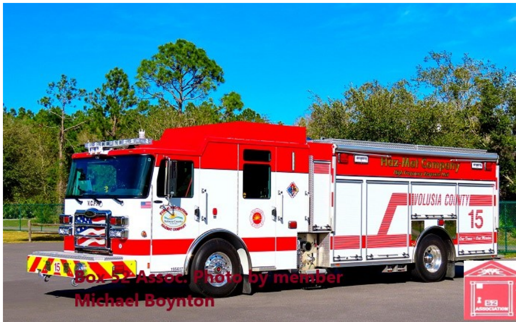
Volusia County Hazmat 15 2018 Pierce Enforcer 1500/750/30A