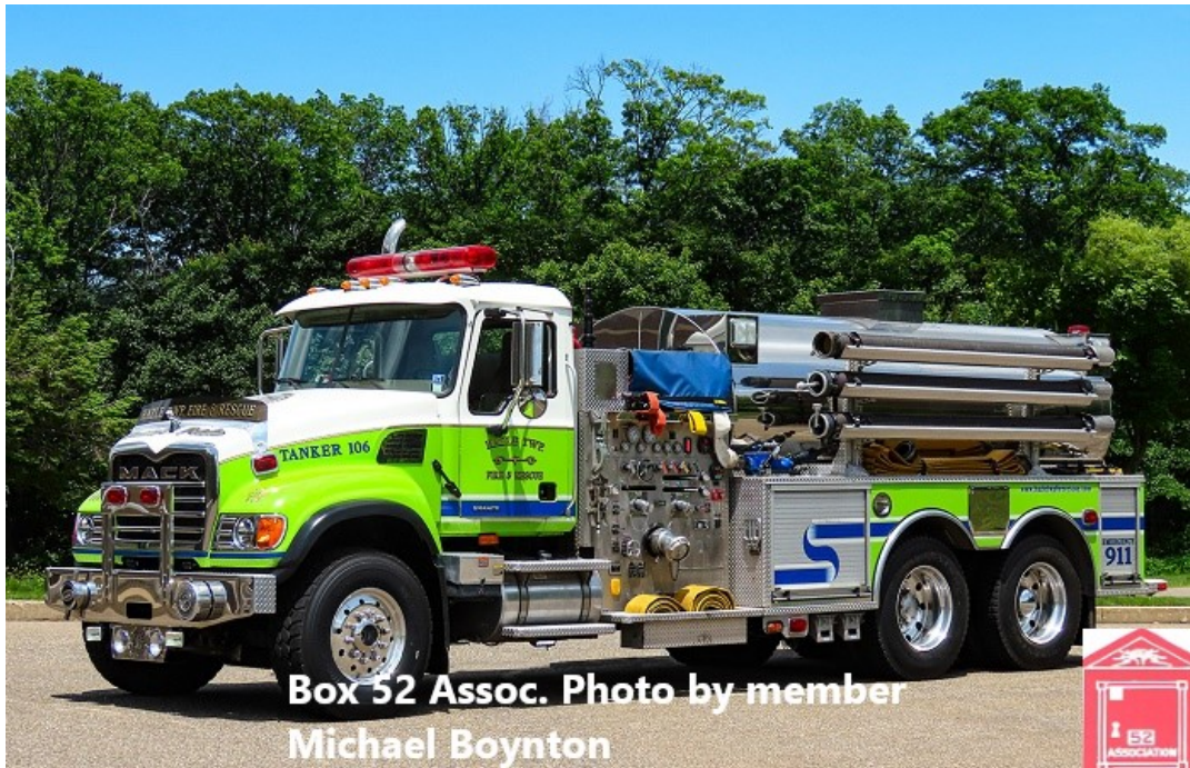
Hazel Township Tanker 106 2006 Mack Granite/KME 1500/2500