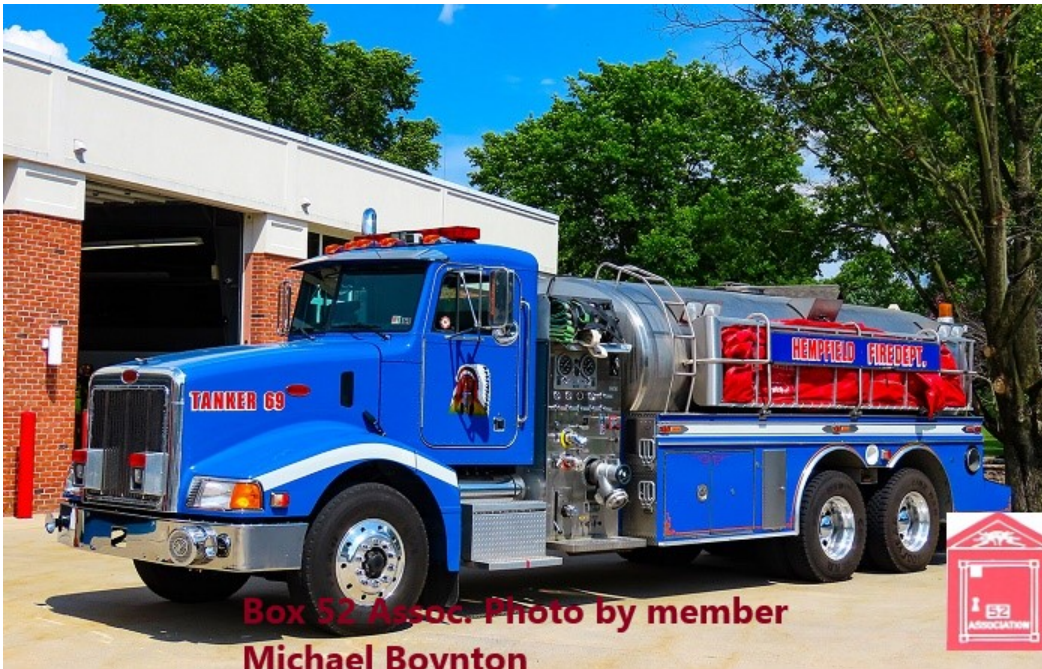
Box 52 Assoc.

Hempfield Fire Company Tanker 69 1997 Peterbuilt/S&S 1000/3500