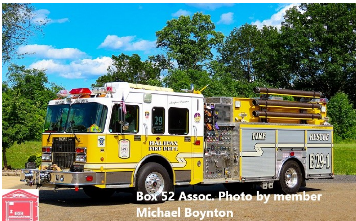
Halifax Fire Department Engine 29-1 2004 Spartan/Swab 1500/1000/30 class A/20 class B foams