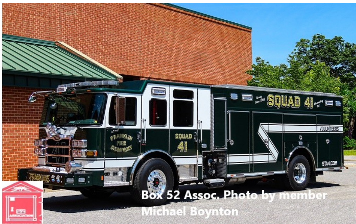
Franklin Volunteer Fire Company Chambersburg Squad 41 2019 Pierce PUC 1500/500