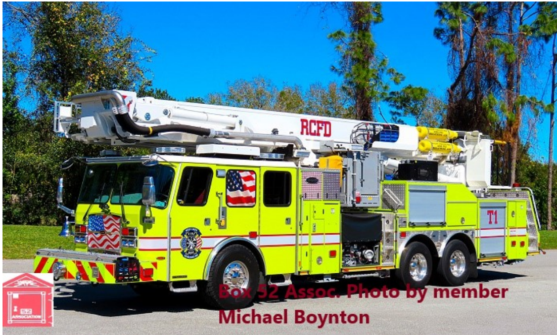
Who doesn't like Disney?!?!? Reedy Creek FD Walt Disney World Tower 1 2019 Emergency One Cyclone 1500/300/116 Bronto Skylift.

As I put the above pages together on Tuesday 29 December the wind is howling and the temps hovering in the lower 30's. So how about some rigs from the Sunshine State to warm us up!