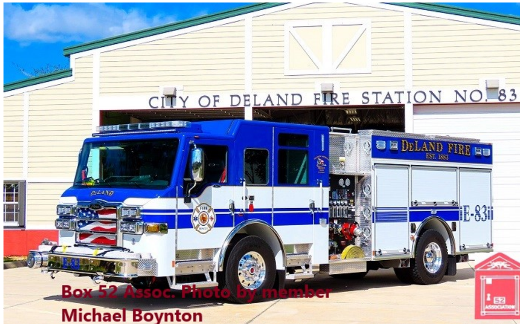
Deland Engine 83 2020 Pierce Impel 1500/500