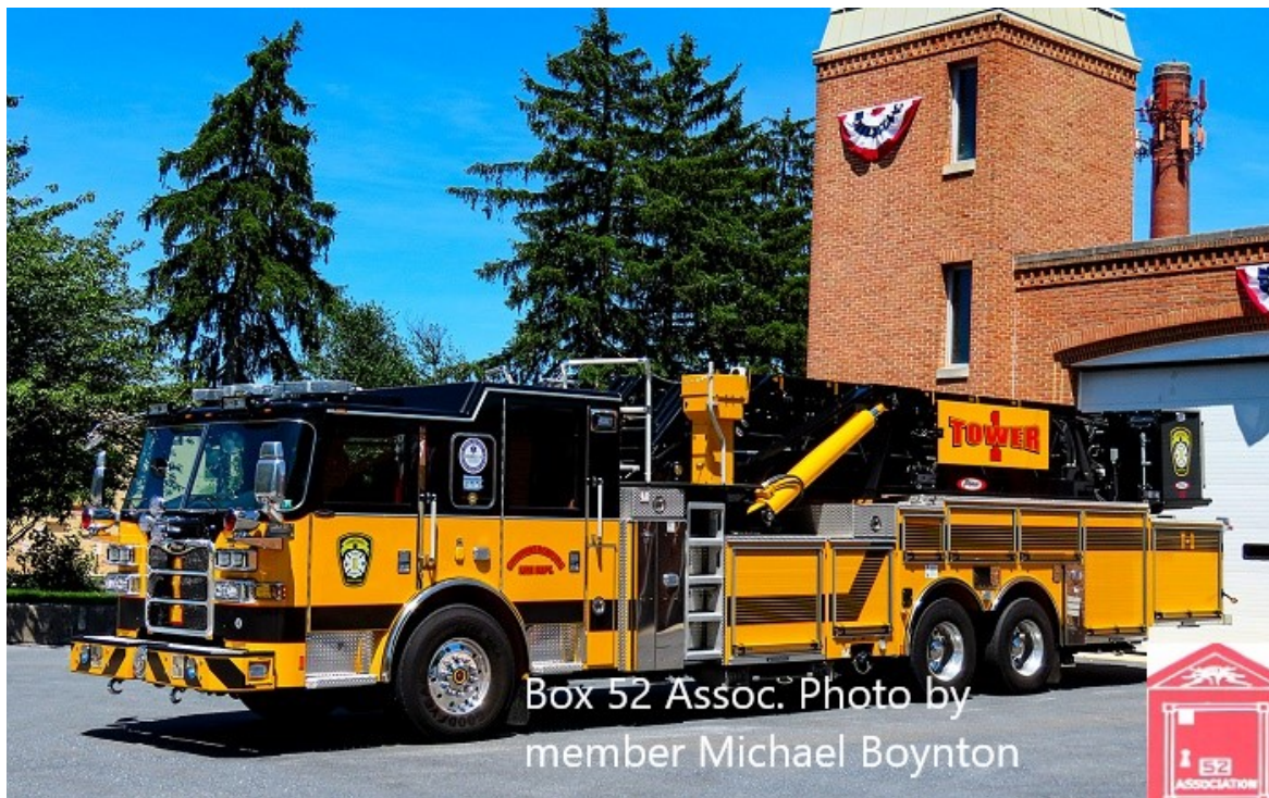
Chambersburg Fire Department Tower 1 Pierce Arrow XT 95 ft. mid-mount Tower