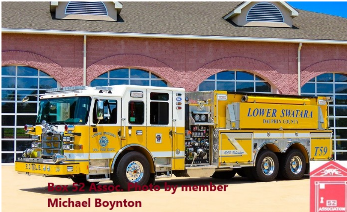
Lower Swatra Volunteer Fire Department Tanker 59 2018 Pierce Enforcer 1500/2500