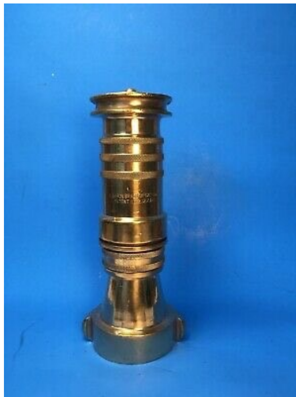
Original fog nozzle patented in 1896. Thus starting a 124 year ongoing argument in firehouse kitchens!