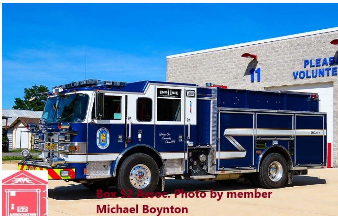
Pleasant Hall Volunteer Fire Company Engine 11-1 2014 Pierce Arrow XT 1500/1000