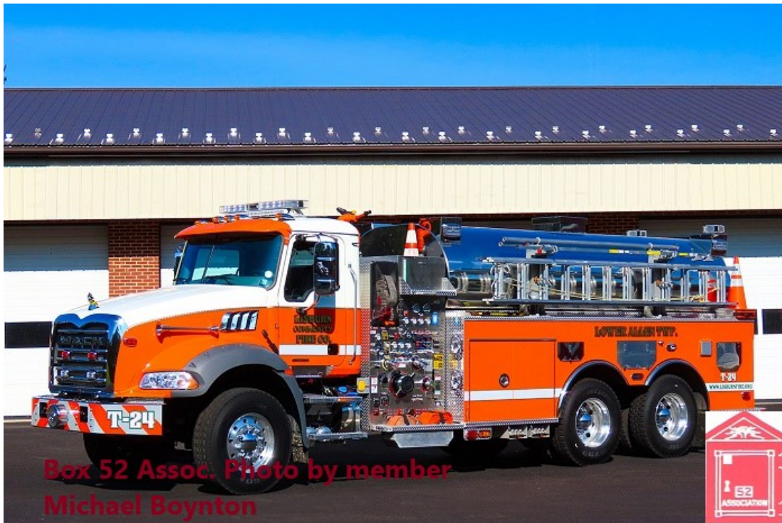
Lisburn Volunteer Fire Company Lower Allen Township Tanker 24 2018 Mack Granite/KME 1500/3000