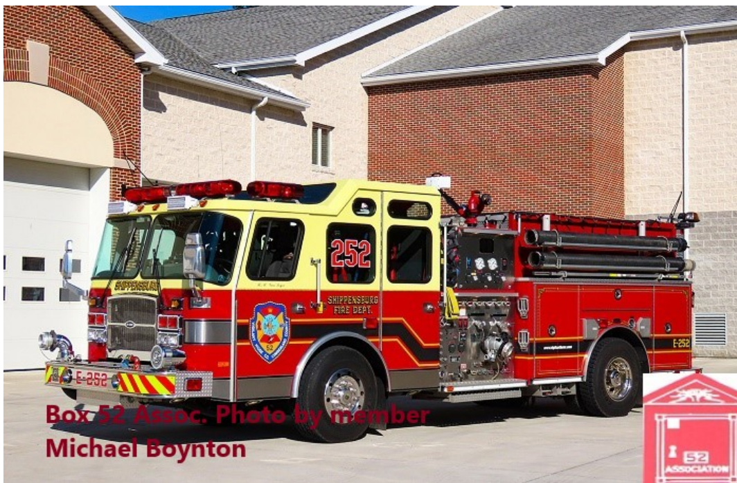
Vigilant Hose Company Engine 252 Shippensburg Township 2005 Emergency-One Typhoon 2000/750/30 class A foam