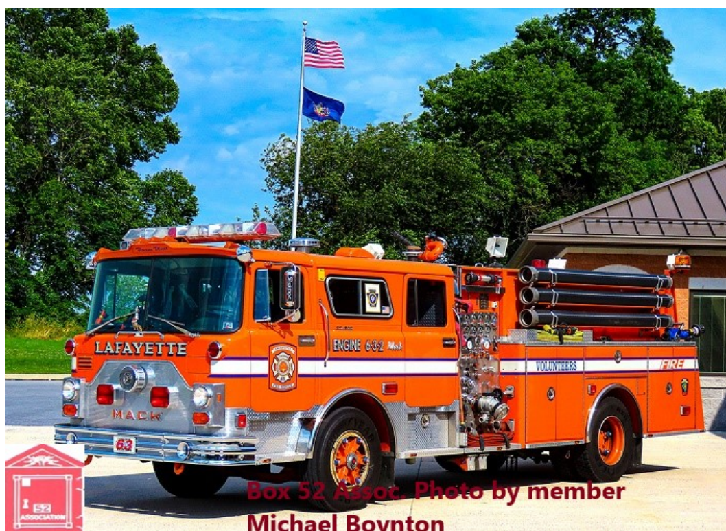
Lafayette Fire Company Engine 632 1978 Mack CF/Pierce 1500/500/200 AR-ARFF foam. Refurb in 1992