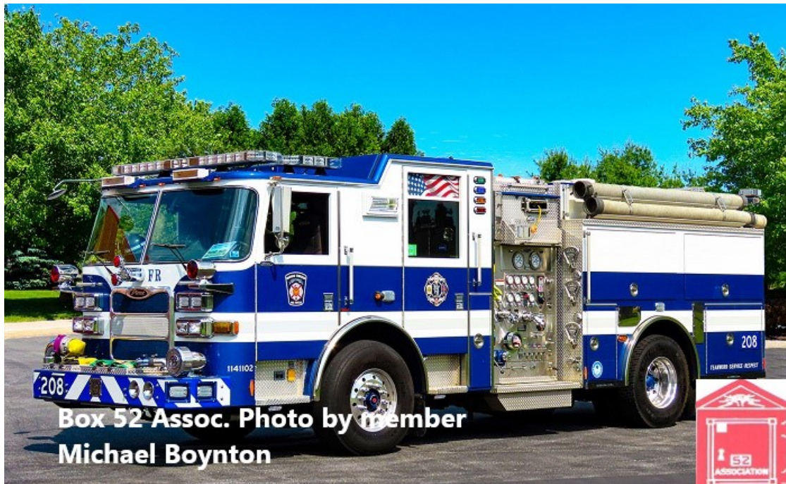
Manhiem Engine 208 2011 Pierce Arrow XT 2000/500