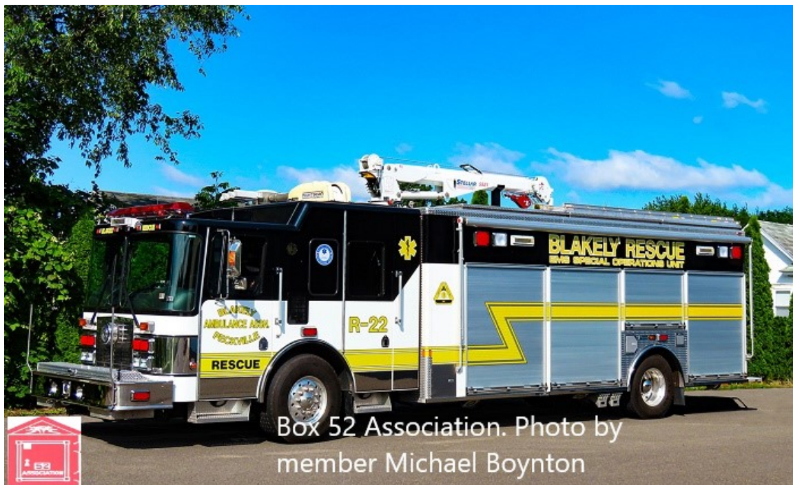
Blakely Ambulance Service Peckville Township Rescue Squad 22 2006 HME/Marion Heavy Rescue