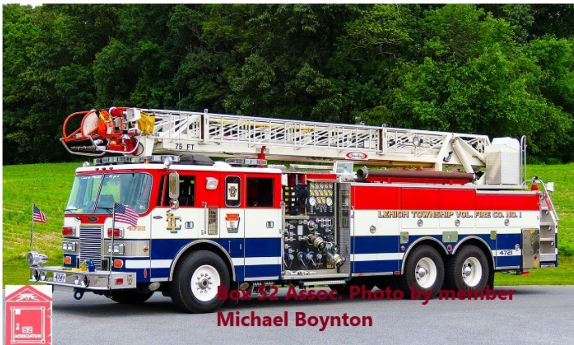
Lehigh Township Ladder 4721 1991 Pierce Lance Quint 2000/600/20 class A foam/75 ft RMA