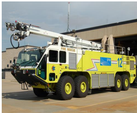
DFW EZ 12 2007 Oshkosh Striker 4500