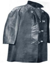
Black Fleece Lined