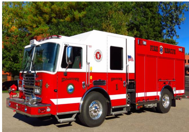
Rigs from Martha's Vineyard, most of us don't see to often. This is Edgartown's Engine 221.