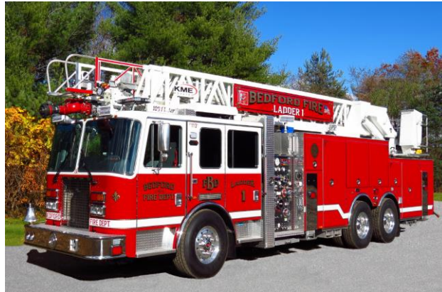
Bedford Ladder 1

Westwood – NEW Ladder 2 – 2014 Ferrara Igniter 1500/500/20A 77' RMA