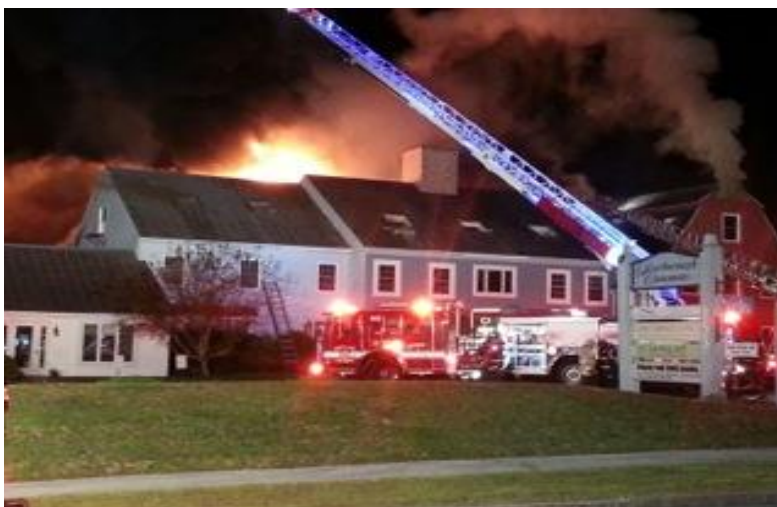
September, Scarborough, ME and mutual aid companies are hard at work at a multiple alarm fire in an Office park development on U.S. Route 1