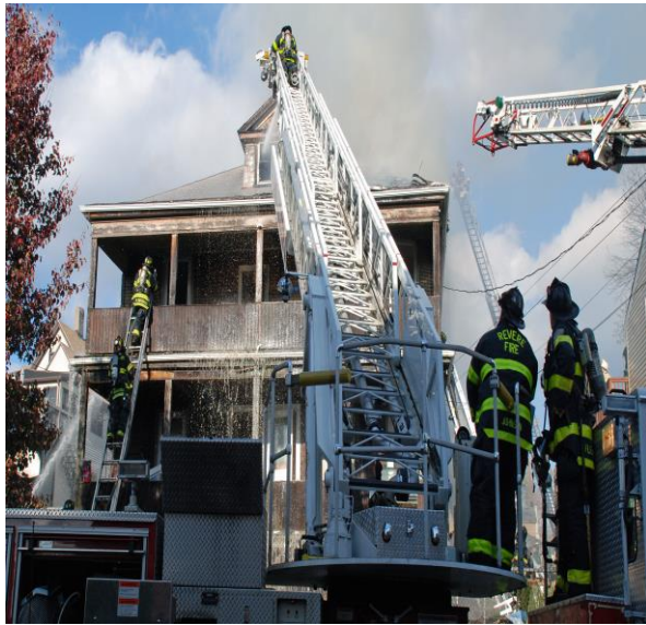
Revere and Mutual Aid Companies work hard to bring this 3-alarm fire under control on Nov. 21 For 924 Winthrop St.