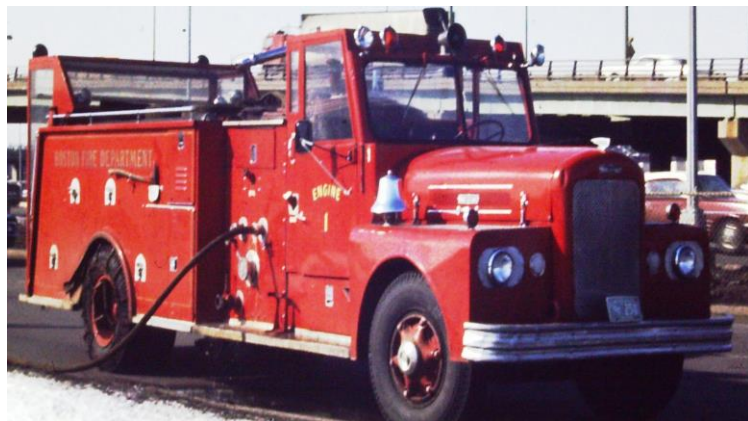
BFD Engine 1 1962 Ward La France, with the chains on.