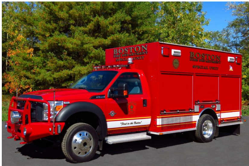
Boston H-2