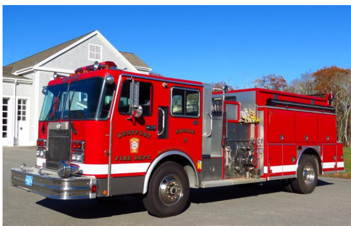
Westport Engine 4

A Box 52 Member who is a retired firefighter submitted this for the enjoyment of our readers. At the Members request I will not reveal who the author is.. Editor