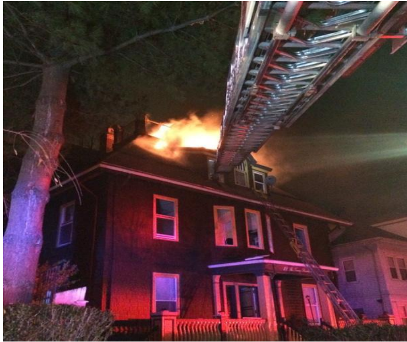
Fire blows out the roof of 22 Lyndhurst St. on Nov. 19, two alarms box 3315