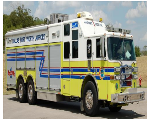
DFW Haz-Mat Rescue 1 2007 Pierce Lance