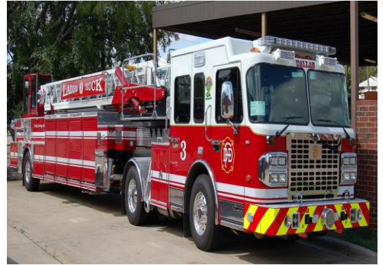
Truck 3 2014 Spartan/ERV 100' tiller