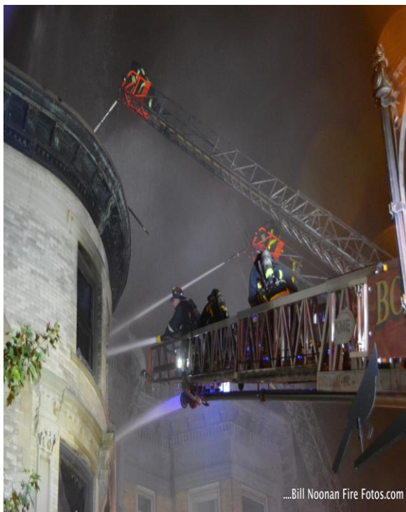
Front of the building with 3 aerials working.