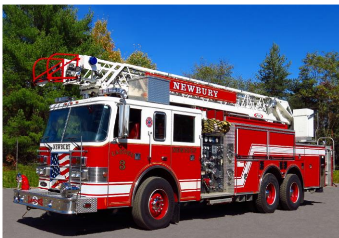
Newbury "Protection No. 2" Ladder 3