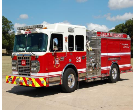
Eng. 25 2011 Spartan/Crimson 1500/500