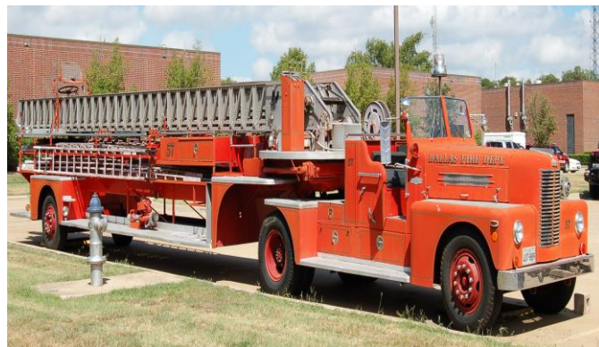
Truck 57 1957 Pirsch 100 ft tiller