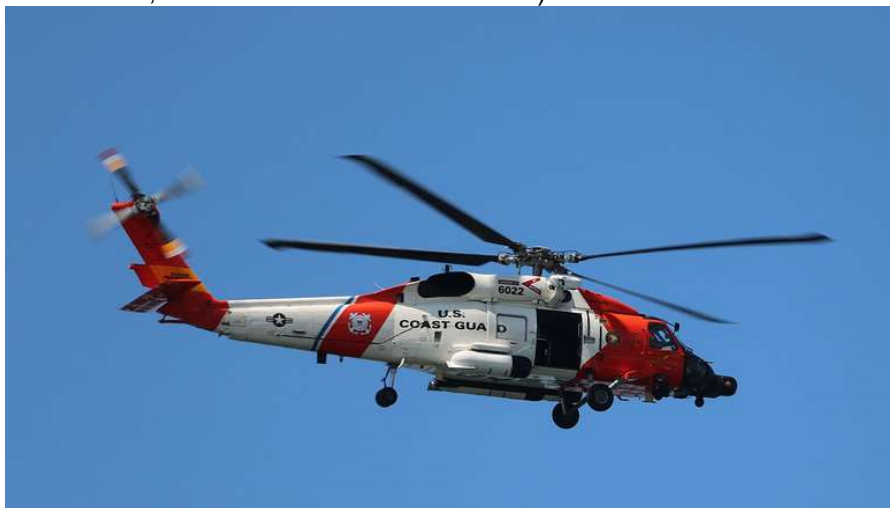
USCG Helo assisting in the search.

At approximately 1030 hours the Nahant Fire Department received a report of a missing diver from the US Coast Guard. In very dangerous seas the duty crew launched the rescue boat and assisted the USCG with the search. NFD was assisted by the USCG, Massachusetts State Police marine unit and dive team, Massachusetts Environmental Police, Swampscott Fire and the Beverly Fire Department dive team. Shortly before noon the Beverly dive team recovered the body of the diver and he was transported by the USCG to Seaport Landing in Lynn for the State Police and medical examiner to conduct their investigation. (Water conditions were not conducive to bringing the diver back to the Nahant Town Wharf, which was the command center).