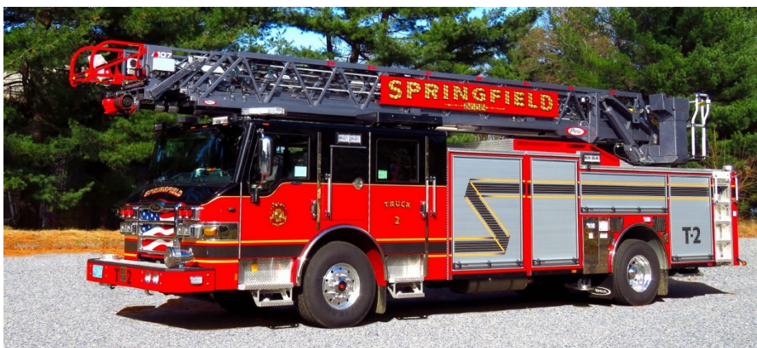
Springfield Truck 2 – 2018 Pierce Velocity Ascendant 107' RMA