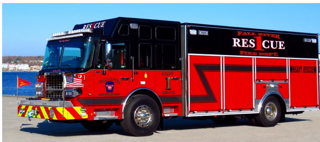
Fall River Rescue 1 – 2018 Spartan/EVI 20' Walk-In Heavy Rescue