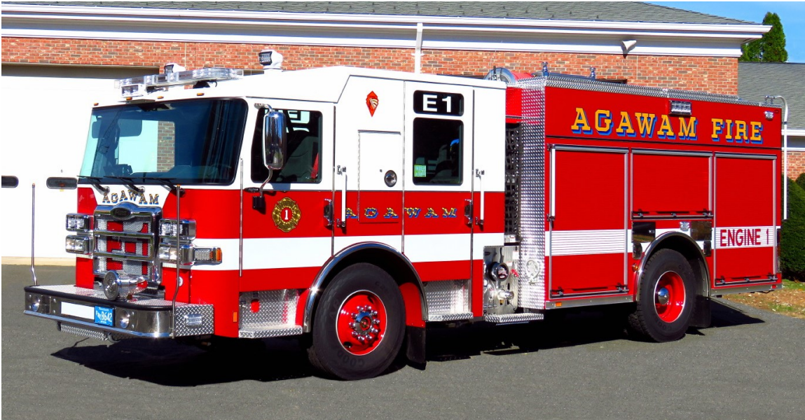
Agawam Engines 1 & 2 – 2018 Pierce Enforcer PUC 1500/750/30B