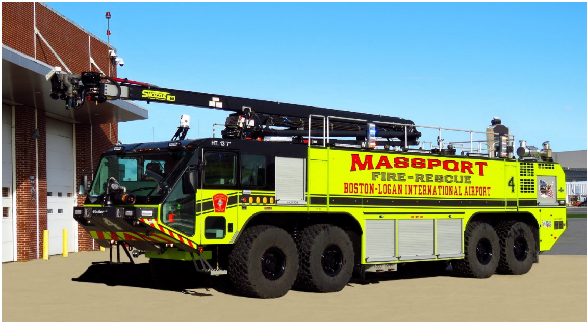
Engine 4 - 2018 Oshkosh Striker 4500 8X8 1950/4500/640 AFF/450 Dry Chem/460 Halotron/65 foot Snozle Boom.

Massport former Engine 5 has under gone extensive rehab at Pierce and has returned and has been assigned as Engine 2. The rig is a 2005 Pierce 1250/1000/125 foam/Medford Engines 4 and 5 – 2018 Seagrave Marauder II 1500/750