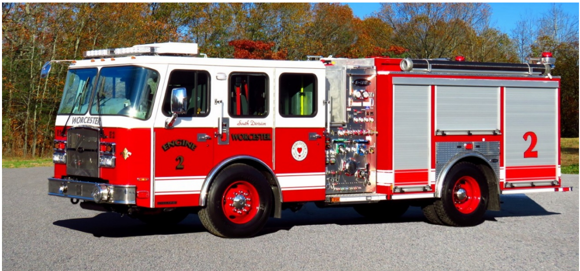
Worcester Engine 2– 2018 E-One Cyclone 1500/500/30B