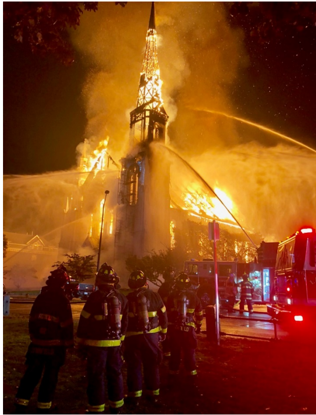
Three fire photos courtesy of Damian Drella