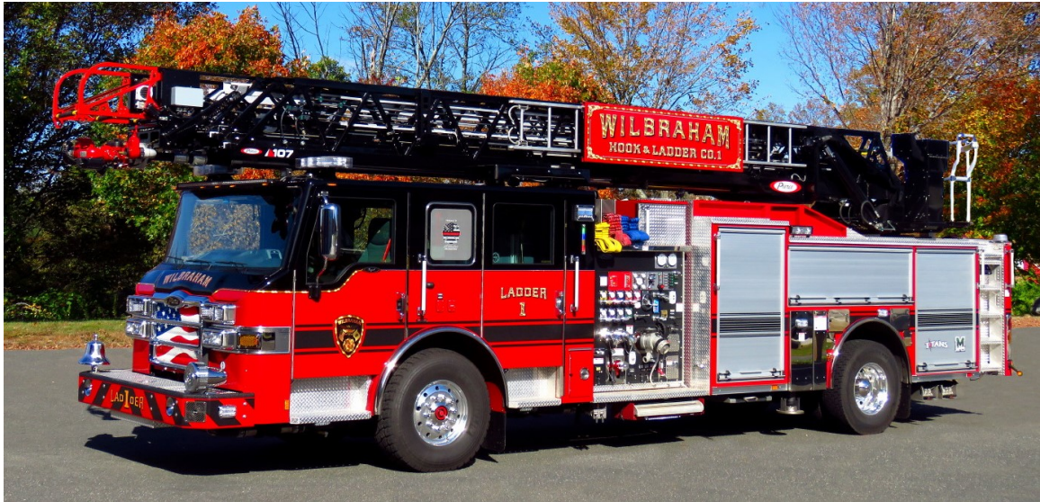
Wilbraham Ladder 1 – 2018 Pierce Impel Ascendant 2000/500/15F 107' RMA