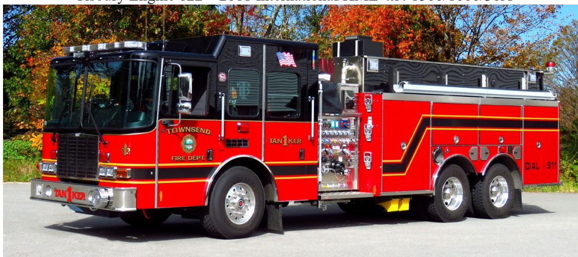
Townsend Tanker 1 – 2018 HME Ahrens Fox 1500/2660/30A