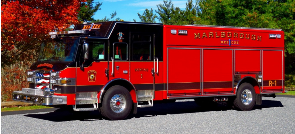
Marlborough Rescue 1 – 2018 Pierce Impel Walk-Around Heavy Rescue