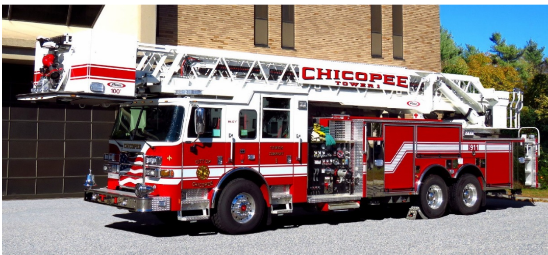
Chicopee Tower 1 – 2018 Pierce Arrow XT 2000/300 100' RMA