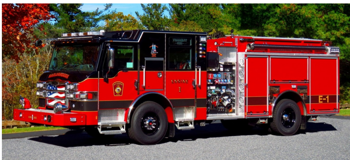
Marlborough Engines 1 & 3 – 2018 Pierce Impel 1500/750/30A/50B