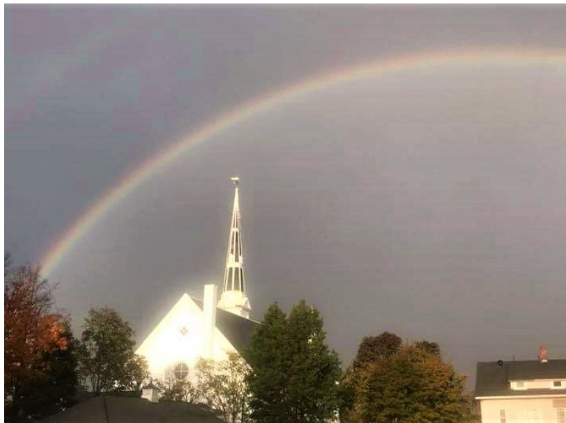
Photo of rainbow over the church on October 23 rd Hours before being struck by lightning strike.