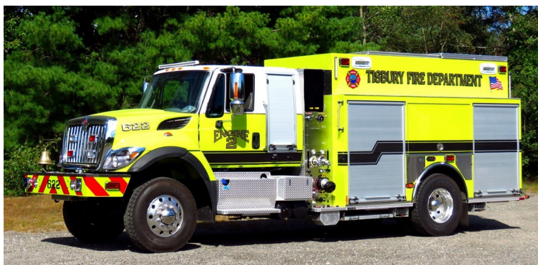
Tisbury Engine 622 – 2018 International/KME 4x4 1500/1000/30A