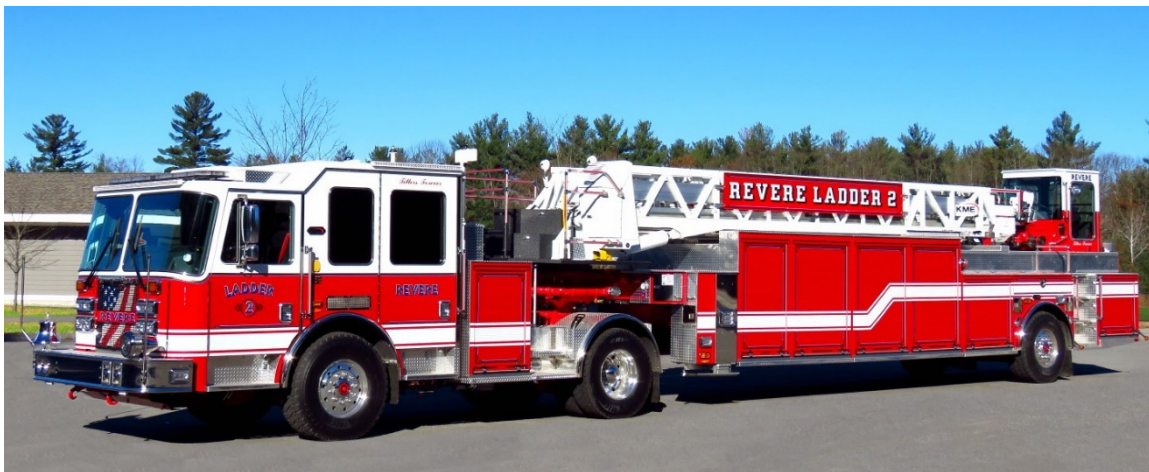
Revere Ladder 2 – 2018 KME Severe Service 101' TDA

Massport former Engine 5 has under gone extensive rehab at Pierce and has returned and has been assigned as Engine 2. The rig is a 2005 Pierce 1250/1000/125 foam/Medford Engines 4 and 5 – 2018 Seagrave Marauder II 1500/750