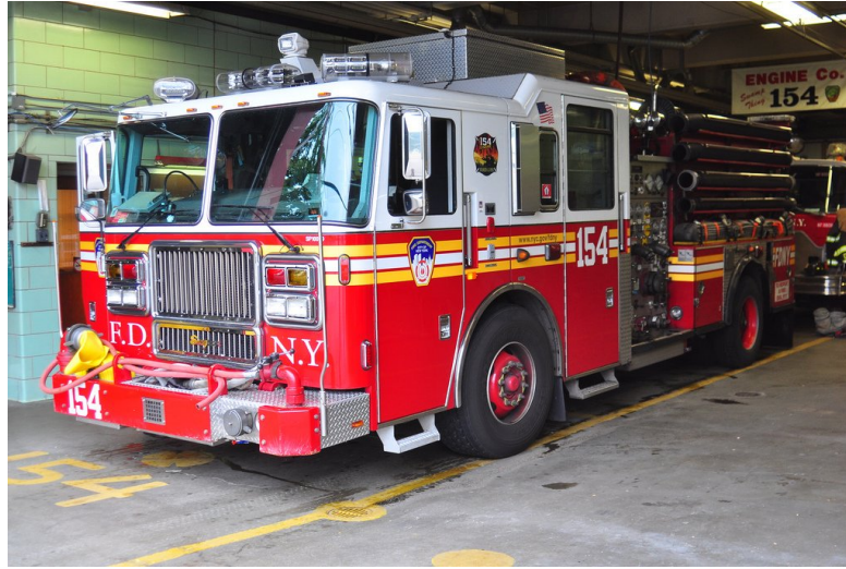
Engine 154 2010 Seagrave . Photo courtesy of NYC Fire Wire.

Sunday night December 9 starts the final tour of E-154. At 0900 hours, Eng.154 is officially disbanded as Squad 8 will move in. E-154 was organized Nov.1st 1905 as E-204. Jan.1st, 1913, they became FDNY Eng 154. In 1975, E-154 was closed during the budget crisis of NYC, reopened in July 1981. According to Jack Leach, Squad 8 is a 2014 Seagrave rescue pumper formerly E-165 which was a Haz Tac Pumper, Squad 8's second section is a 2018 Ferrara HazMat Technician Unit. Engine 154 will be disbanded and its 2010 Seagrave will be reassigned to Engine 165. Expected date for all this to happen is December 10th. Squad 1 will remain and all other Squad Companies will be re-numbered 2 – 7.