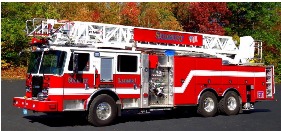
Sudbury Ladder 1 – 2018 KME Severe Service 1500/500 103' RMA