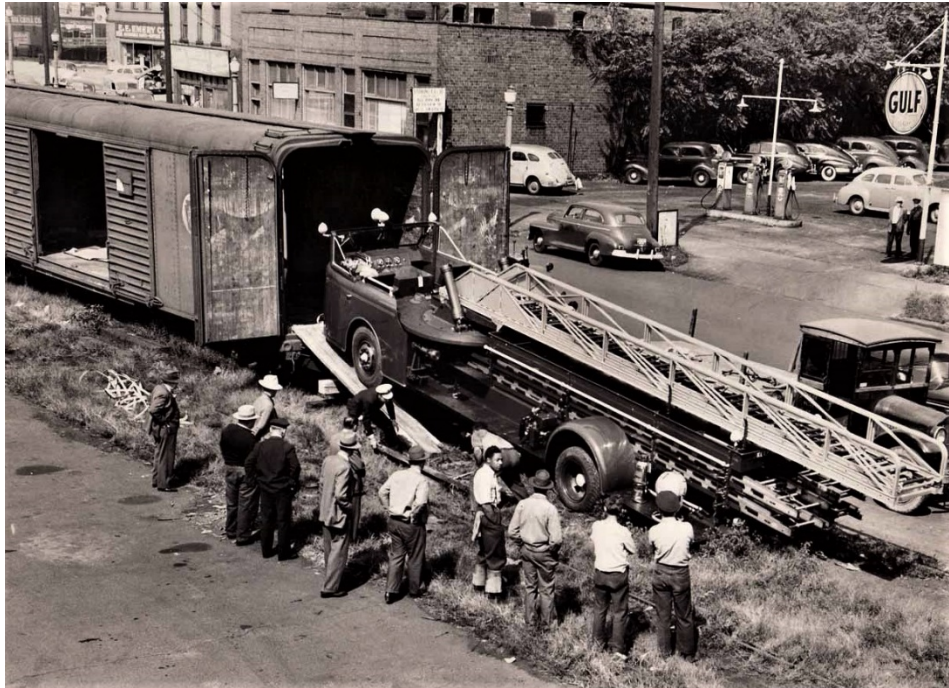
Youngstown, Ohio 1944 JOX American La France aerial being delivered.