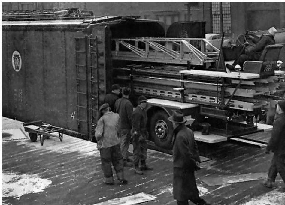
Milwaukee, WI unloading a new ALF 700 series tiller circa 1955.