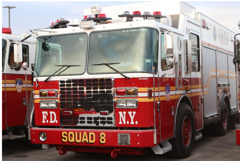
Second Piece of Squad 8 in Staten Island. 2018 Ferrara Haz Mat Tech Support Unit.