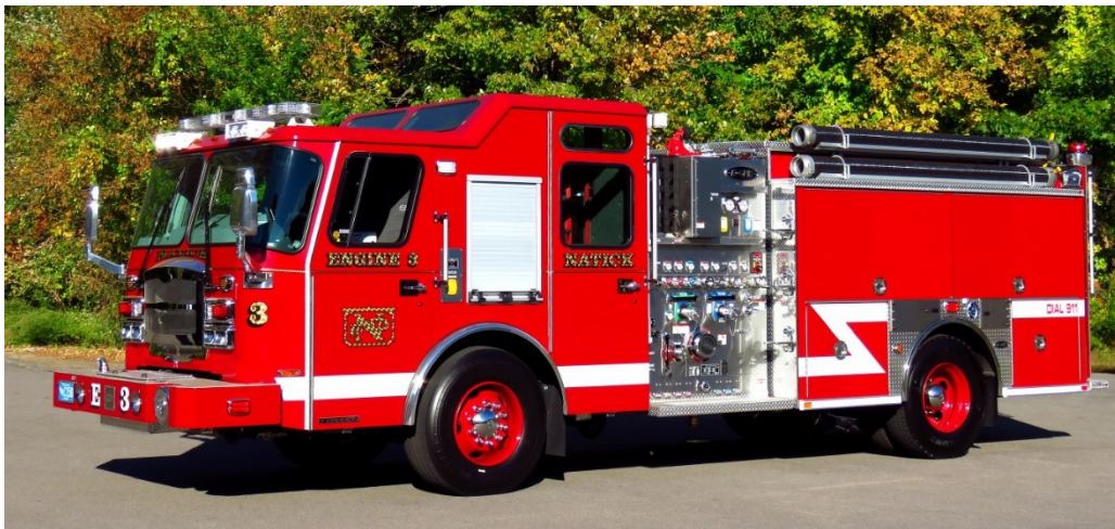
Natick Engine 3 – 2018 E-One Typhoon 1500/985/45B