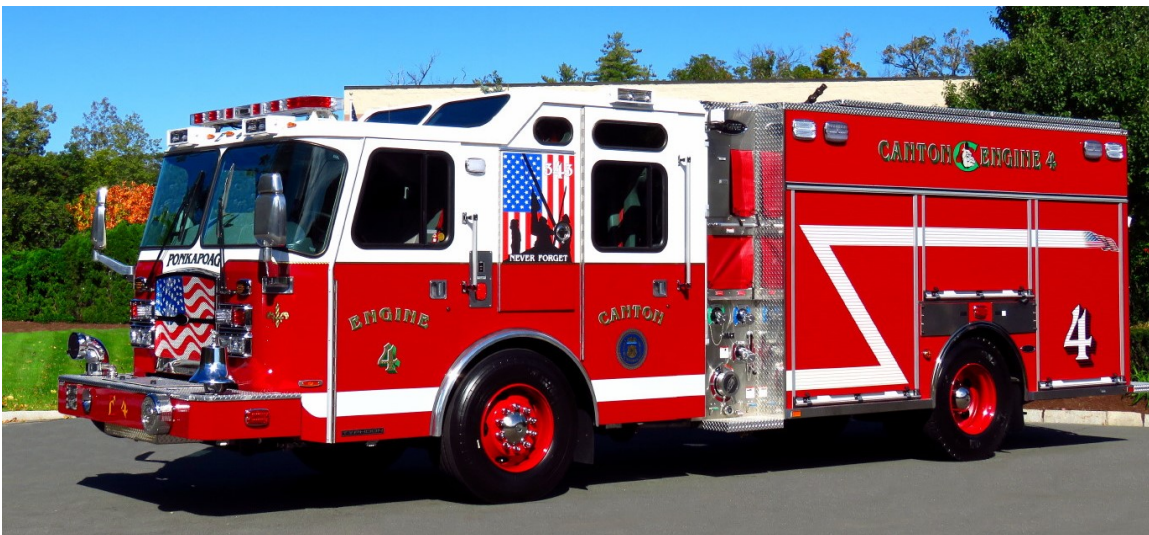
Canton Engine 4 – 2018 E-One Typhoon eMAX 1500/755/25A