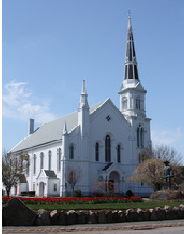
First Baptist Church