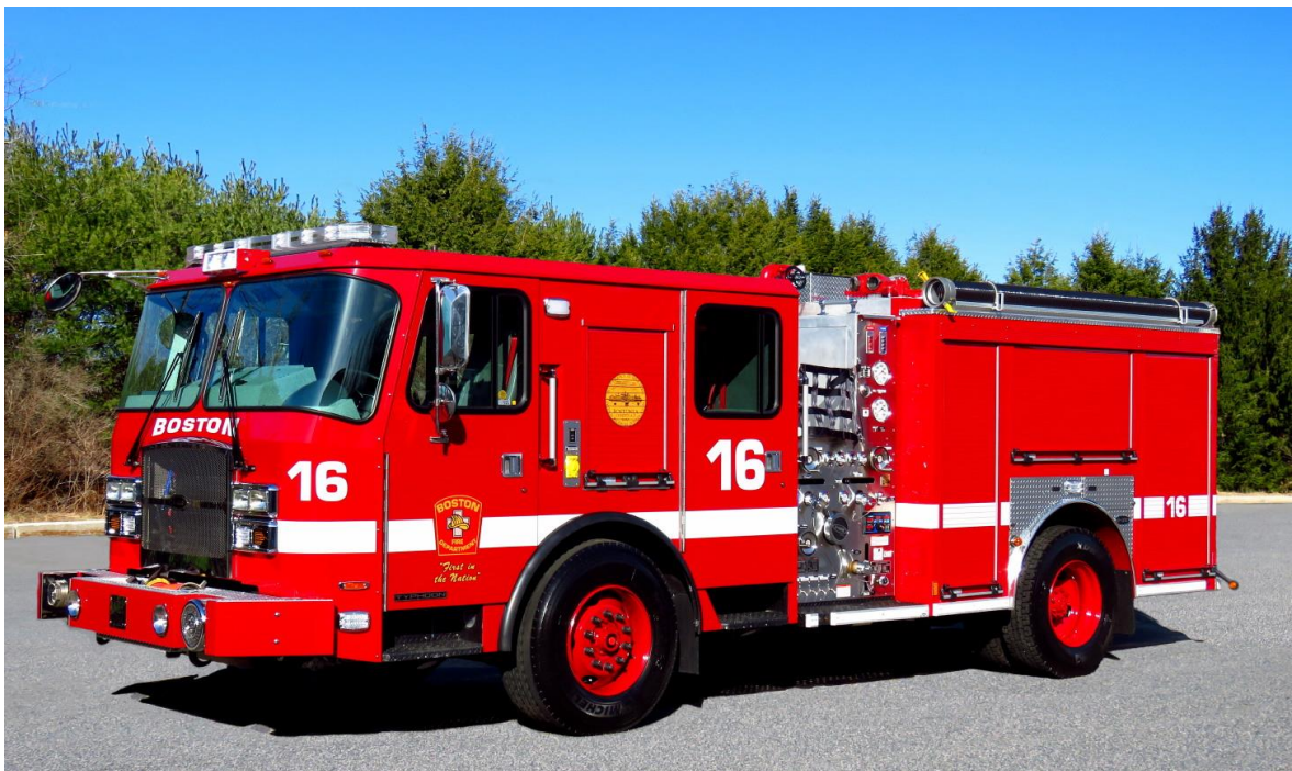
Boston Engine Co. 16 2017 E-One "Typhoon" 1250/560/30 Class A foam