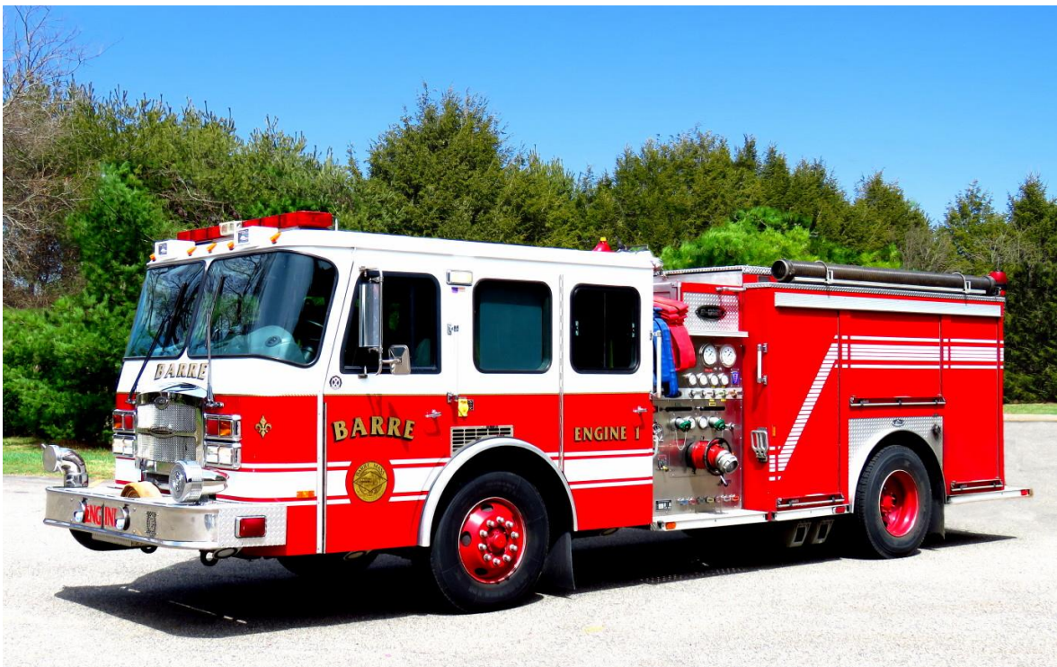
Barre Engine 1 2002 E-One "Typhoon" 1250/500. Former M.F.A. Engine 5, purchased in 2016