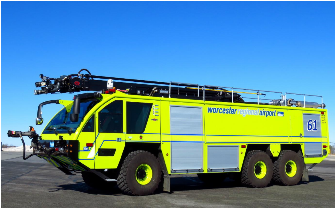
Worcester Airport Engine 61 2016 Rosenbauer "Panther" 1800/3000/400 AFFF/500 lbs. dry chemical/460 of Halotron/54 foot Stinger boom