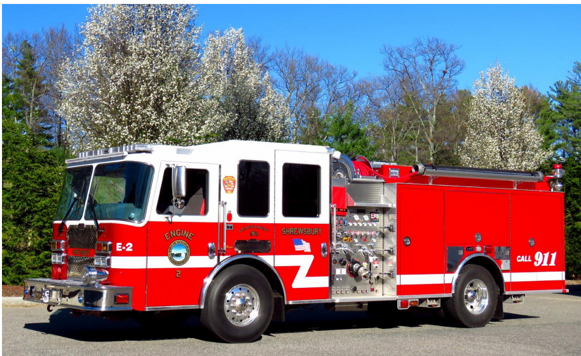
Shrewsbury Engine 2 2017 KME "Predator" 1500/750/ 25 Class A/ 30 Class B foam