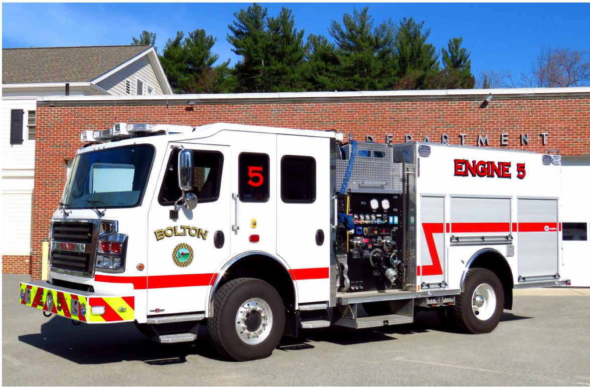
Bolton Rosenbauer "Commander" equipped with four-wheel drive 1500/750/30 Class A foam