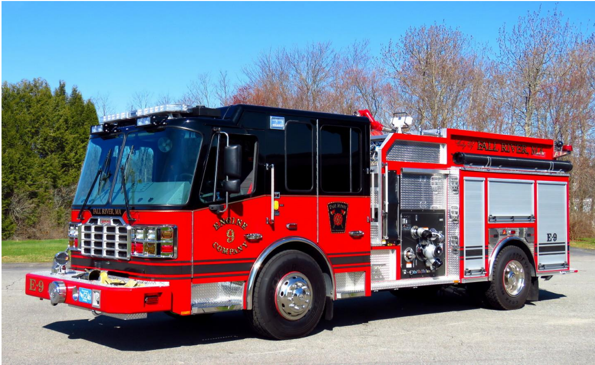
Fall River Engine Co. 9 2017 Ferrera "Igniter" 1500/700/75 Class A foam