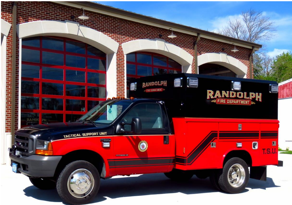
Randolph T.S.U. 1995 Ford F-550 four-wheel drive. Former Fire Alarm Truck, rescue body added