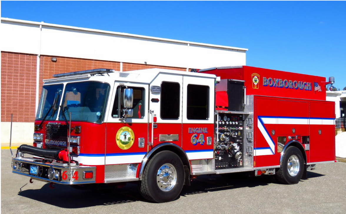
Boxborough Engine 64 2016 KME "Severe Service" 1500/1000/30 Class B foam