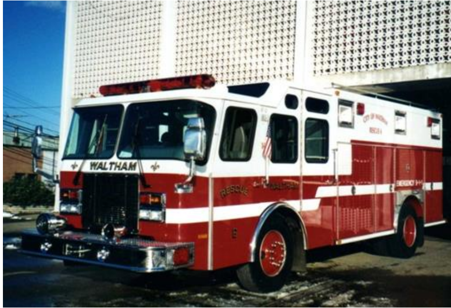
Rescue Company 6 1996 E-One Rescue 250/200

By 2015 Rescue 6 was tired, very tired. She had served the citizens well. Company members started to write specs for a new rig. For the third time the specs went in and the bids opened. This time the winner was Seagrave and in January of 2017 a new heavy rescue arrived. This one had a surprise it came in lettered for Rescue 1! Again the orders went out Rescue 6 is de-activated and Rescue Company 1 is activated.