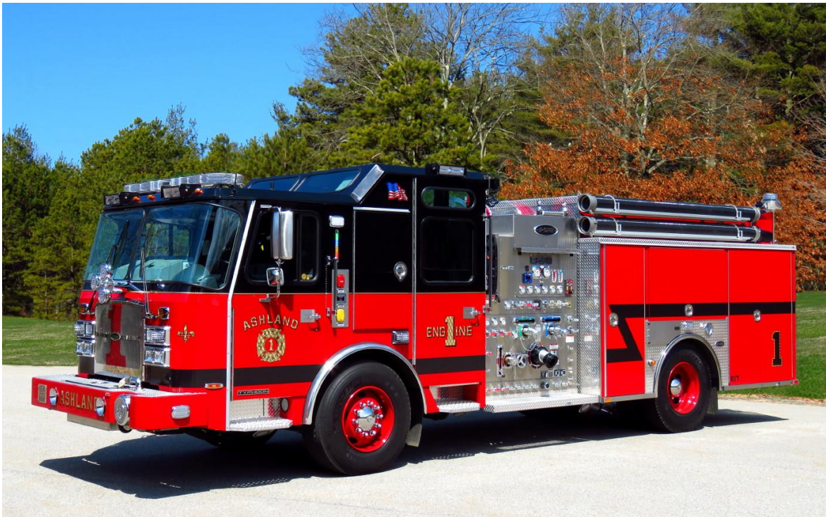
Ashland Engine 1 2017 E-One "Typhoon" 1500/750/30 Class A foam

Mike has sent along a photo report for this issue, so let's show case the rigs!