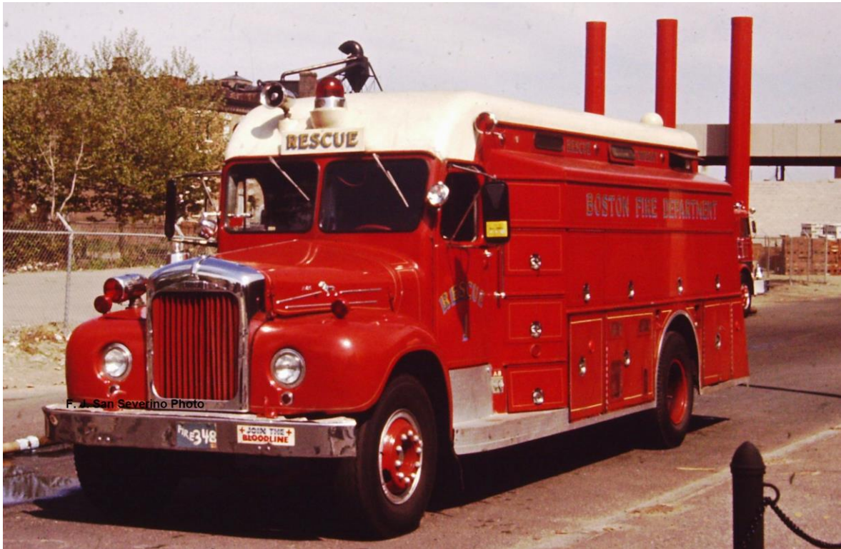
Rescue Co. 1 1964 B-Mack/Gerstanslager.