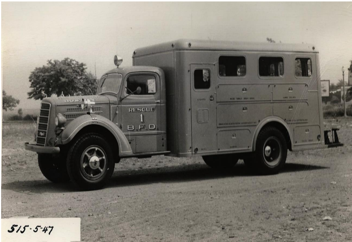
Rescue 1 1947 Mack/Lacey body. One of 3 delivered. Collection of Member F. San Severino

In less than ten years the BFD realized that Rescue 1 could not cover the City effectively and Rescue Company 2 was established and went in service on Friday December 10, 1926 at 0800. Below is the except from BFD General Order 84 dated December 9, 1926