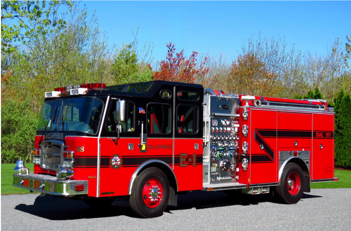
Williamsburg Engine 1 2017 E-One "Typhoon" 1250/1030/30 Class A foam