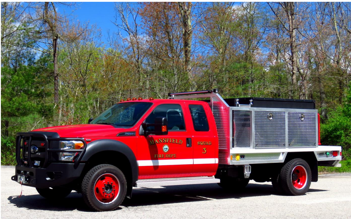
Mansfield Squad 3 2016 Ford F-550 four-wheel drive/Fire-1 220/400