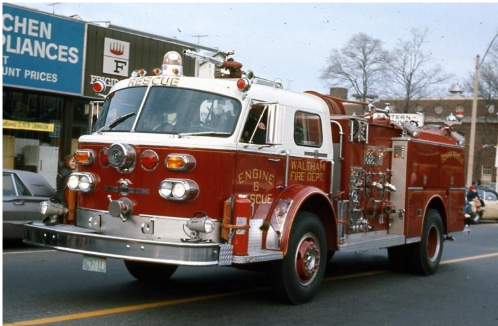
Squad 6 1973 American La France 1000/500

The turbulent 1960's had turned into the 1970's fire departments across the Metro areas were still dealing with anti-war protests, civil unrest, bombings. Against this back drop the fire service was facing new challenges in firefighting and the increasing use of hazardous materials. By 1970 the Waltham Fire Department was operating with 8 Engine Companies and 2 Ladder Companies, with no real rescue equipment. Chief Edward Cloonan needed to equip his Department with a rescue. After making a study the senior officers of the WFD decided to replace Engine Co. 6 with a Squad Company. Specifications were developed and American La France of Elmira, NY won the bid. Upon delivery the pump stocked with equipment and trainings Began. When the day came to put the Squad in-service, the orders came down, Engine Company 6 was de-activated and Engine-Squad 6 placed in-service.