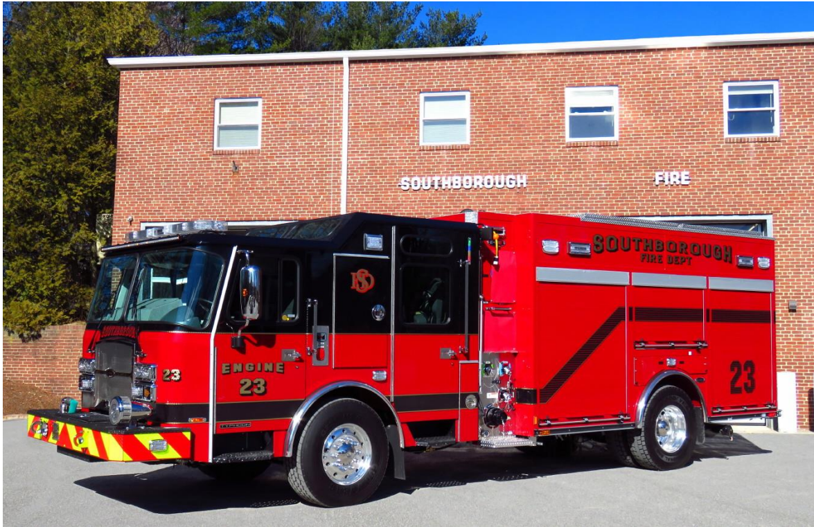
Southborough Engine 23 2016 E-One "Typhoon" 1500/980/ 20 Class A/30 Class B foam