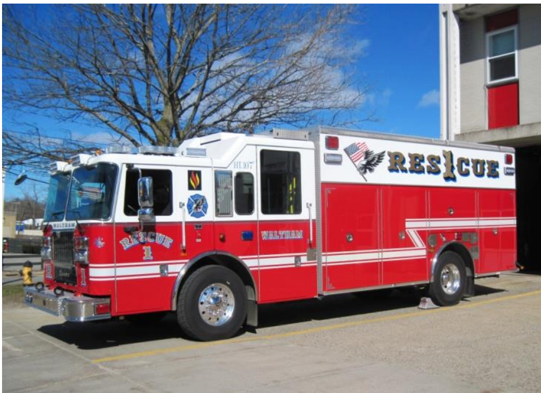
Rescue Company 1 2016 Seagrave

By 2015 Rescue 6 was tired, very tired. She had served the citizens well. Company members started to write specs for a new rig. For the third time the specs went in and the bids opened. This time the winner was Seagrave and in January of 2017 a new heavy rescue arrived. This one had a surprise it came in lettered for Rescue 1! Again the orders went out Rescue 6 is de-activated and Rescue Company 1 is activated.