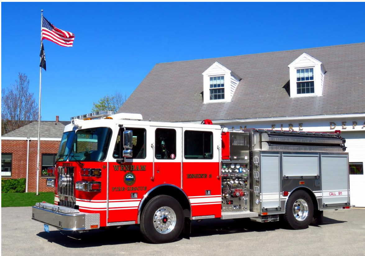
Wenham Engine 3 2016 Sutphen "Shield" 1500/750/ 30 Class B Foam