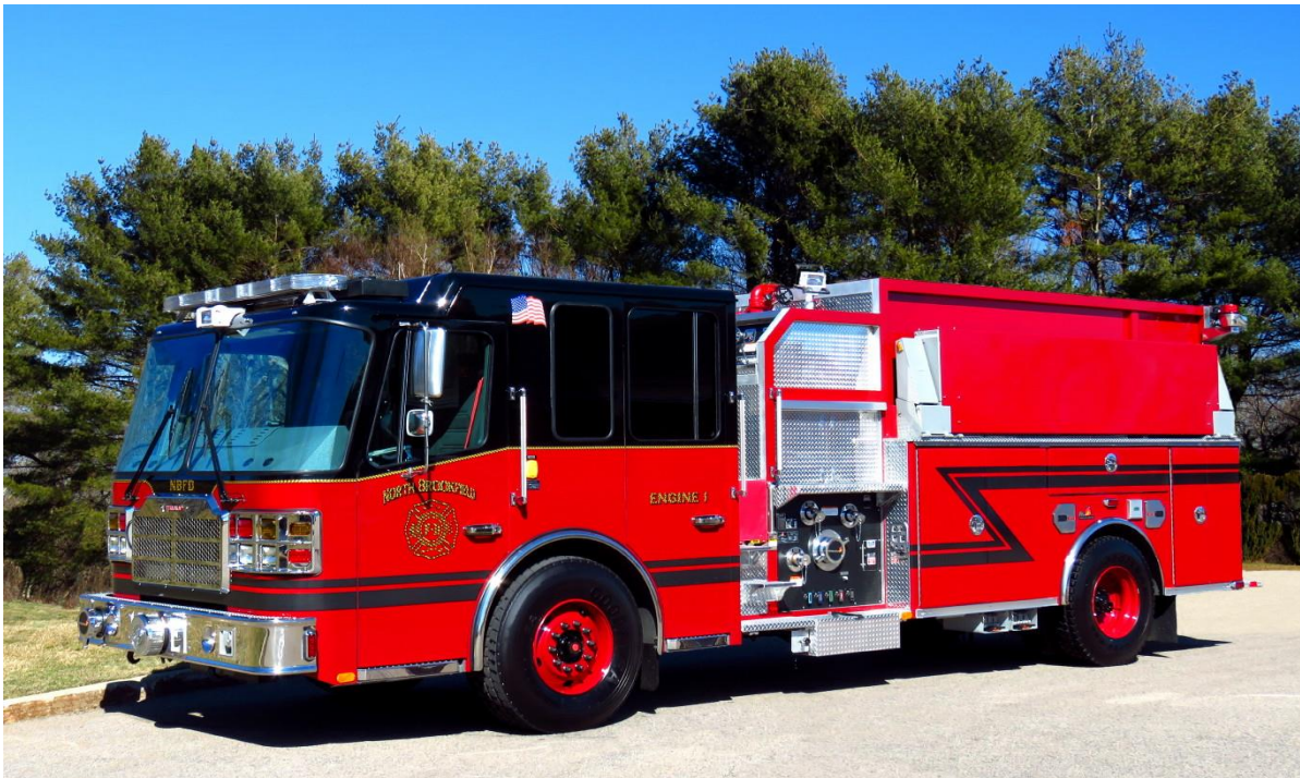
North Brookfield Engine 1 2017 Ferrara "Cinder" 1500/1500/10 Class A foam