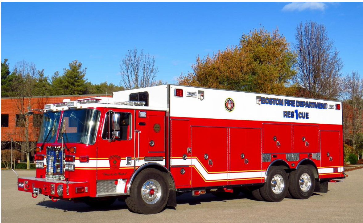
Rescue Co. 1 2015 KME Severe Service.