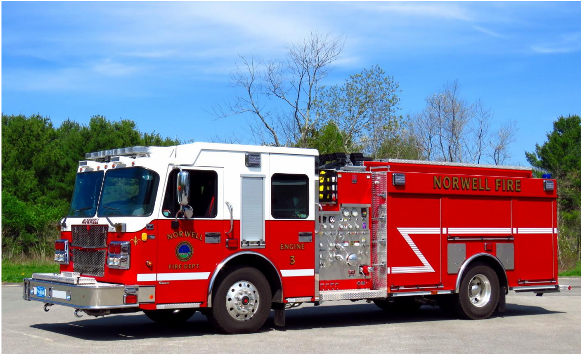
Norwell Engine 3 2017 Smeal "Sirius" 1500/750