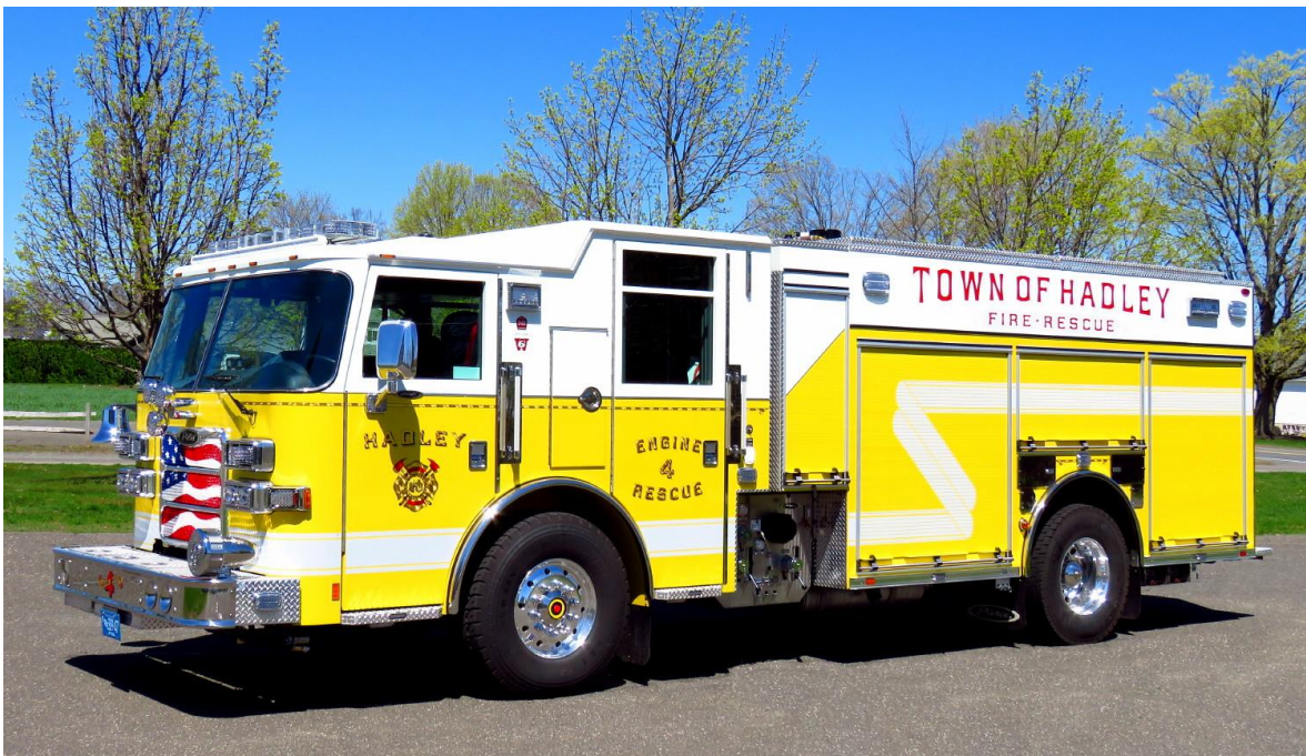
Hadley Engine 4 2016 Pierce "Arrow XT" P.U.C 1500/750/20 Class A foam