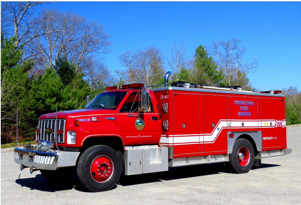
Princeton Rescue 1 1991 GMC "Kodiak"/Supervac. Former Brookville Fire Company of East Brunswick, N.J. In-service 2016