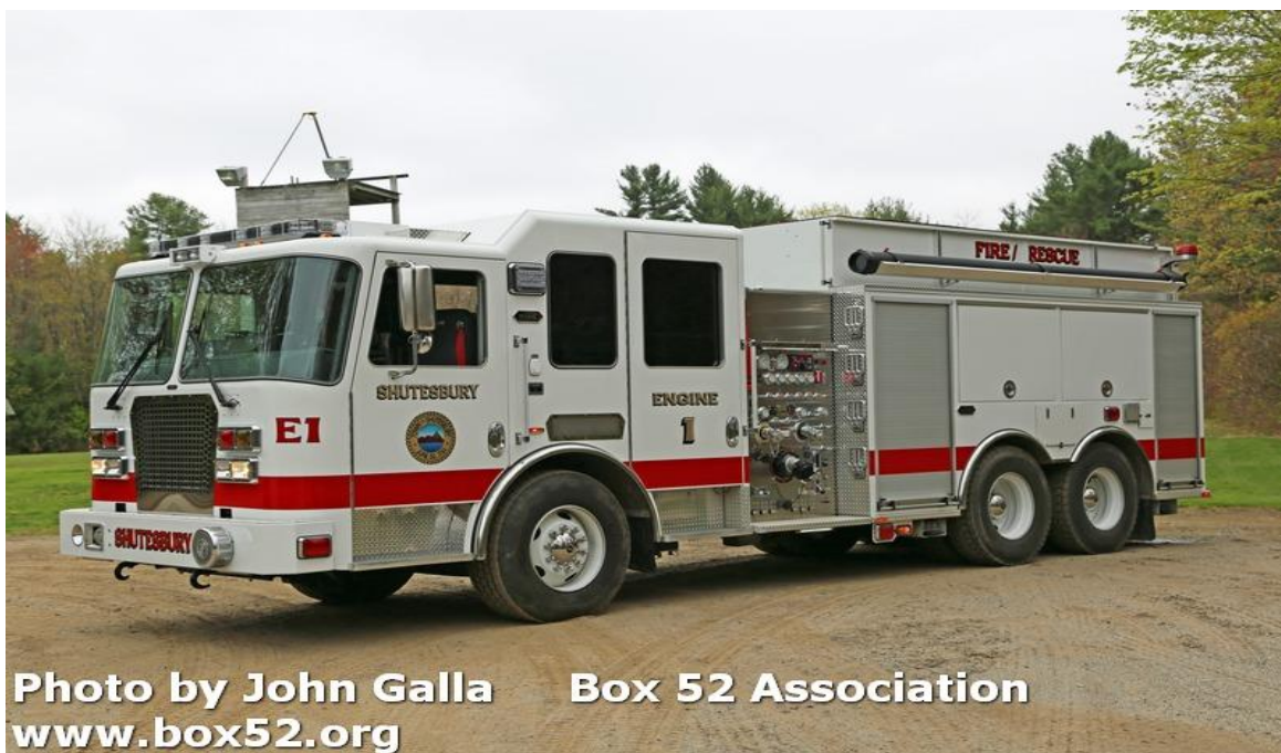
Shutesbury Engine 1 2015 KME Panther 1250/2000/40 gals foam.