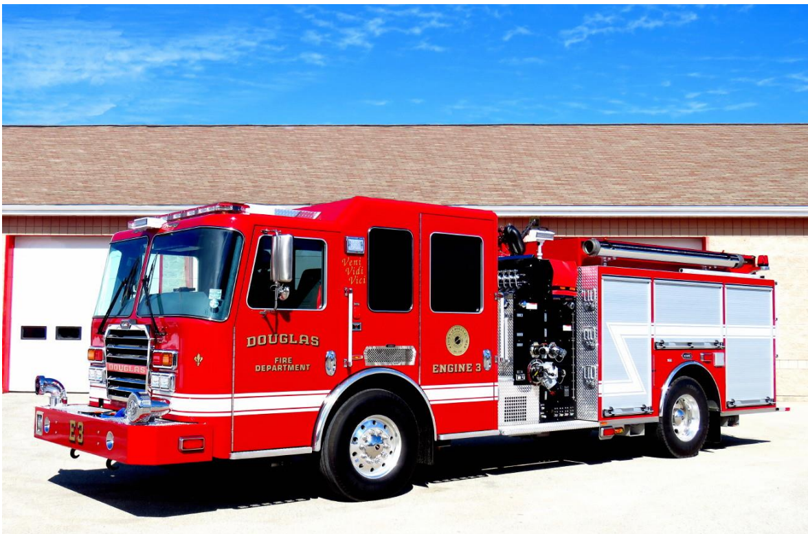
Douglas Engine 3 2017 KME "Panther" 1500/1000/ 25 Class A foam