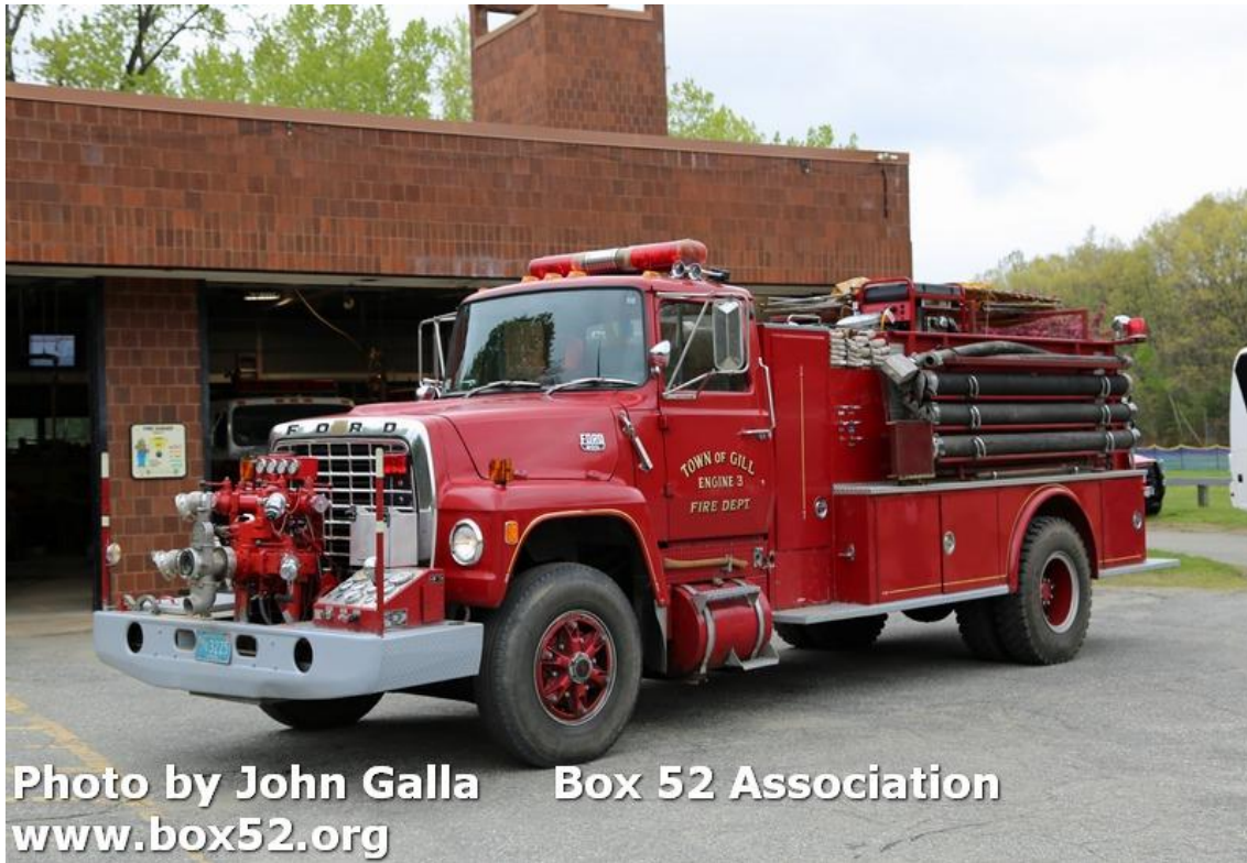
Gill, MA 1980 Ford/Moody 1000/1000