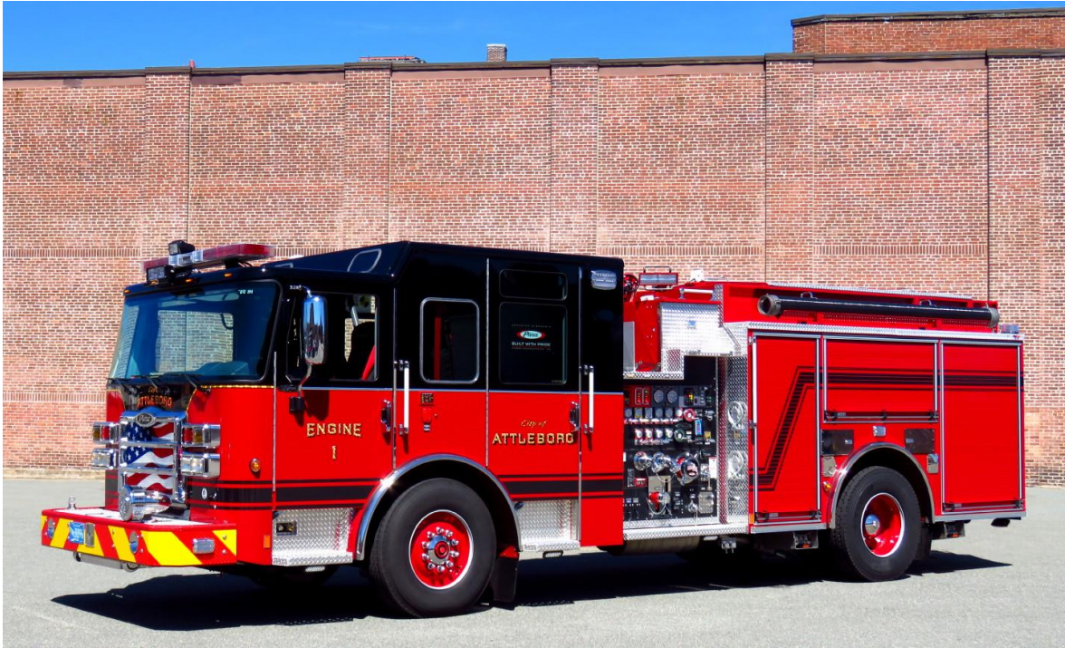
Attleboro Engine 1 2017 Pierce "Enforcer" 1500/750/ 20 A/30 B foam. This Engine is first due into your editors house.