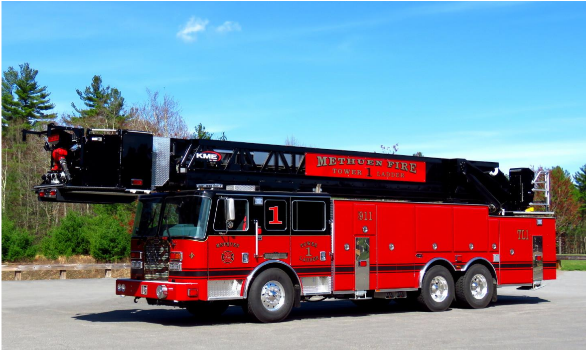
Methuen Ladder 1 2017 KME "Severe Service" 95 foot RMA Tower