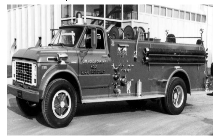
Howe delivery photo of this '71 rig for Jim Hogg County Texas Rural Fire Protection District