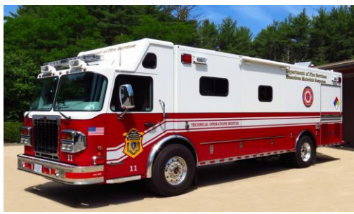
Mass. DFS TOMS 11