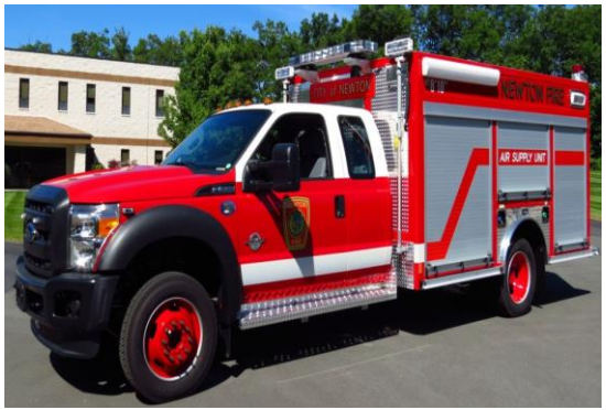
Newton Air Supply