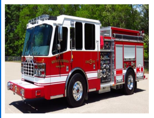
North Attleborough Engine 3