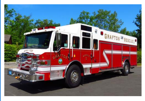
Grafton Rescue 1