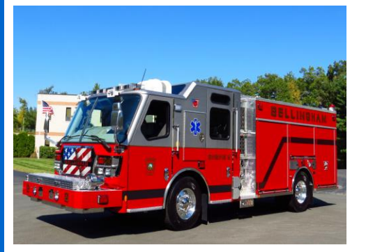
Bellingham Engine 2