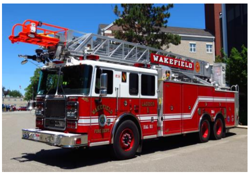
Wakefield Ladder 1