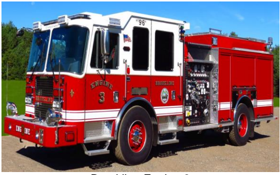
Brookline Engine 3