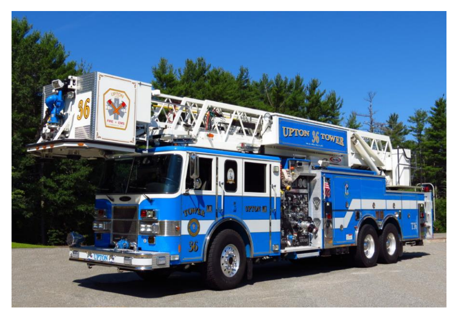
Upton Tower 36