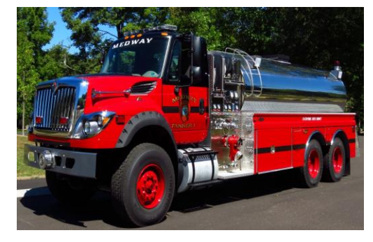
Medway Tanker No. 1