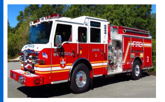
Weymouth Engine 3