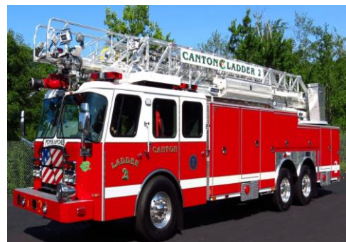
Canton Ladder 2