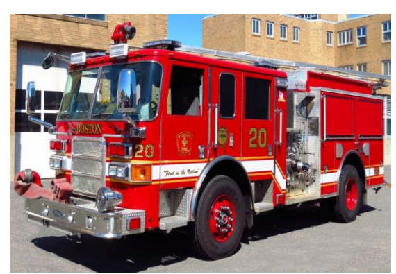
Boston E-20's re-habbed 2003 Pierce

Tewksbury – "New" Engines 1 and 2 – 2008 Pierce Velocity PUCs 1500/750/20A/40B Upton – "New" Tower 36 – 2000 Pierce Dah 1500/500 85' RMA West Stockbridge – NEW Engine 1 – 2014 Spartan ERV 2000/1000/30F West Tisbury – NEW Breaker 731 – 2013 International/V-Tec 300/750/20F Worthington – NEW Engine 1 – 2014 International/E-One 4x4 1250/500/20F