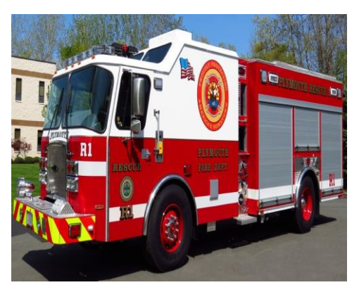
Plymouth Rescue 1