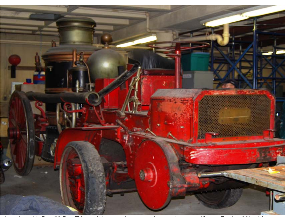
In keeping with Box 52 Bus Trip tradition, you just never know what you will see. Engine 39's old steamer with a Christie Front drive!