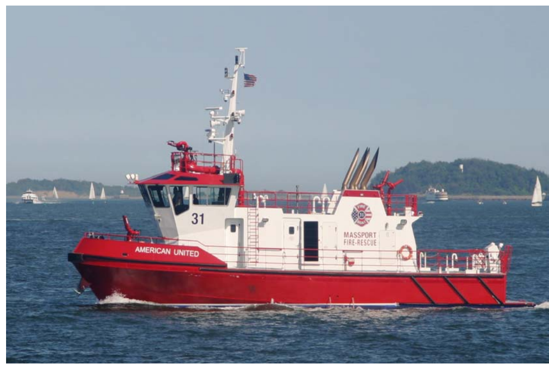
MASS PORT Marine 31 American-United out and about in the harbor on a late, lazy August summer afternoon.