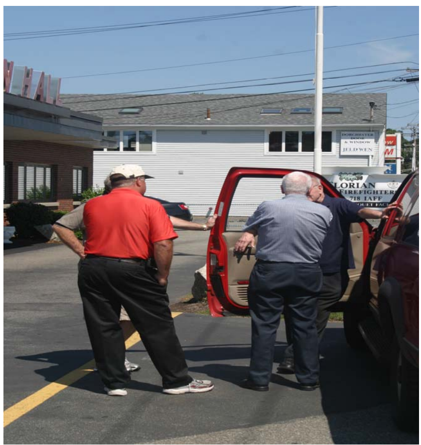
Old friends play catch up.