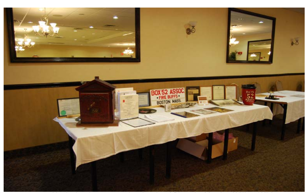
No doubt who was running the show!

Box 52 members, buffs, firefighters and families all made the trek to Florian Hall on Sunday August 26<sup>th</sup>. Vendors were on hand selling just about anything firematic. BFD rotated Companies in for photos during the four hour event. The big hit of the day was the Member Display Area where several of our Members displayed prized parts of their own unique collections. As you entered this room it was dominated by the Box 52 telegraph fire alarm box for all to see. Weather was great, as was the camaraderie!