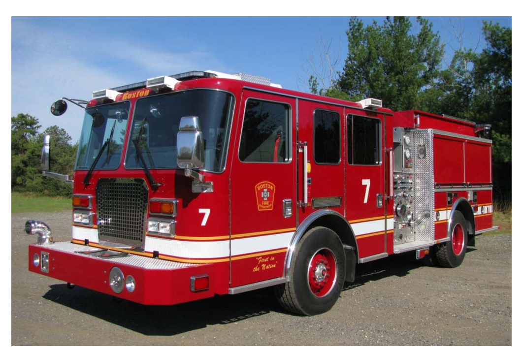
One of three new KME 'Severe Service' pumps recently put in service.