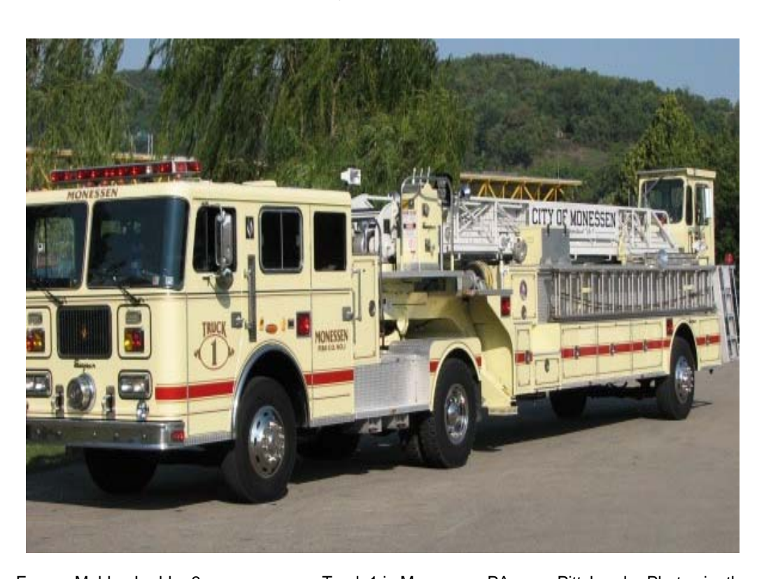
Former Malden Ladder 3, now serves as Truck 1 in Monessen, PA. near Pittsburgh..