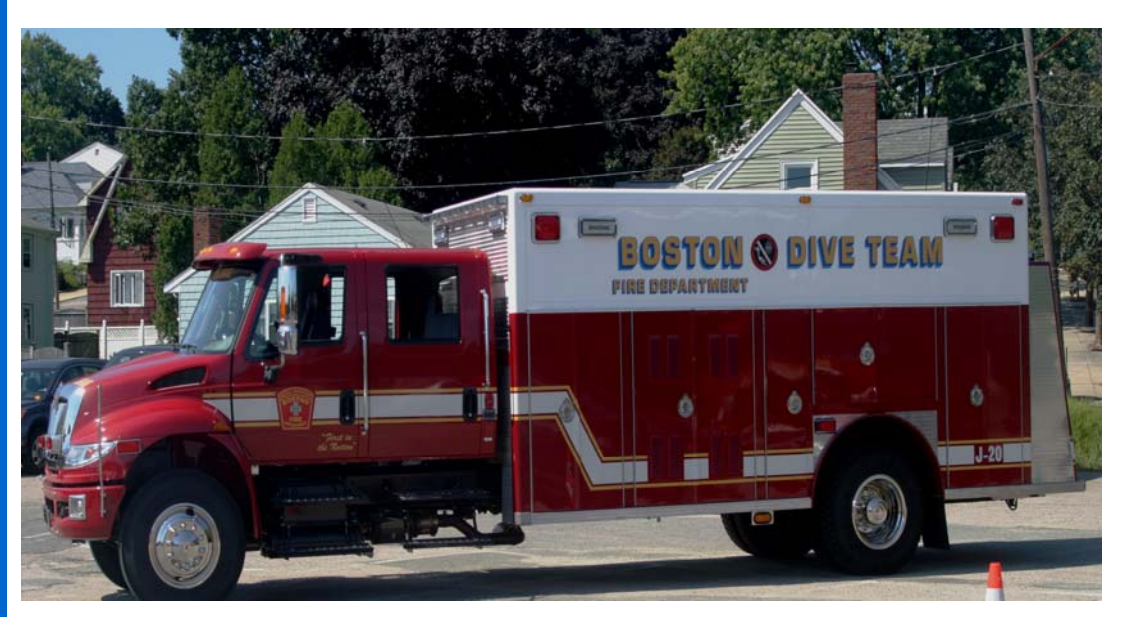
Dive Team 'J-20', photo taken at the Box 52 Open House.