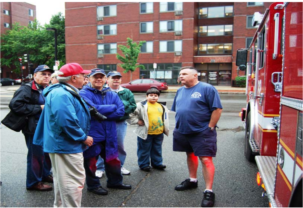
On Tremont Street at 22's House.

The day dawned rainy, but by lunch time it was clearing off. Over 40 members and guests toured the facilities of the B.F.D.