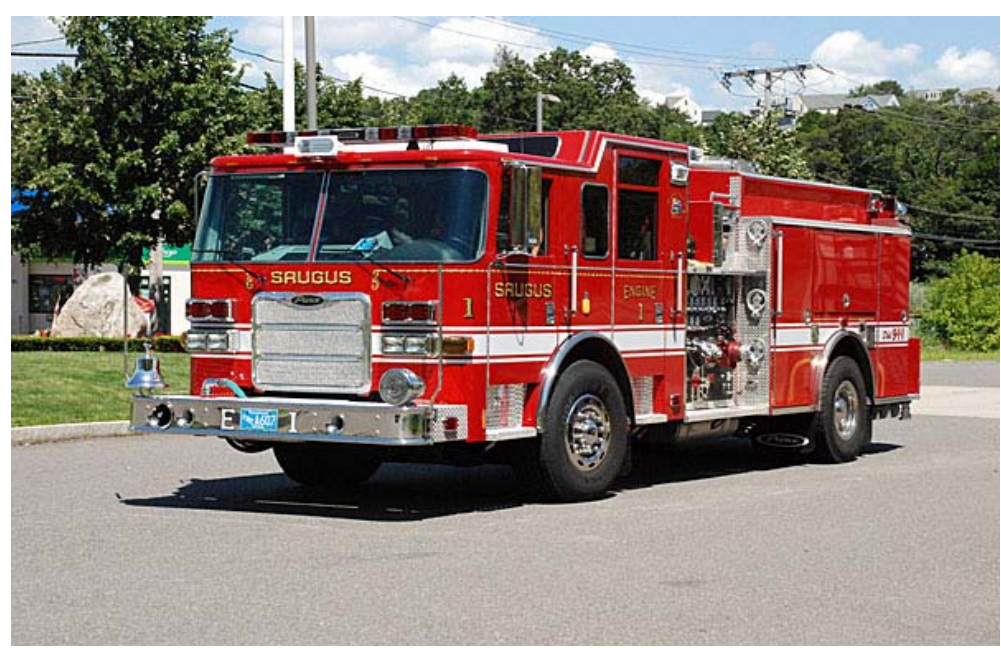
Saugus Engine 1