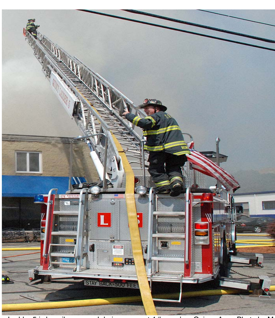
Quincy Ladder 5 is heavily engaged during a recent 4 'bagga' on Quincy Ave.