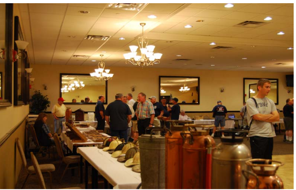
Another view of the display area.