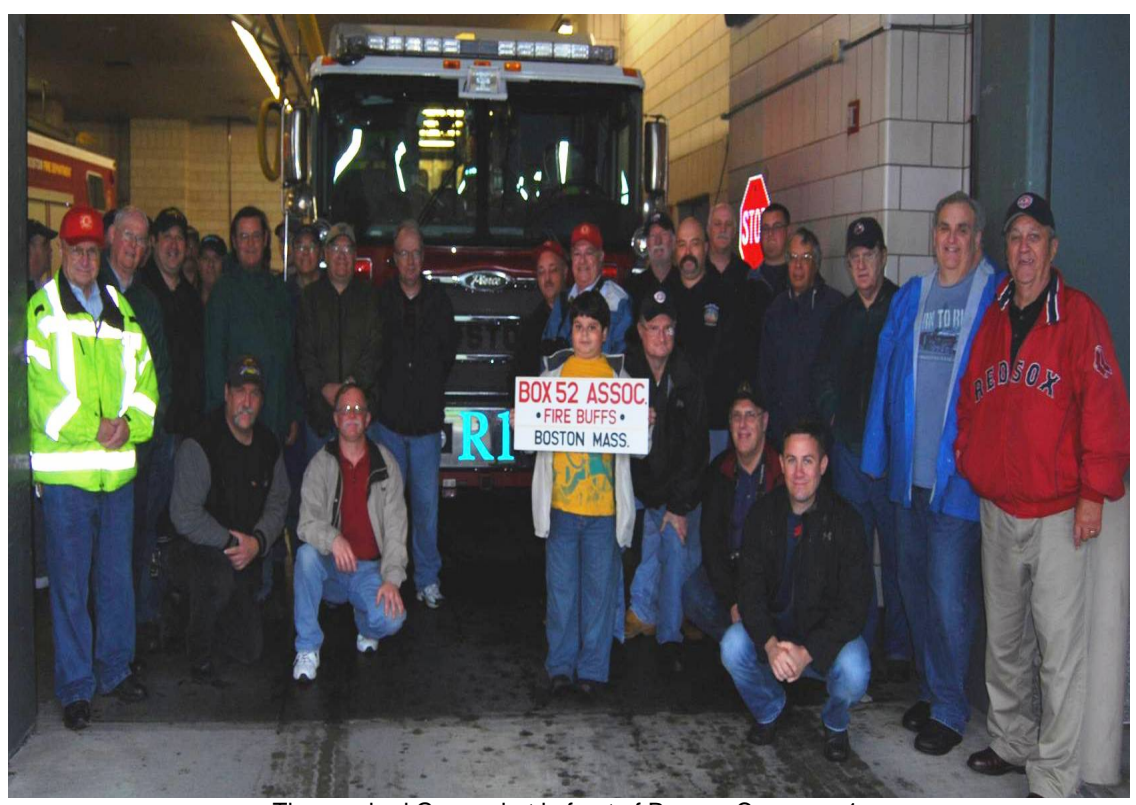
The required Group shot in front of Rescue Company 1.