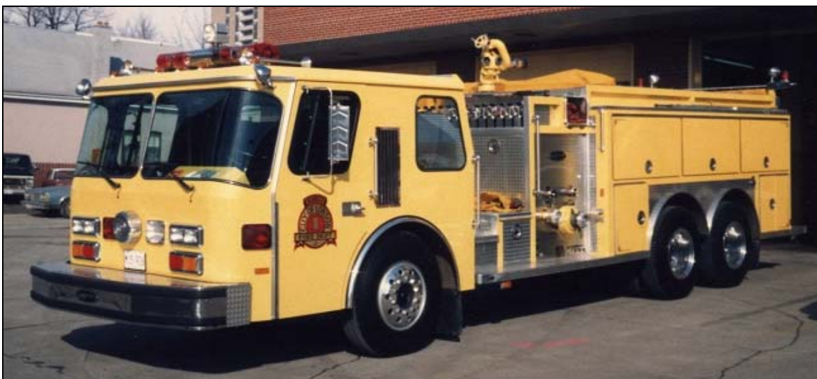
A look back at London, two shots of their 1986 E-One Hurricane pumper, likely the first delivered in Canada. It started as Engine 1, above, then spent time at 6's, then 8's, then finally retired from Engine 10, pictured below with a new paint job. It was equipped with a 1050igpm pump and 800gwt.