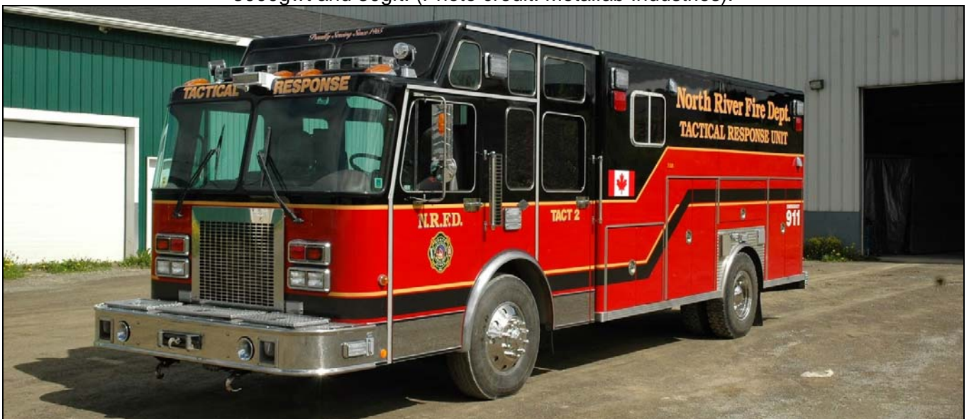
North River, PEI's Tactical Response Unit was recently rehabbed by Metalfab. It is an Allain product on a 1996 Spartan Metro Star chassis. (Photo credit: Metalfab Industries).