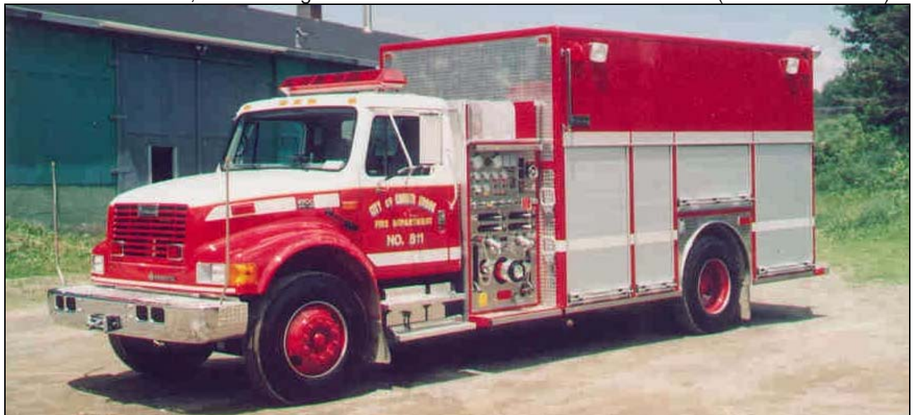
From Corner Brook, NL, this unique 1998 IHC/Metalfab rescue-pump, 625igpm/200gwt. (Metalfab)