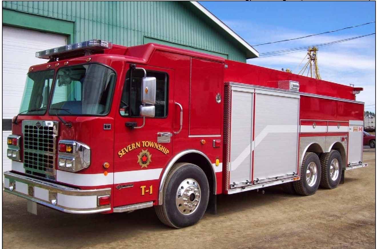
Severn Township received this 2014 Spartan Metro Star X/Metalfab 2500 gallon tanker (Metalfab Fire)