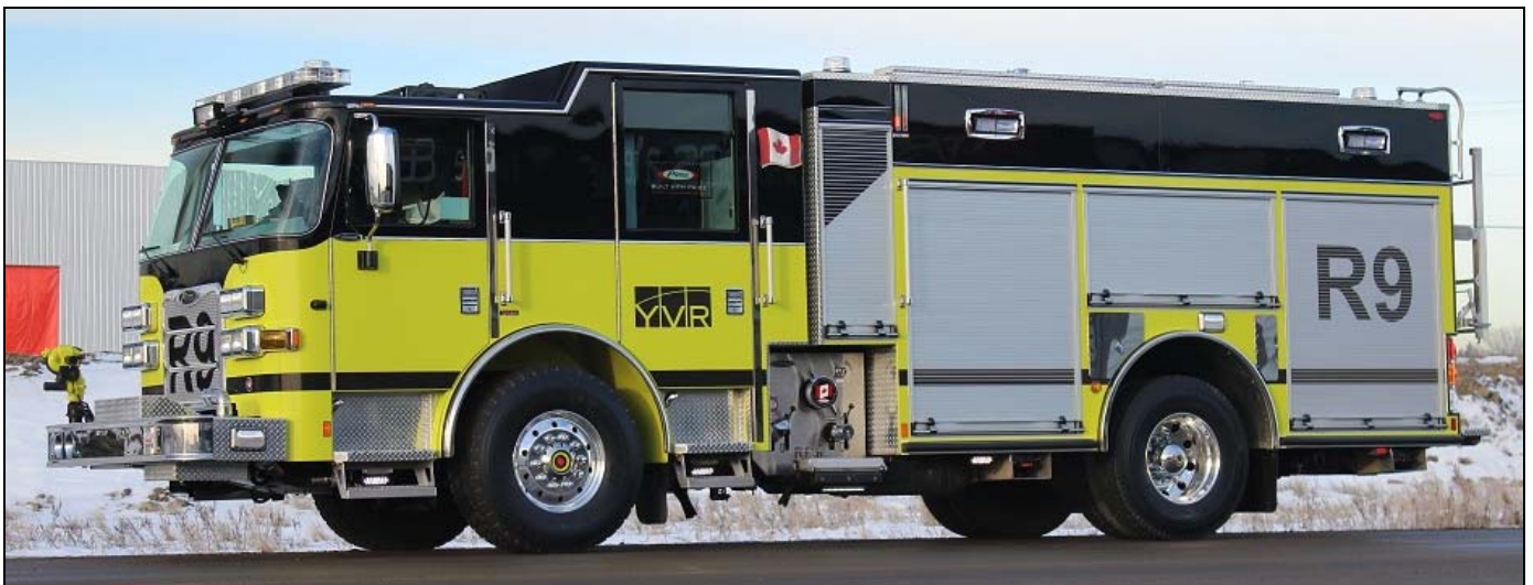
A recent arrival at Vancouver Airport: Red 9, a 2014 Pierce Arrow XT PUC pumper with a 1500gpm Pierce pump, a 500gwt and a 30gft. It has a Husky 12 foam system and serial number 27687. (John Bowerman)