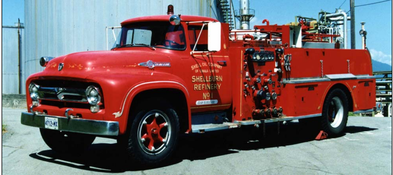
The Shell Burnaby Refinery ran this 1956 Ford pumper