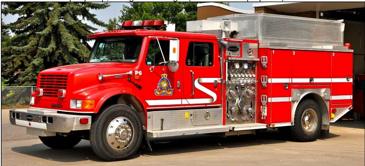
Lethbridge, AB P.6 is a 2000 IHC 4900/Superior pump with 840igpm pump and 600gwt. It runs from Station 4.