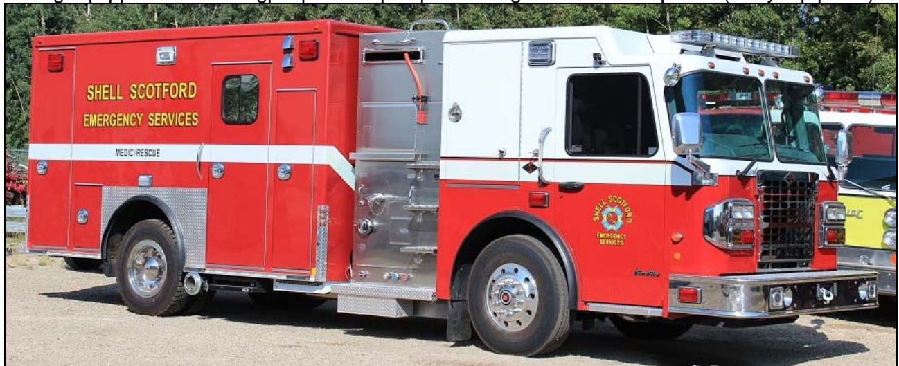
This 2014 Spartan Metro Star/Marque 420(W)igpm pumper is also an ambulance, with the treatment area in the rear. Shell Oil uses it at their Scotford Refinery in Alberta.