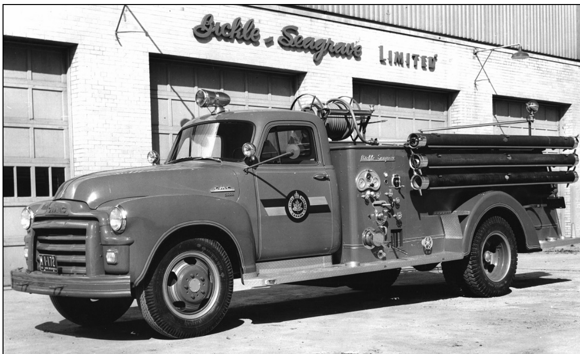
1955 Bickle-Seagrave/GMC for New Brunswick Civil Defence