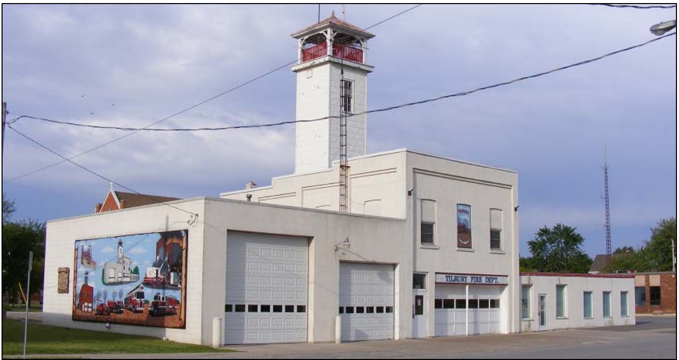
Station 19 of the Chatham-Kent FS is in Tilbury, at 9 Superior St. It houses four rigs and two antiques.