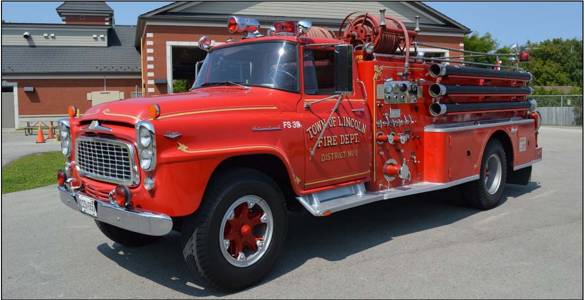
Lincoln still owns this 1960 IHC Thibault 625/500 pumper, formerly Beamsville P.1 (Ken Buchanan)