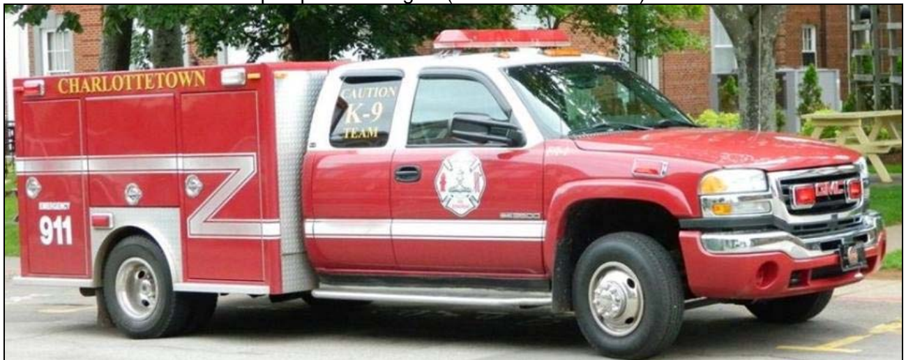
The Charlottetown, PEI Investigation and Canine Unit is a 2003 GMC 5500.