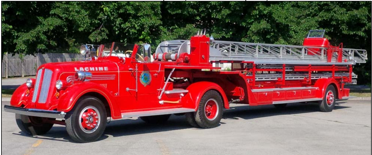
Another immaculate restoration, owned by Pompiers Auxilliers de Montreal, is a 1937 Seagrave 75' tiller, formerly with Lachine, QC.