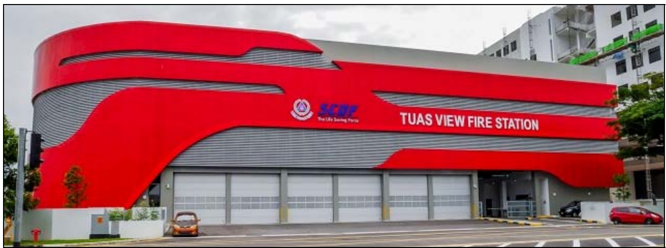
Tuas View Fire Station in Singapore opened in July. SCDF Station 45 houses six major pieces including Haz Mat 451, built by Rosenbauer on a 2012 Volvo 260 chassis.