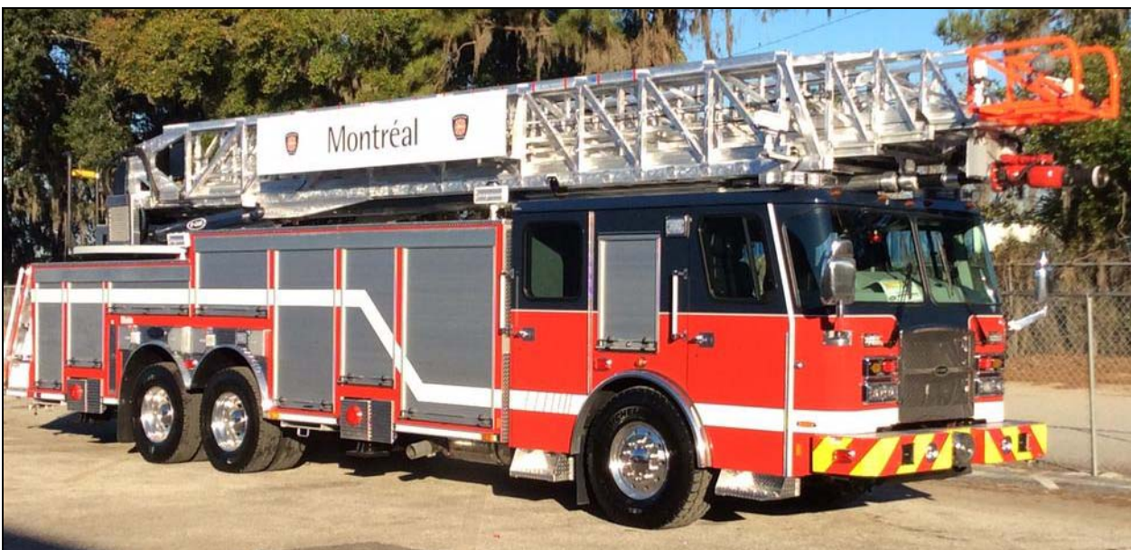
Montreal just received two of these 2015 Emergency One Cyclone II 137' aerals