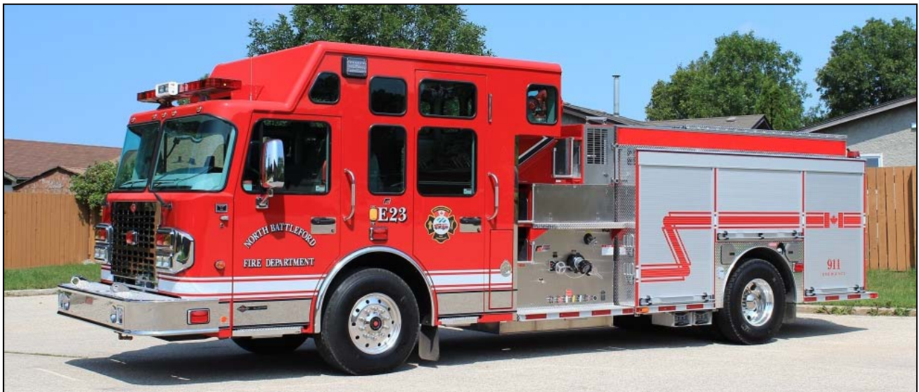
Some deliveries from the summer: North Battleford, SK assigned this 2014 Spartan Gladiator/Fort Garry pumper to Engine 23. It has a 1050igpm pump, 600gwt and 25gft. (SN M525)