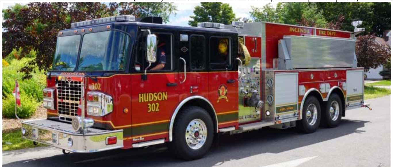
Hudson, QC U. 302 is a 2012 Spartan Metro Star/Maxi Incendie pumper-tanker, 1250igpm pump, 2500gwt.