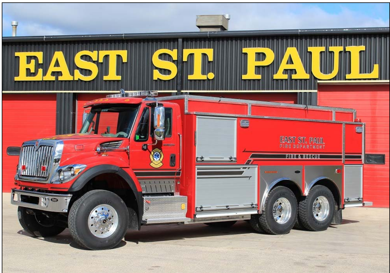
East St. Paul, MB now has this 2014 IHC 7400/Acres tanker, 840igpm/2500gwt.