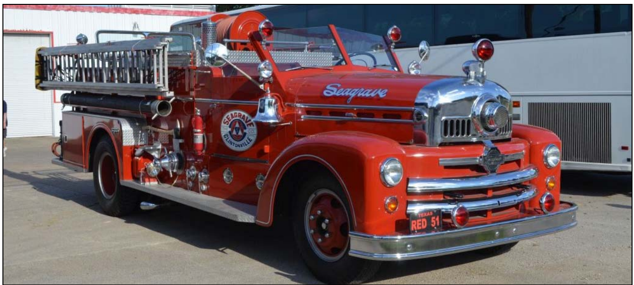
Kept at the Texas Fire Museum, this is Red 51, a 1951 Seagrave Anniversary Series 1000/500 pumper.