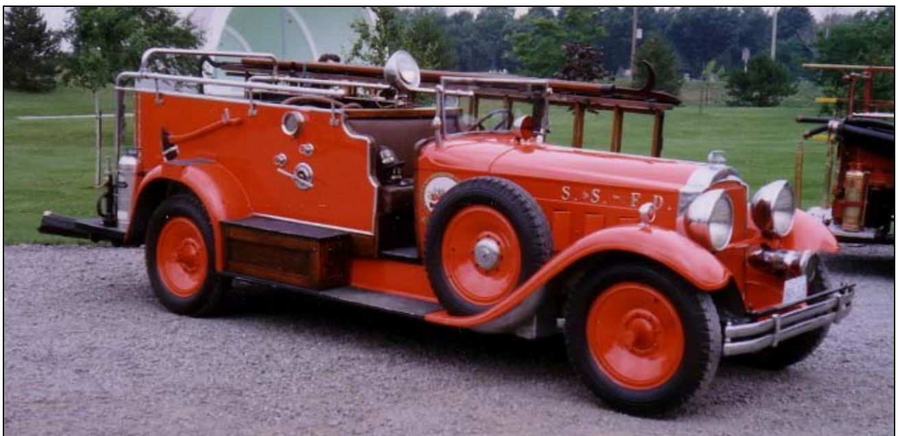
This unique and luxurious rig is the result of a conversion (in house) of a 1926 Packard touring car at the E.D. Smith plant