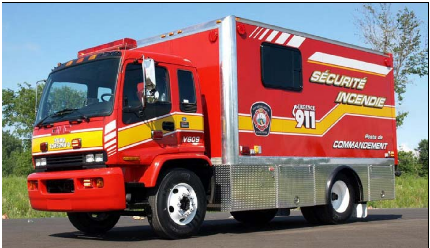
Riviere Heva, QC operates this 2000 GMC T-6500/Heloc rescue/command as Unité 609. SN 119628.