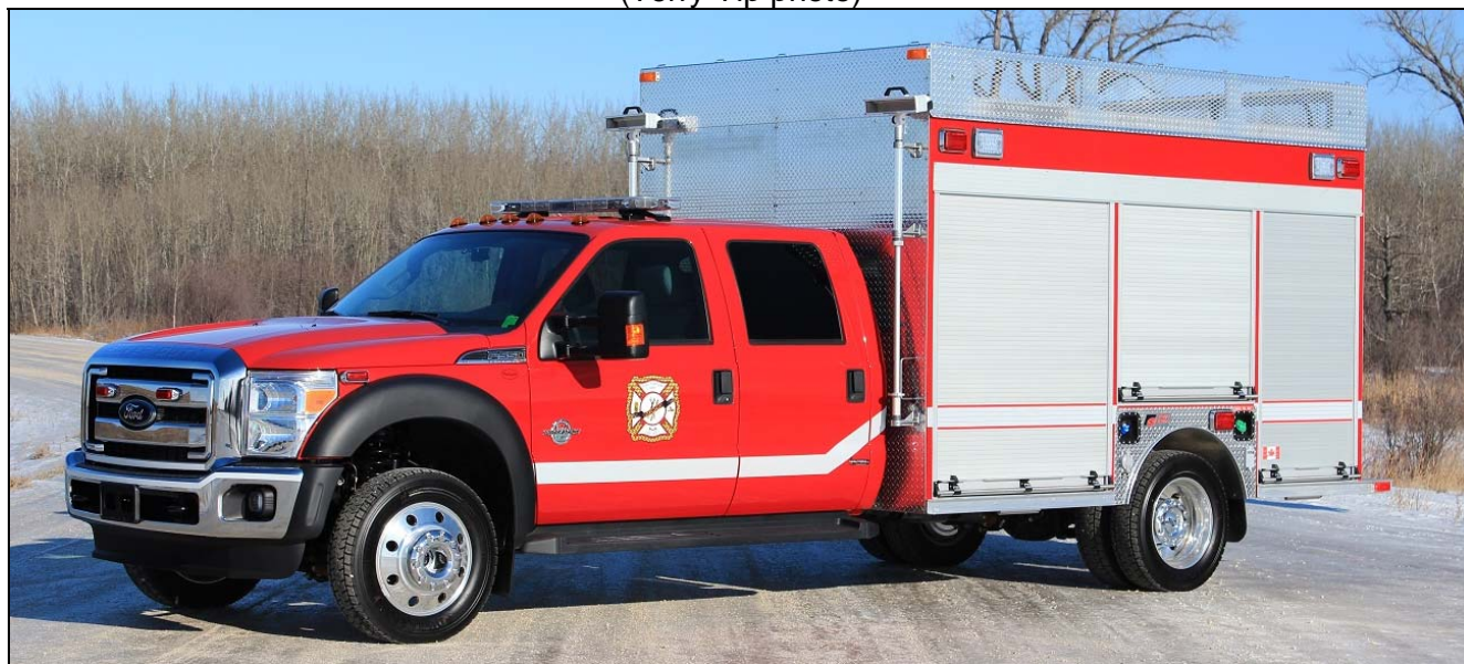
Up north, Fort Simpson, NWT is getting this 2015 Ford F550 4x4 /Fort Garry Fire Trucks light rescue with a 12' box. Serial number M565.