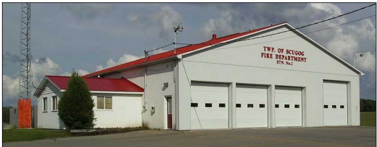
Scugog Station 2, on Scugog Island, is at 3550 Durham Rd. 57 in Caesarea. Pumper, Tanker and Rescue 62, along with Ice Rescue 622 are kept here.