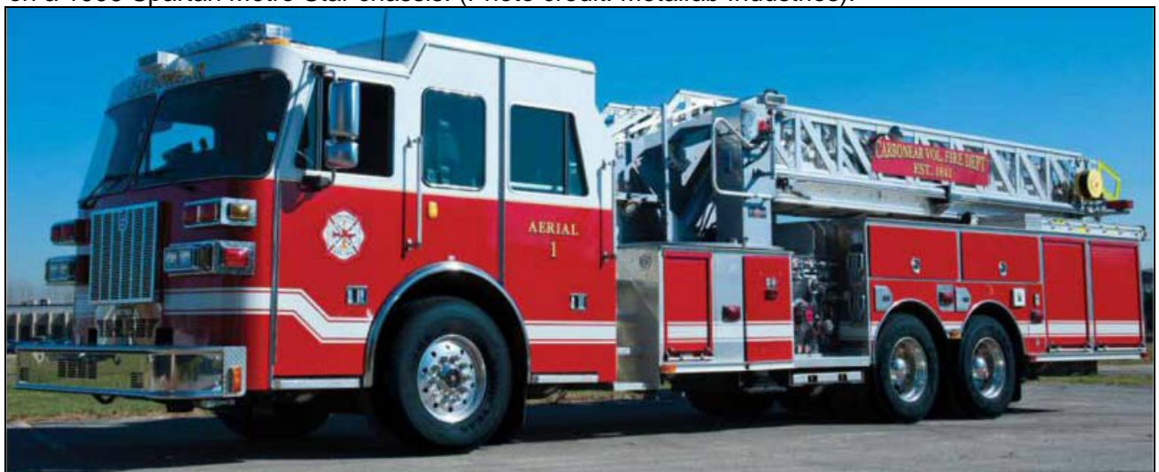
Carbonnear, NL took delivery of this Sutphen 100' tower ladder in 2009 though Fort Garry. It is equipped with a 1500gpm pump and 330gwt.