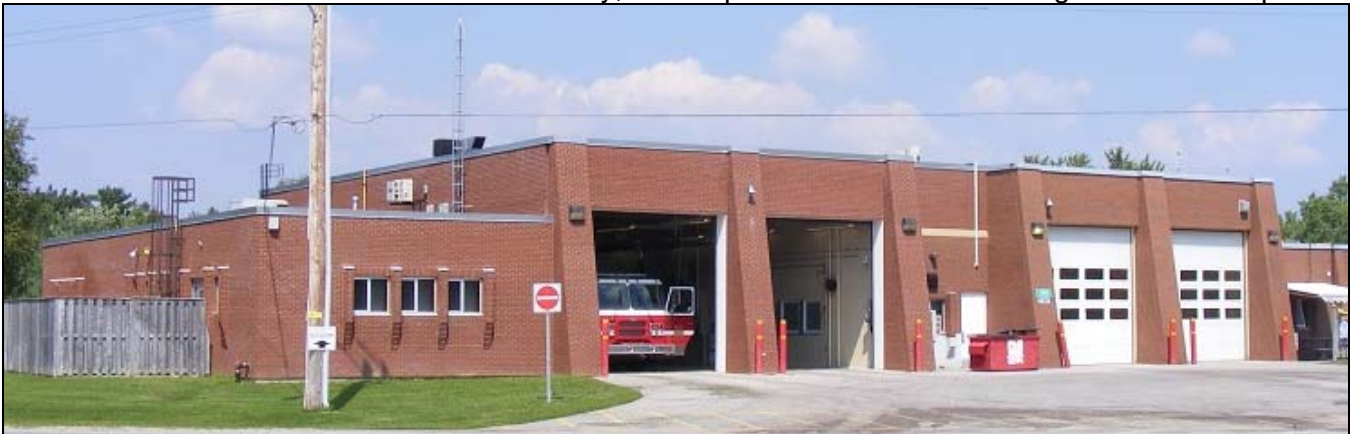
This is the fire hall at CFB Borden. Located at 150 Ortona Rd. it has 10 trucks.