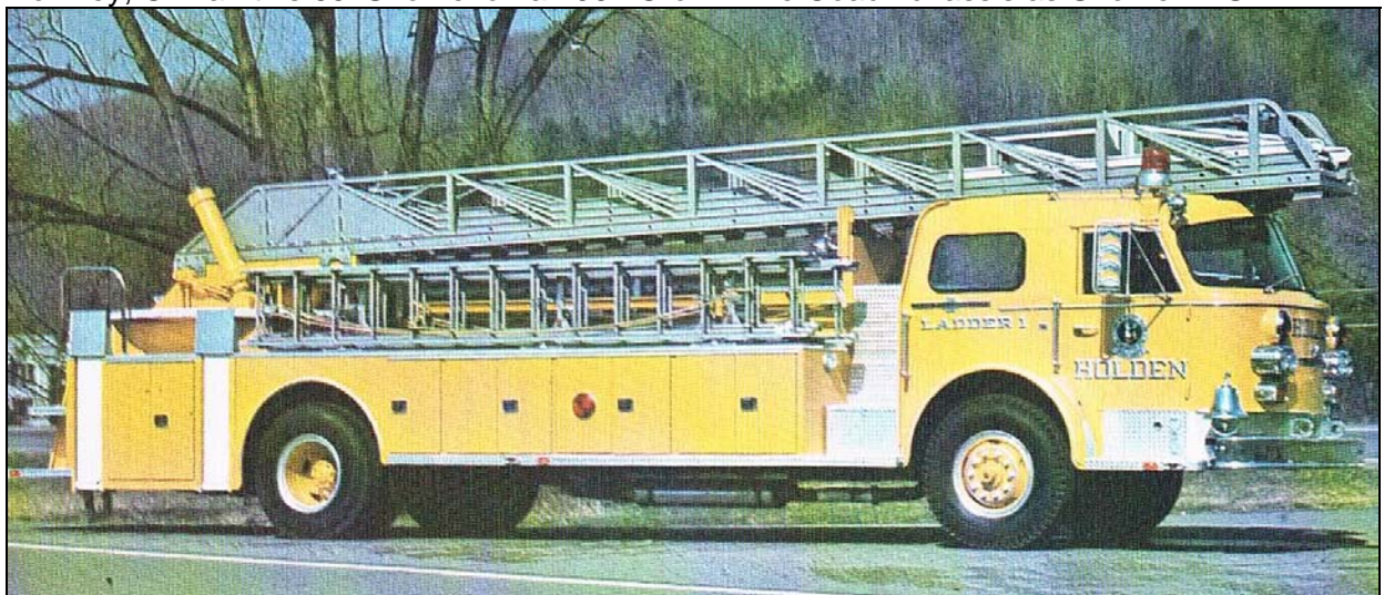
Holden, MA Ladder 1 was a 1973 ALF Century Ladder Chief 100' rearmount.