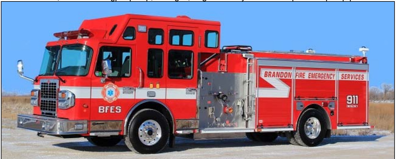
Brandon, MB just purchased this 2014 Spartan Metro Star/Fort Garry pumper with a 1050igpm Darley pump, 500gwt, 25gft, a FoamPro 2001 foam system and enclosed pump panel.