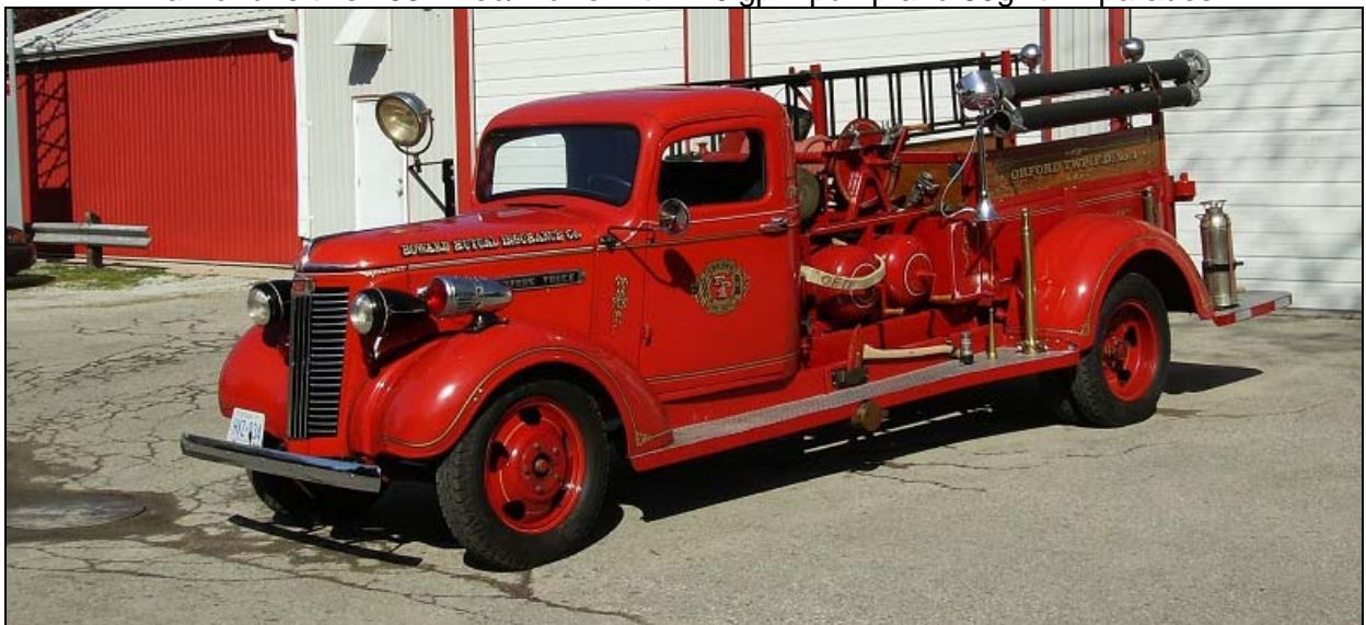
Another Chatham-Kent station, No.10 in Highgate, still has this former Orford Township 1938 GMC/General rig, it has a 225igpm pump and twin 40gwt.