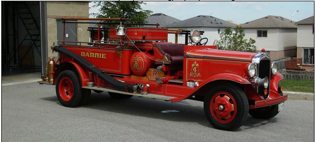
Barrie runs this 1934 Reo/Bickle with 420igpm pump and 80gwt. in parades.