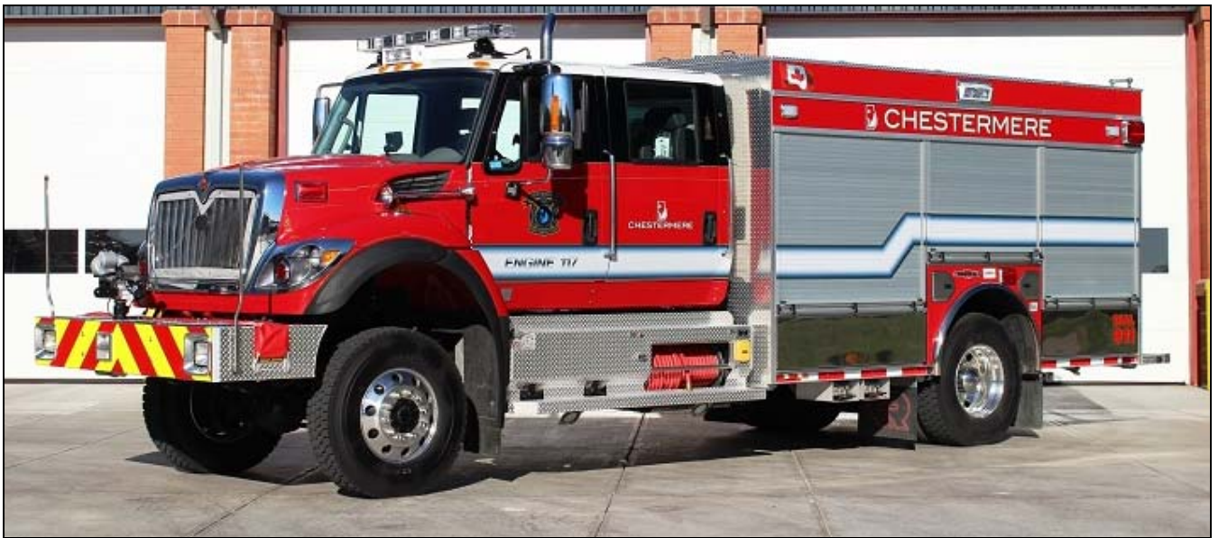
Also from last fall, Chestermere, AB took delivery of a Rosenbauer EXT Timberwolf for E.117 on a 2014 International 4x4 chassis. It came with a 1000gpm pump, 500gwt and 20gft.