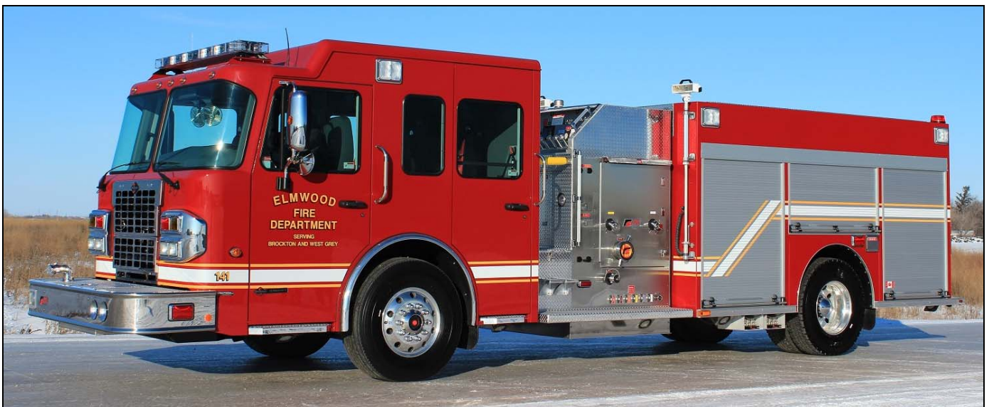
Elmwood just got this 2014 Spartan MS-X/Fort Garry 1050(H)igpm, 800gwt, 20gft pumper for P.141 s/n M562.