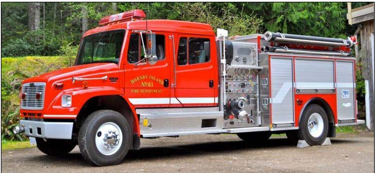
Hornby Island Engine 61 is a 2003 Freightliner FL80/ALF pumper, 1050igpm & 1000gwt.