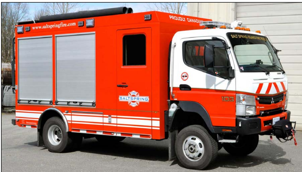
An unusual rig from the Pacific region, Saltspring Island runs this 2012 Mitsubishi/Hub off-road rig equipped with a 200igpm portable pump and 200gwt as Mini-Pump 103.