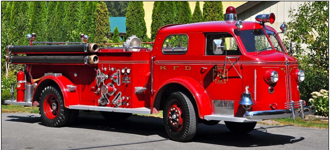
Kenyon, MI's 1947 ALF 700 pump, 1000gpm/300gwt, part of the Brian Beard Collection. (Terry Yip)