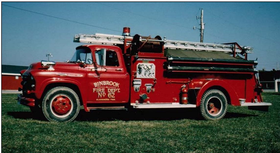
Binbrook's 1957 Chev/King Seagrave 625/500 pump.

Wentworth County Units are dispatched by Hamilton, XJH-89, 154.25