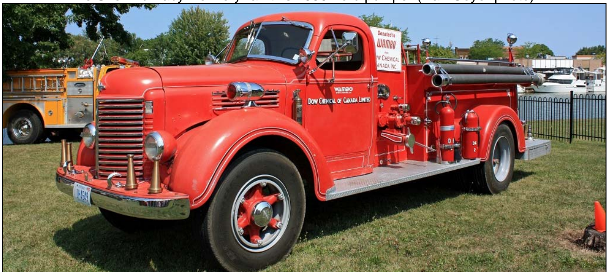
Another preserved rig, this former Dow Chemical pumper is a 1946 International/Bickle Seagrave 500/300 owned by Lee Burrows, of Dresden, seen at WAMBO.