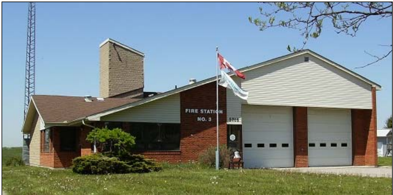
Clarington Station 3 (now 13) located at 5708 Main St. in Orono, houses Pumper, Tanker and Utility 13, and ATV 3.