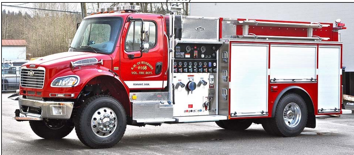
Newly completed for RM of Riverside, SK is this 2014 Freightliner M2 /Hub pumper featuring a 1250igpm pump and 500gwt. Assigned to Pennant, it's lettered Unit 168.