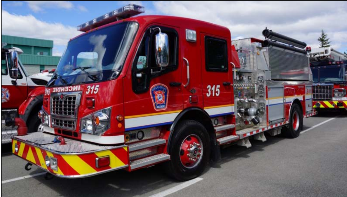
Côteau-du-Lac, QC U.315, a 2008 Spartan Furion/Rosenbauer pumper-tanker with 1250ipm pump, 1500gwt and 16gft.