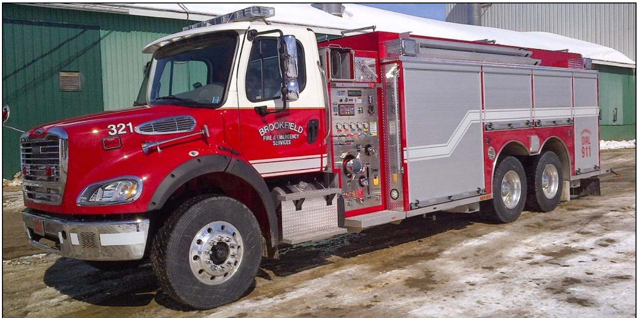
Brookfield, NS Tanker 321 is a 2014 Freightliner M2-112/Metalfab pumper-tanker with a 625igpm pump and 2500gwt. (Metlafab Fire Trucks)