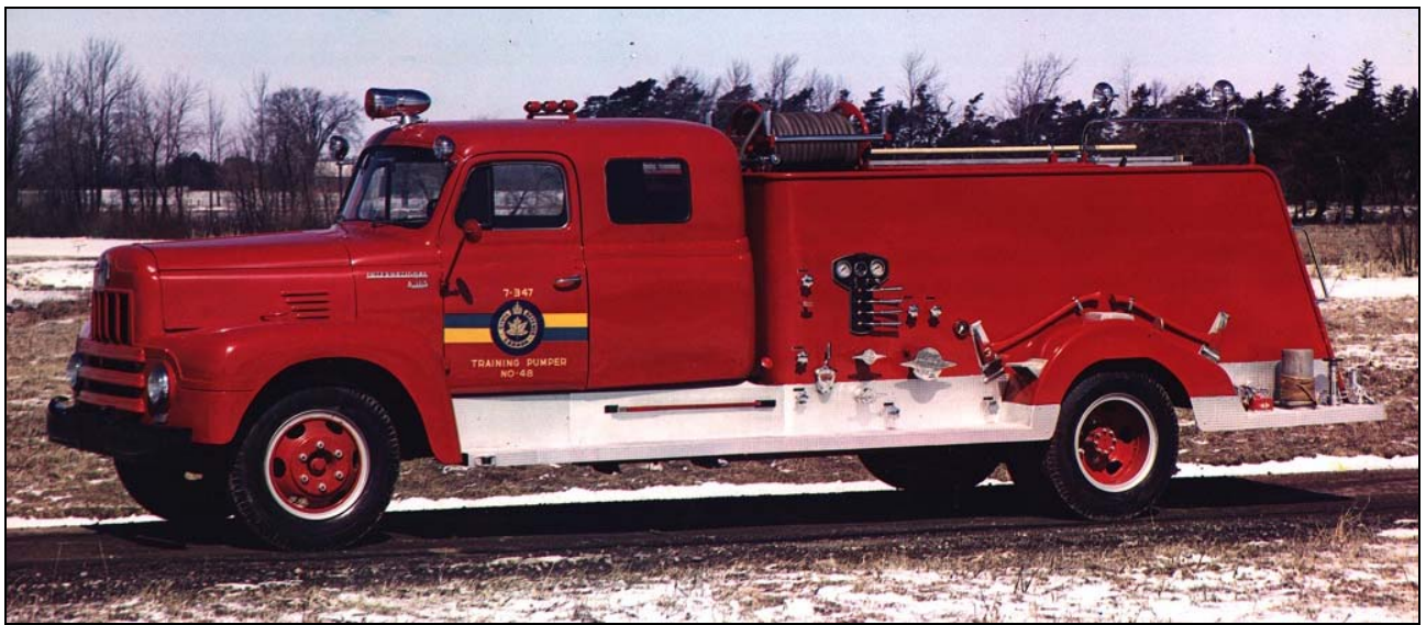
One of the ten 1953 Marsh/Internationals