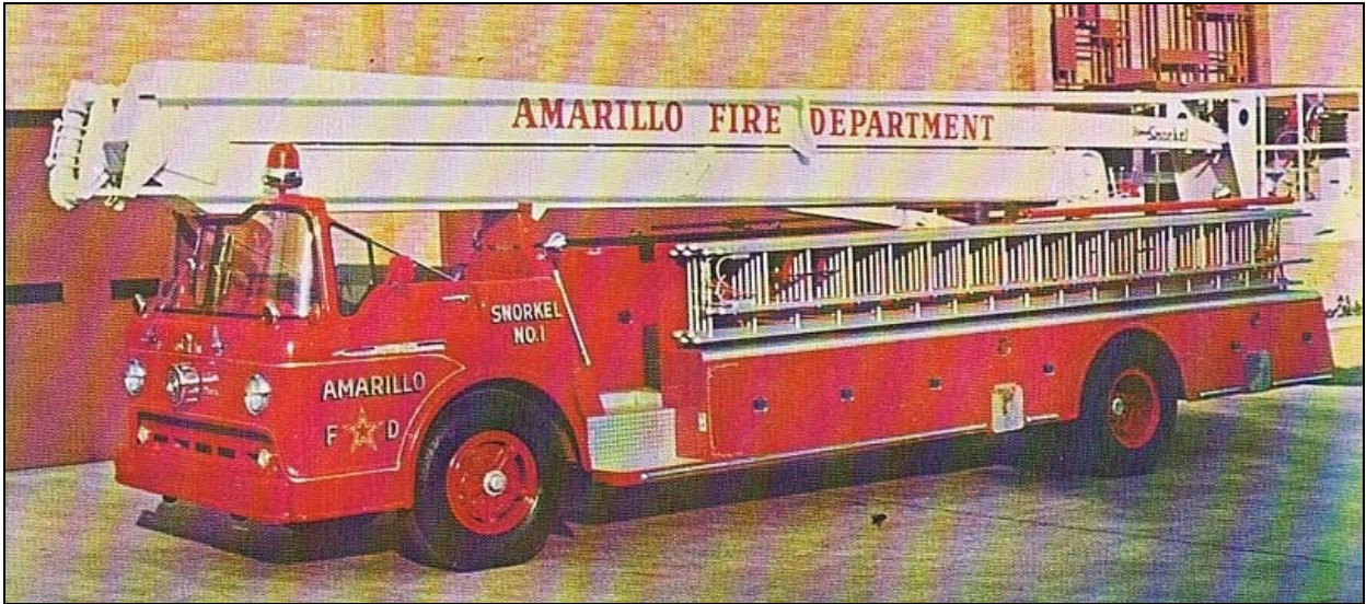
Another from Texas, this was Amarillo's Snorkel No. 1, an 85' tower on a Ford C 1000 chassis.

Welcome to the bonus section of the Photo Issue. We begin with delivery photos from yesteryear, including one from ALF Elmira along with a roster from the past. There are some interesting rigs along with another Cross Canada Check-up, followed by more new deliveries. Lastly, a few stations, and some golden oldies.