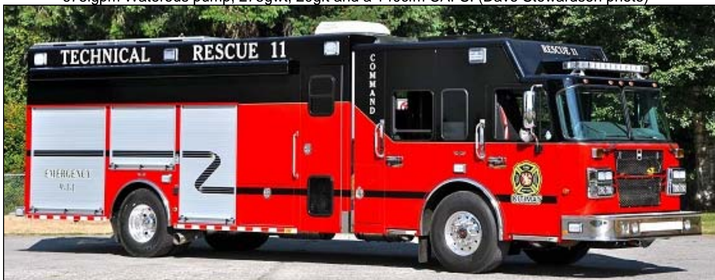
. Technical Rescue 11 belongs to Kitimat, BC. It's a 2014 Spartan/SVI combination Command/Rescue.