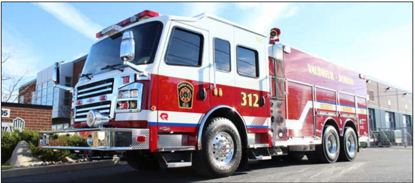
Vaudreuil-Dorion U. 312, a 2014 Rosenbauer Commander 4000 pumper, has a 1250igpm pump, a 2000gwt and 30gft. It also has Foam-Pro 2001 foam system.