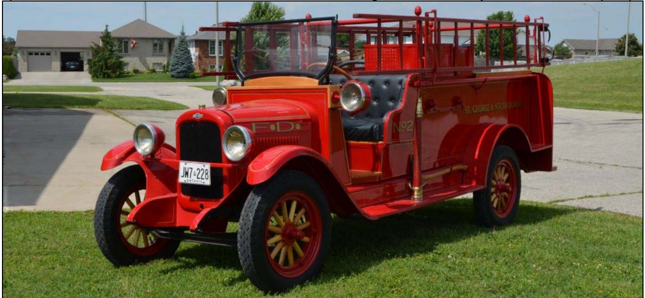
Brant County maintains this 1928 Chevrolet/Shop built chemical truck originally with St. George, ON.