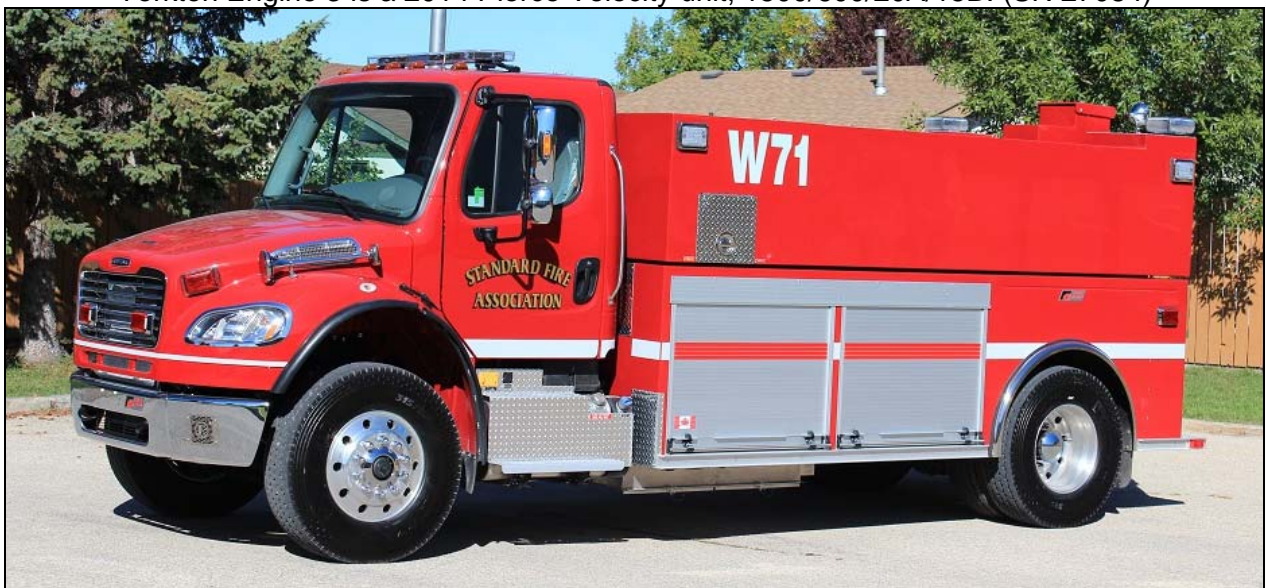
Standard, AB. Wagon 71 arrived in late September. It's a 2014 Freightliner M2-106 / Fort Garry Crusader tanker with a 420igpm Hale pump and 2000gwt, s/n M566.