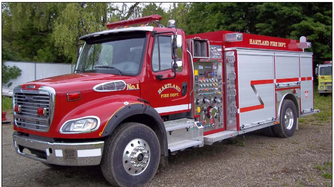
Hartland, NB received this 2014 Freightliner M2-112/Metalfab pumper-tanker a year ago. It has a 1500igpm Hale pump, 1200gwt, 20gft and FoamPro 1600 foam system.