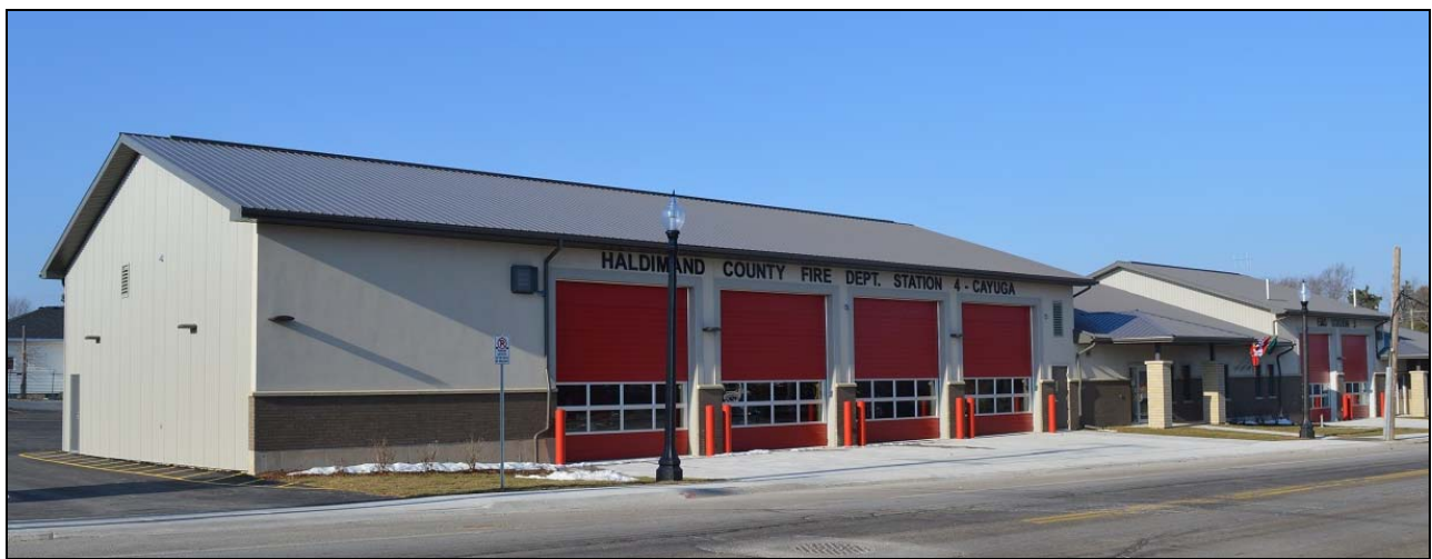
Haldimand County's brand new Station 4 in Cayuga. There are tow pumpers, a tanker and rescue in the four bays on the fire side and two ambulances on the EMS side.