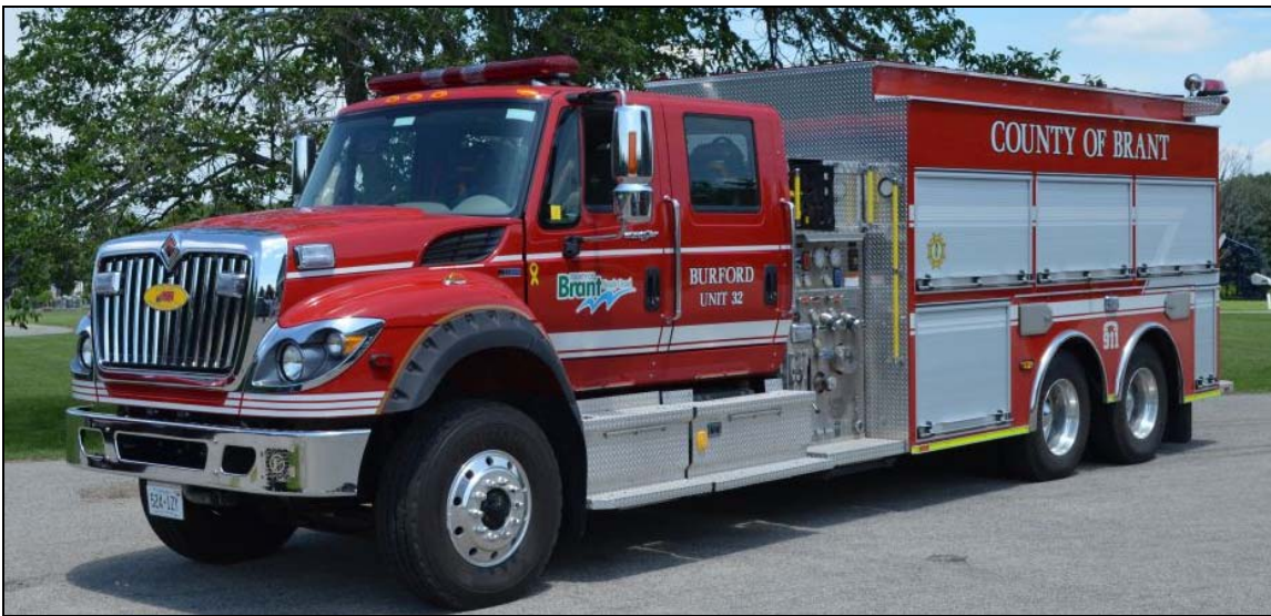
Brant County Unit 32 is a 2011 International/Asphodel, 1050igpm/2253gwt (Bob Rupert)