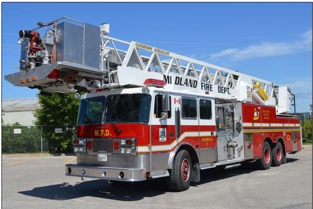
. Midland Aerial 1, a former Burlington rig. It's a 1990 Pemfab/Grumman Aerialcat with a 1250gpm pump, 150gwt and a 100' tower.