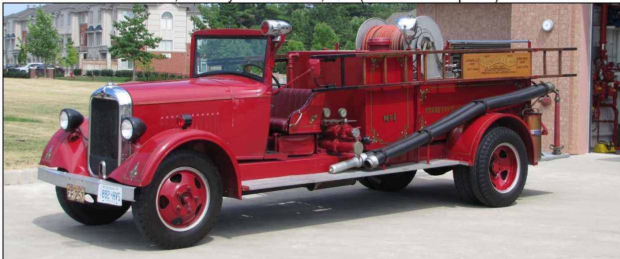
One of Mississauga's parade rigs, this 1934 GMC/Bickle belonged to Streetsville. It was rehabbed by Dependable in 2012 and is kept at Station122