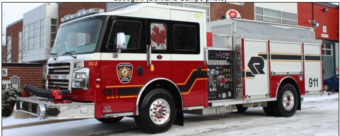
A recent addition to the fleet in St. Leonard, NB. Unit 14-2 is a 2014 Rosenbauer Commander 3000 pumper-tanker equipped with a 1250igpm pump, 1250gwt and 30gft.