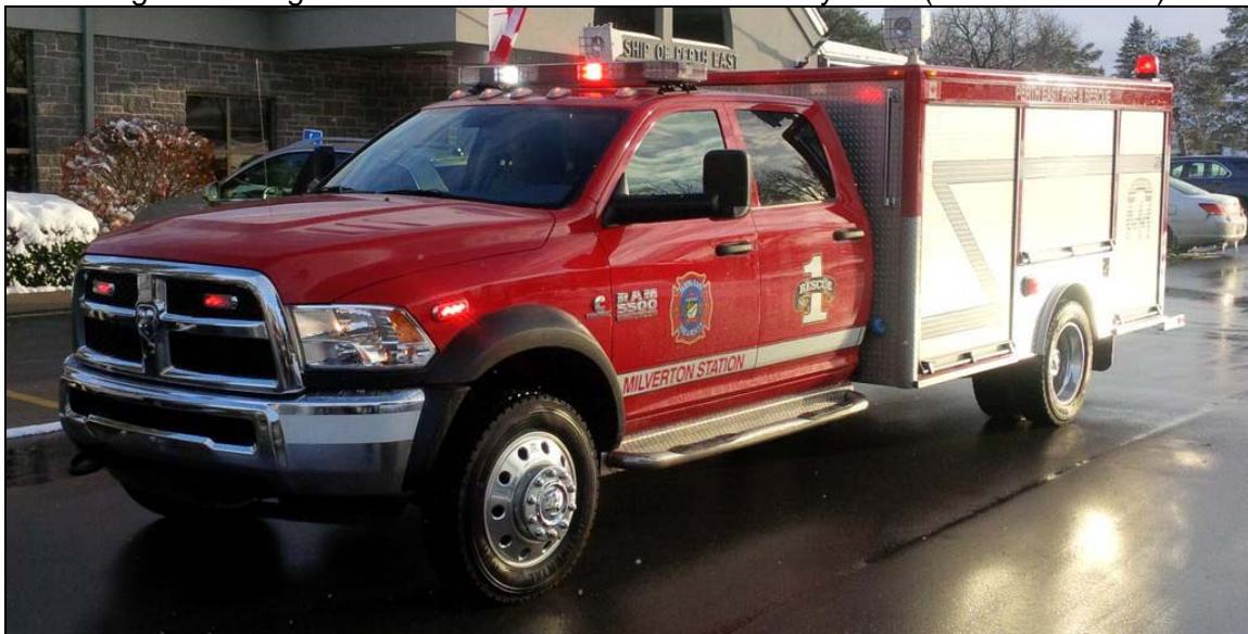
Perth East just got this 2014 Dodge Ram 5500/DEV light rescue for Milverton. Earlier, this 2005 Spartan Gladiator chassis from Toronto was redone by Spartan and DEV for Shakespeare.