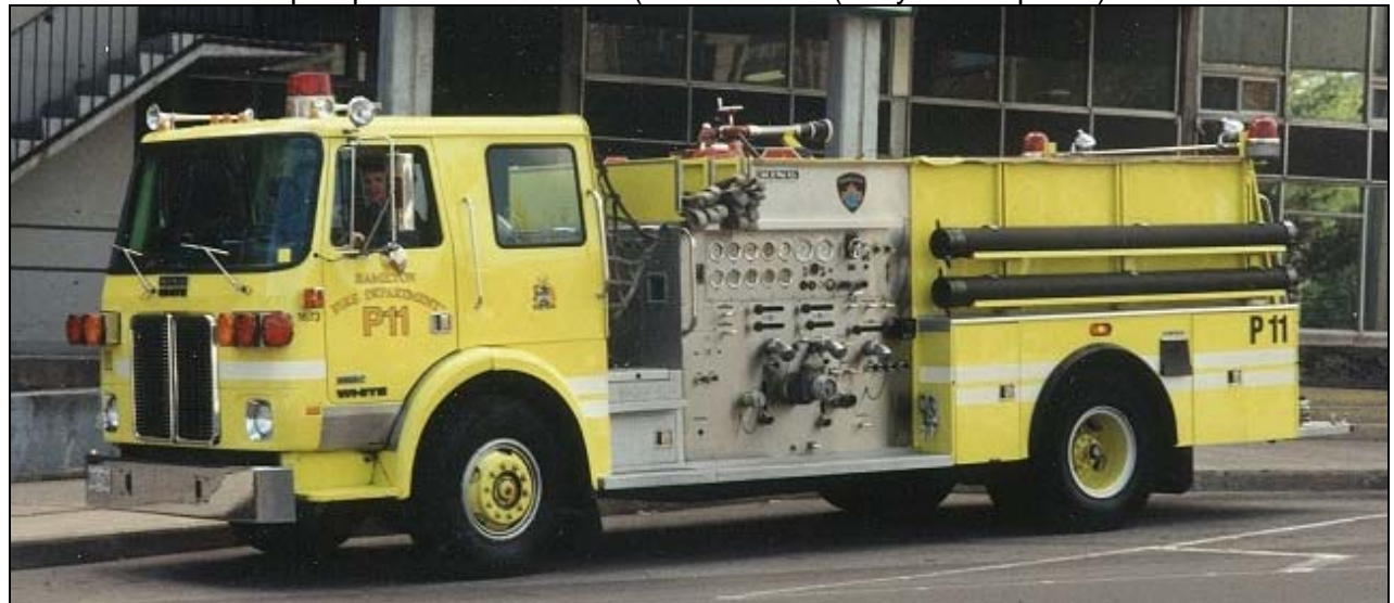
From 1980 is Hamilton P.11, a Mack MR611/King pumper, 1050igpm and 300gwt. (Desmond Brett)