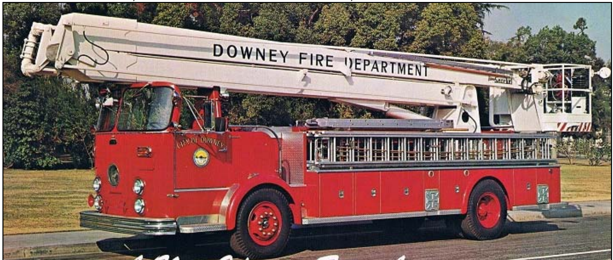
Downey, CA ran this 65' Snorkel on a 1961 Crown Fire Coach chassis as Snorkel 1. SN F1242.