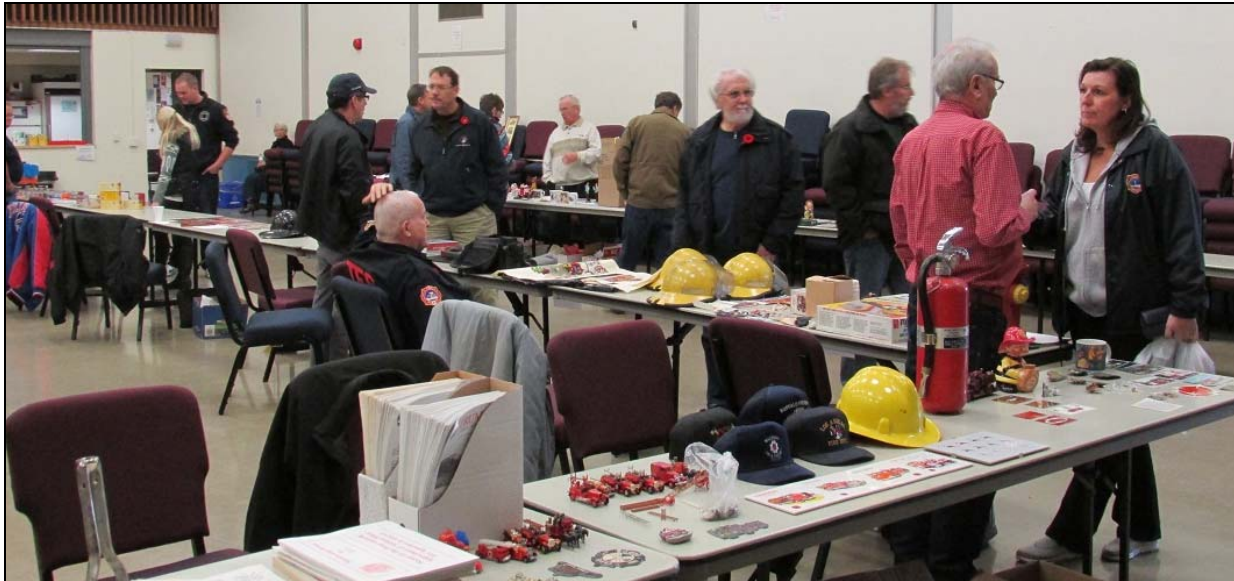
A snapshot of the highly successful Flea Market held November 1.

July 29 to August 1 SPAAMFAA Summer Convention & Muster, Syracuse