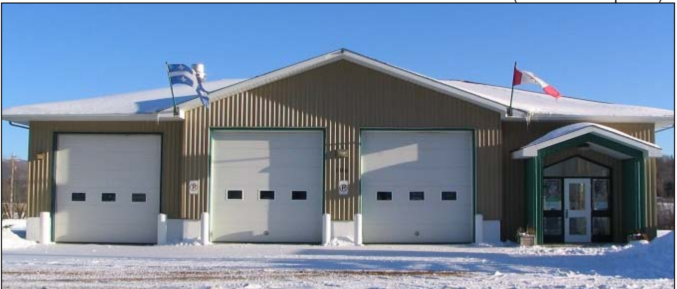
Caserne (Station) 14 of the Vallee-de-la-Gatineau is at 106 chemin de Lac-Sainte-Marie in Lac-Sainte-Marie, QC. A pumper and tanker reside there.