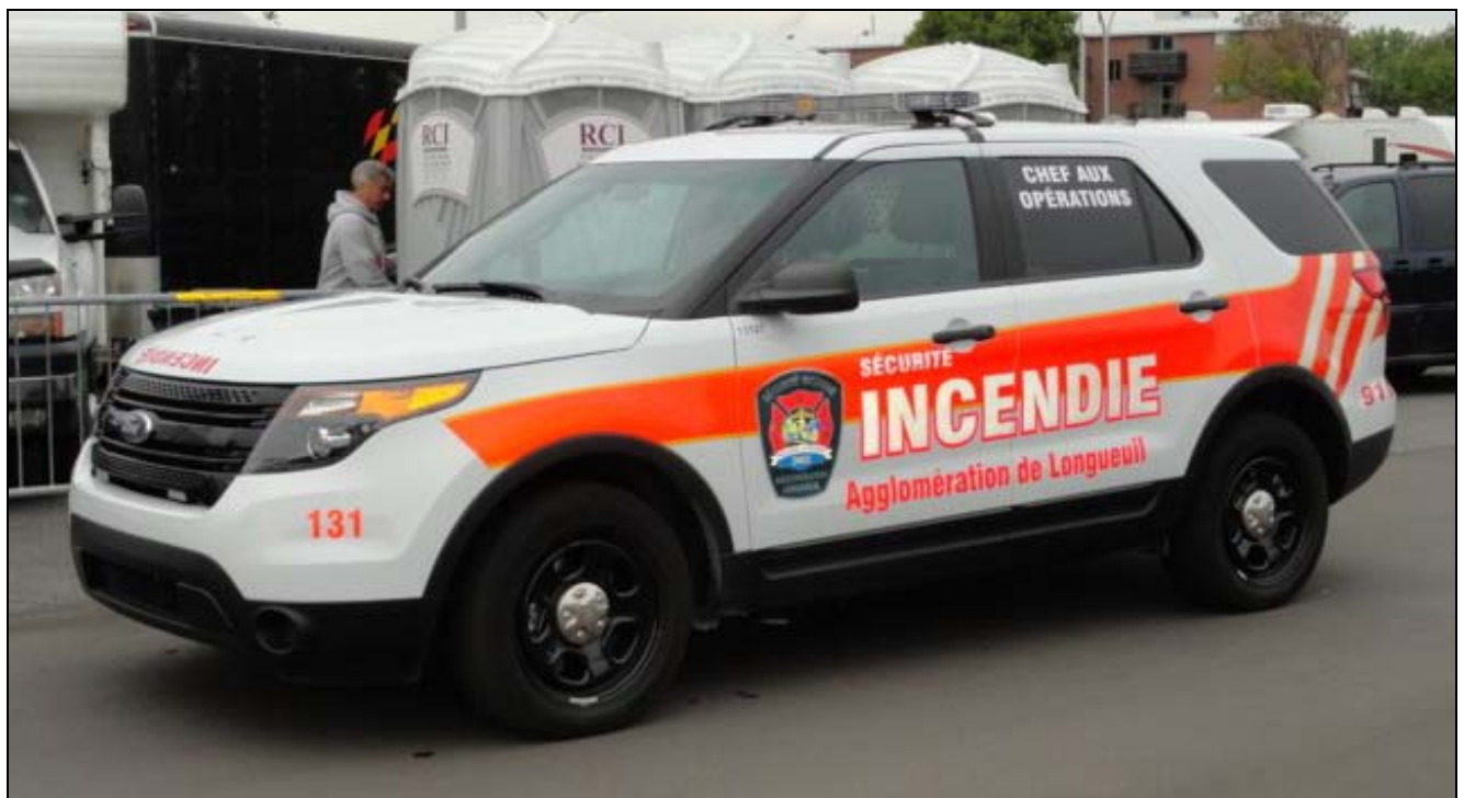
One of the new Ford Explorers delivered to Longueuil, QC. Unite 131 is assigned to the Chief of Operations.