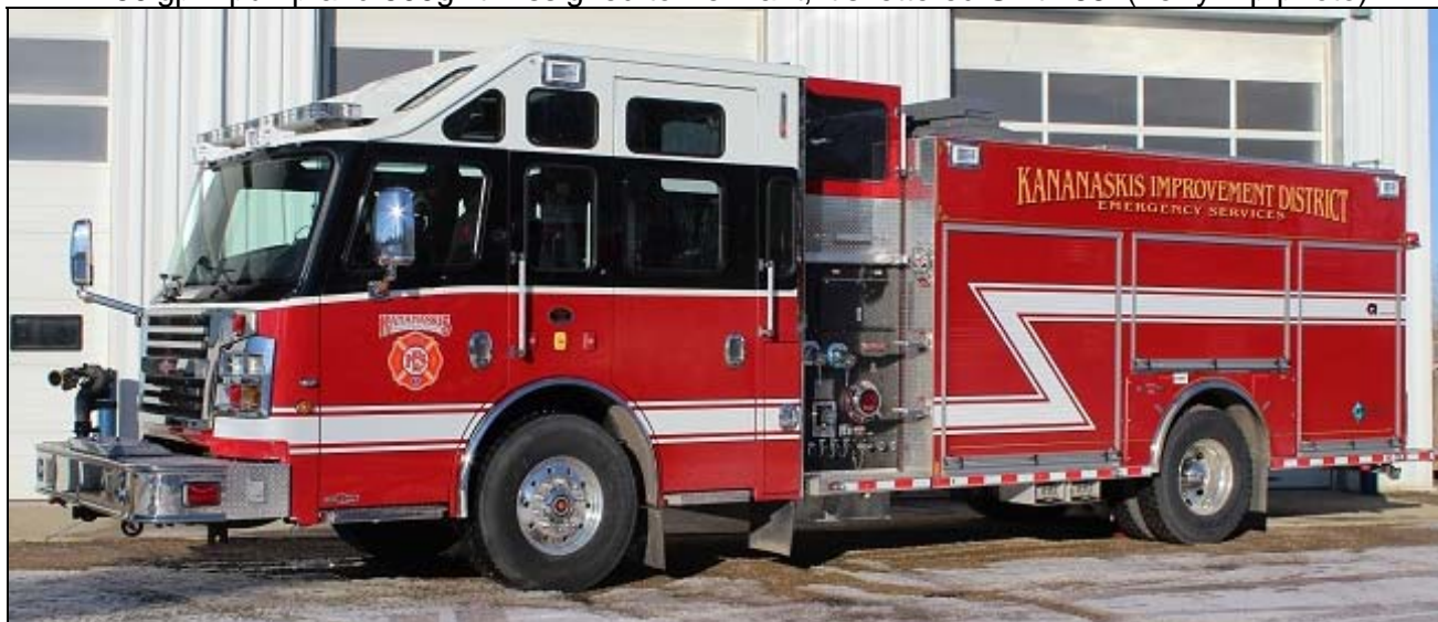
Newly received in the Kananaskis Improvement District in Alberta, this 2015 Rosenbauer pumper has a 1261igpm pump, 461gwt and 40ft. SN 16462.