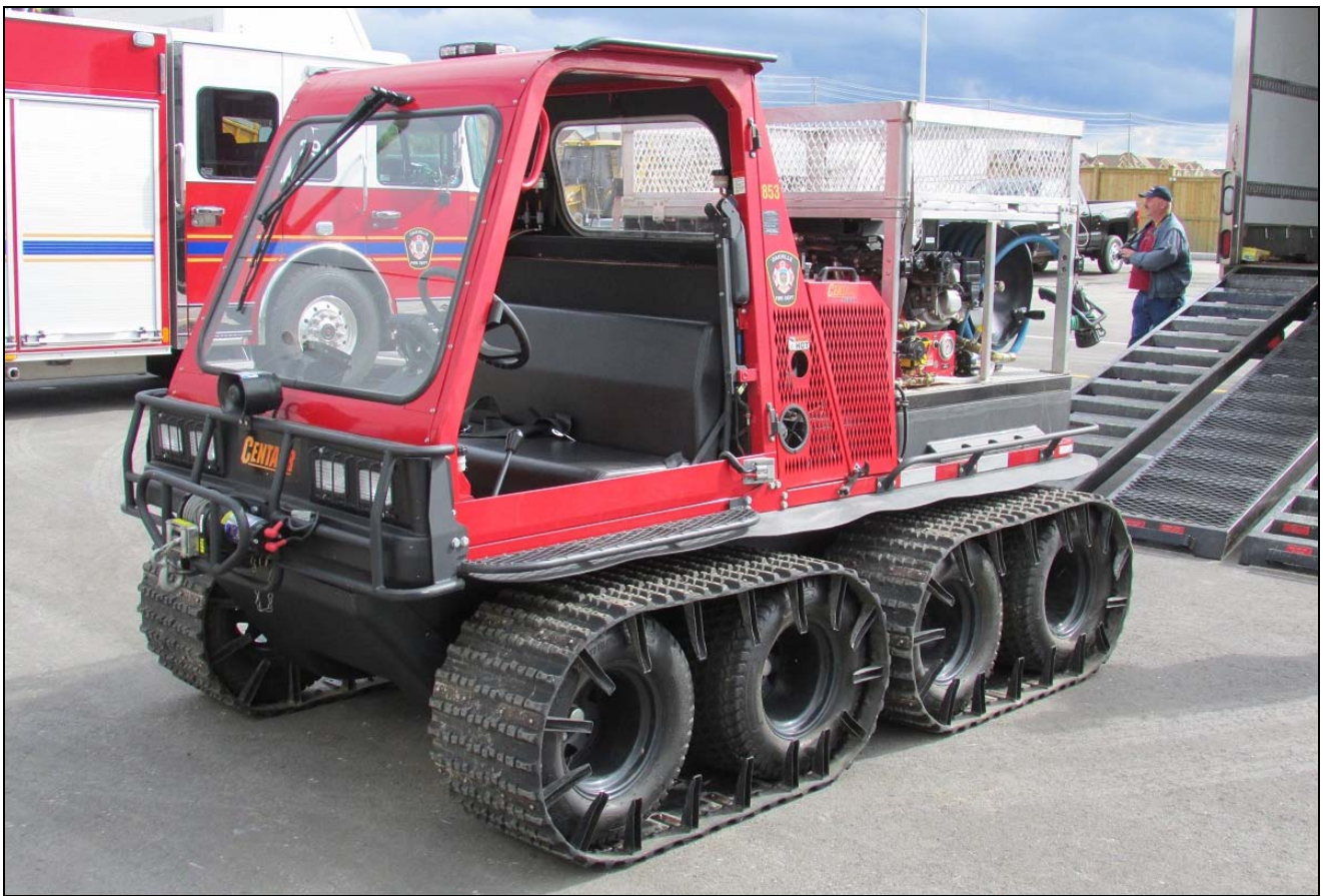
Oakville runs this CTB Centaur 950DT ATV out of Station 9. It has a CET portable pump, a 150gwt and 10gft. It is carried on Unit 293, a 2009 GMC 8500, and is crewed using P.209. (Desmond Brett)