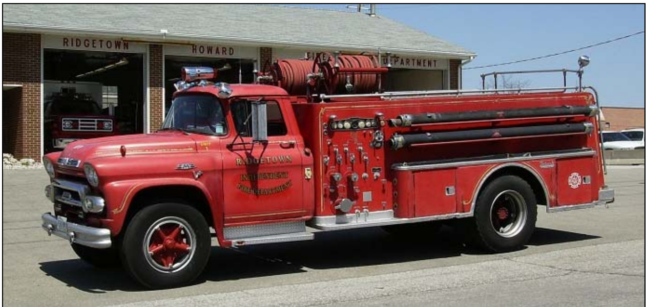
Chatham-Kent Station 17 (Ridgetown) had two preserved rigs, the newer one is this 1959 GMC/Thibault pump with 840igpm pump and 500gwt.