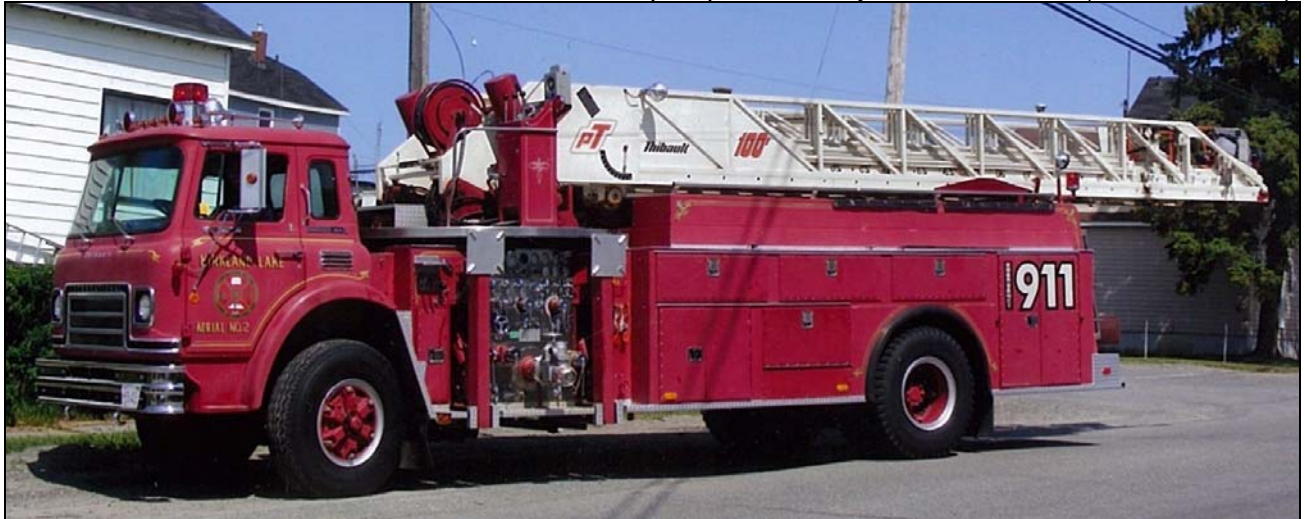
This 1974 IHC Cargostar/Thibault aerial is still in service in Kirkland Lake. Aerial 2 has a 840igpm pump and a 100' aerial. (SN T74-236.