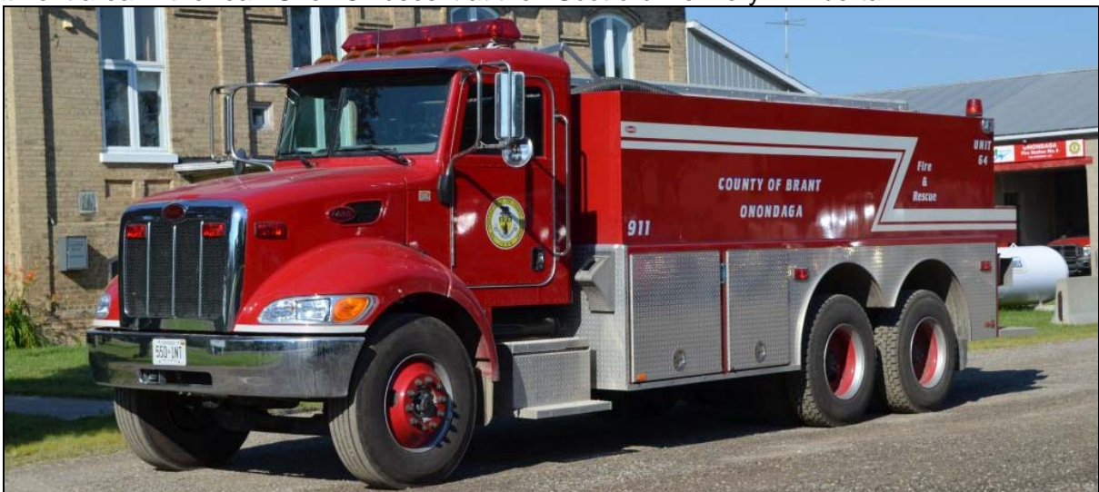
Another unique apparatus, this tandem axle tanker was built by Danko on a 2004 Peterbilt 330 chassis for Brant County. T.64 has a 2500 gallon tank and portable pump.