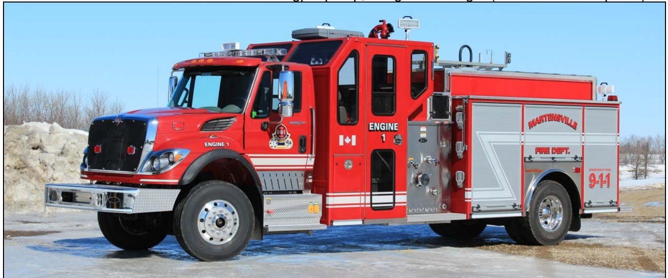
Martensville, SK Engine 1 went into service in the spring, an Acres product on an 2014 IHC 7400 chassis, it has a 1050igpm pump, 1000gwt, 25gft and fully enclosed top-mount pump panel.