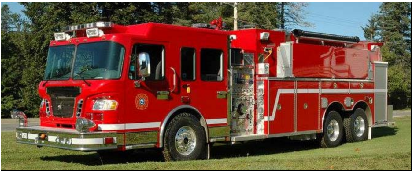
New Minas, NS Unit 1 is a 2010 Spartan Gladiator/Metalfab pumper-tanker with a 1750gpm pump, 3000gwt and 30gft.