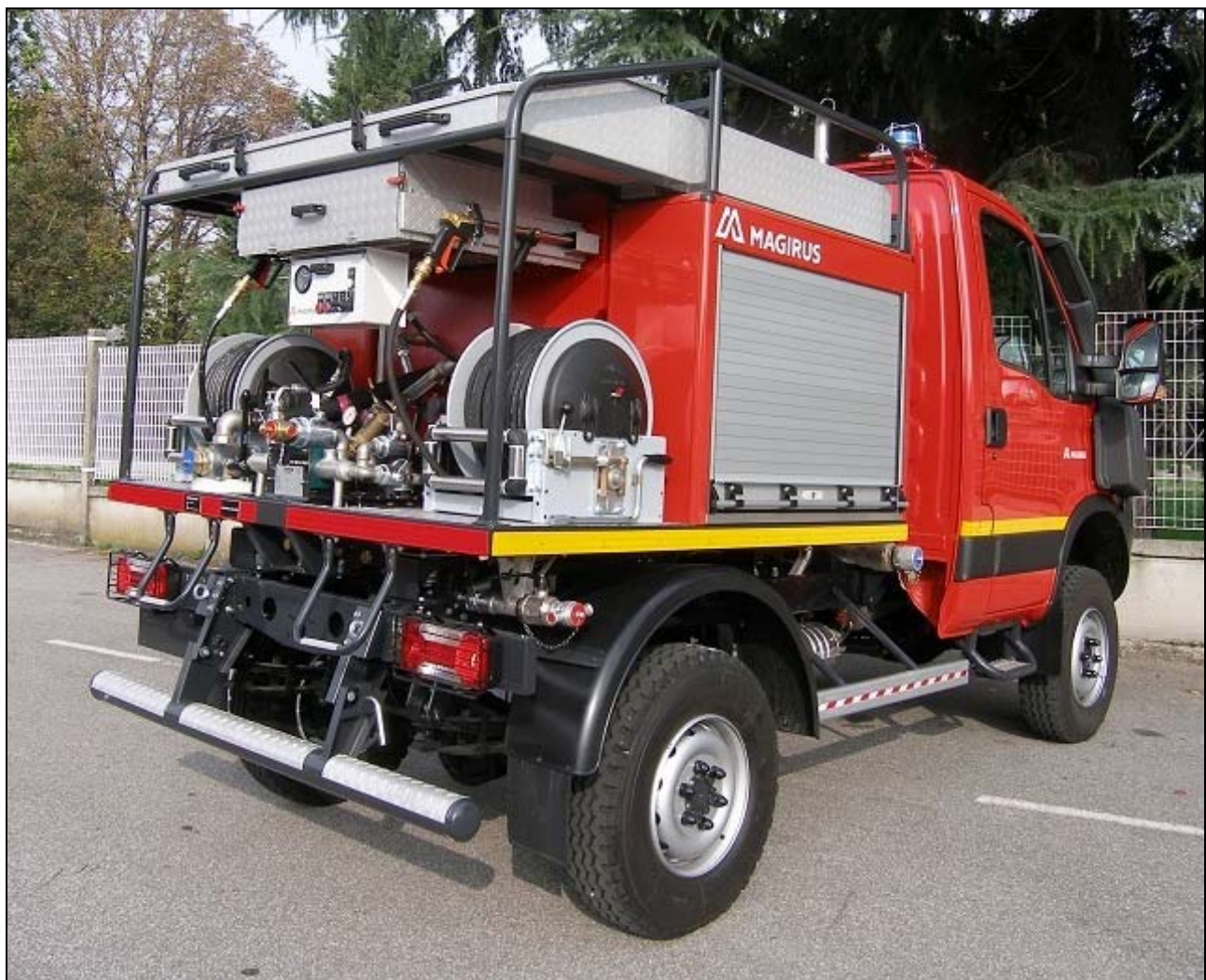
This Iveco 4x4/Magirus brush unit recently went into service in Malta.