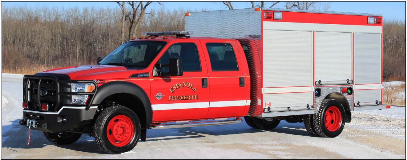
New to Espanola, ON is this 2014 Ford F550 4x4 /Fort Garry light rescue with a 12' box, s/n M593.