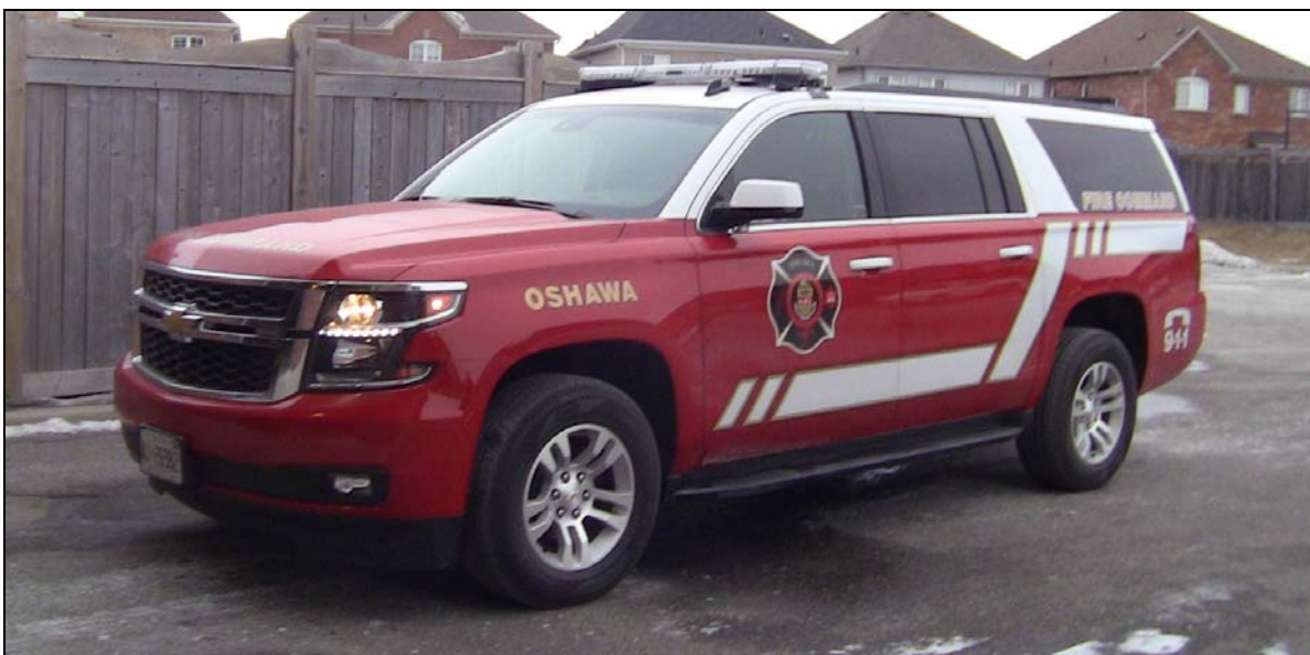
Ohawa's new Command Unit (Car 25) is a 2015 Chevrolet Tahoe.