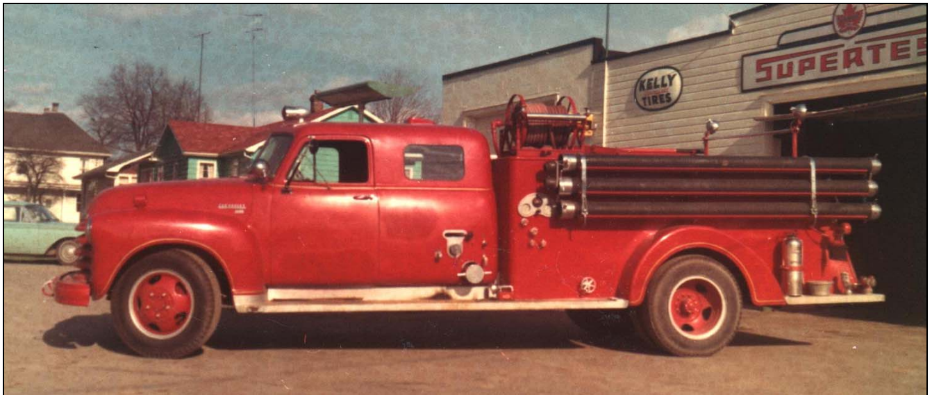
One of the 1952 Bickle-Seagrave Chevrolets, assigned to Port Burwell, ON