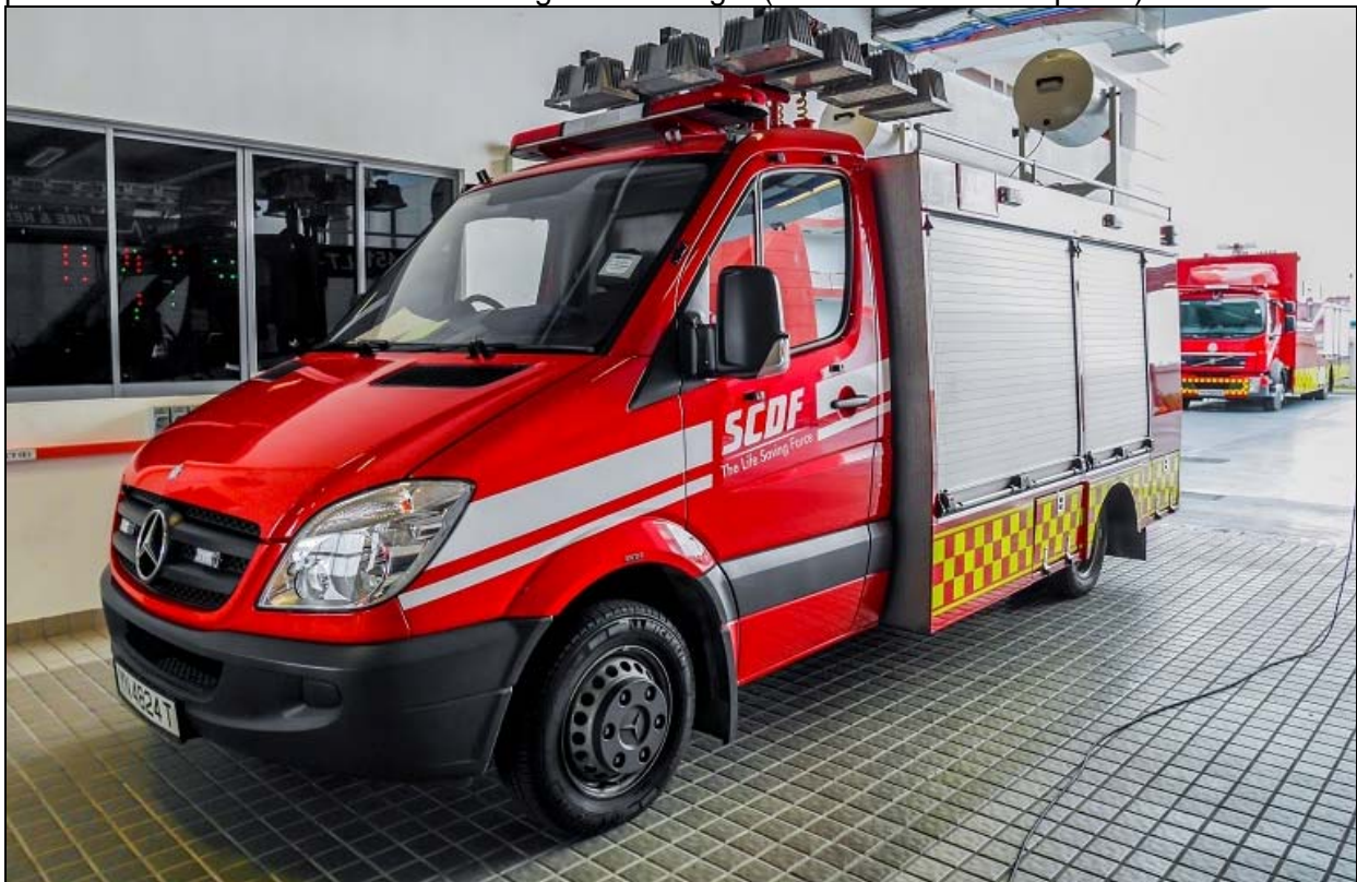
Singapore SCDF BAT 451 is a 2013 Mercedes breathing air and lighting tender.