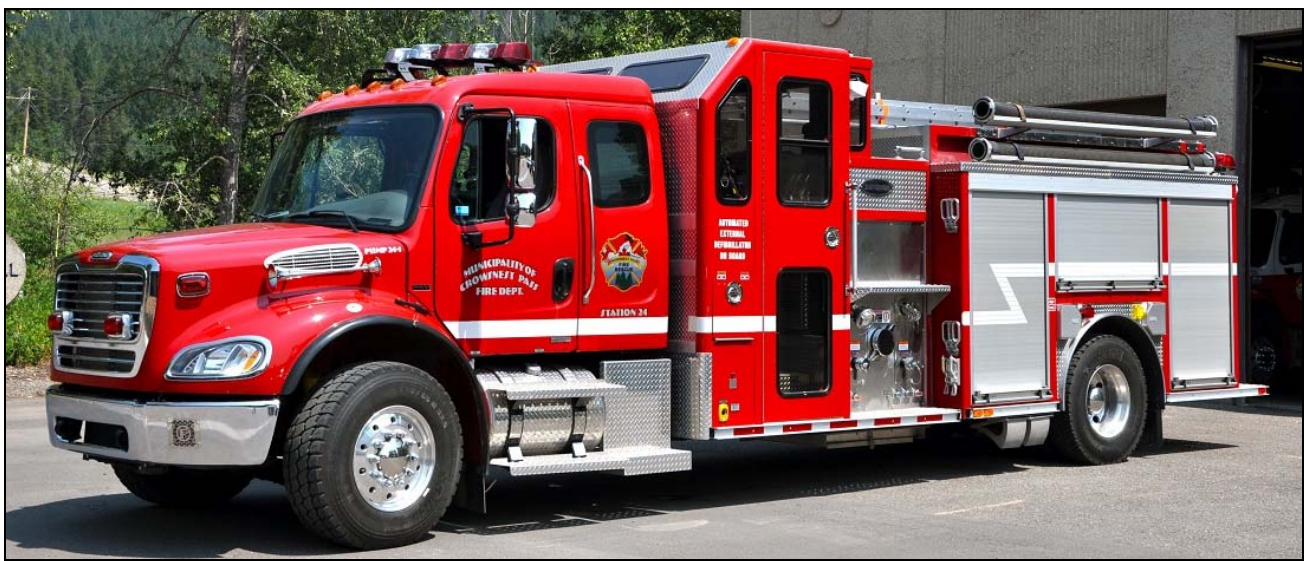
Two from Crowsnest Pass, AB Pump 24-1 is a 2005 Freightliner M2-112/Superior with a 1500gpm pump. Rescue 26 is a 2005 Freightliner M2-106/ITB rescue.