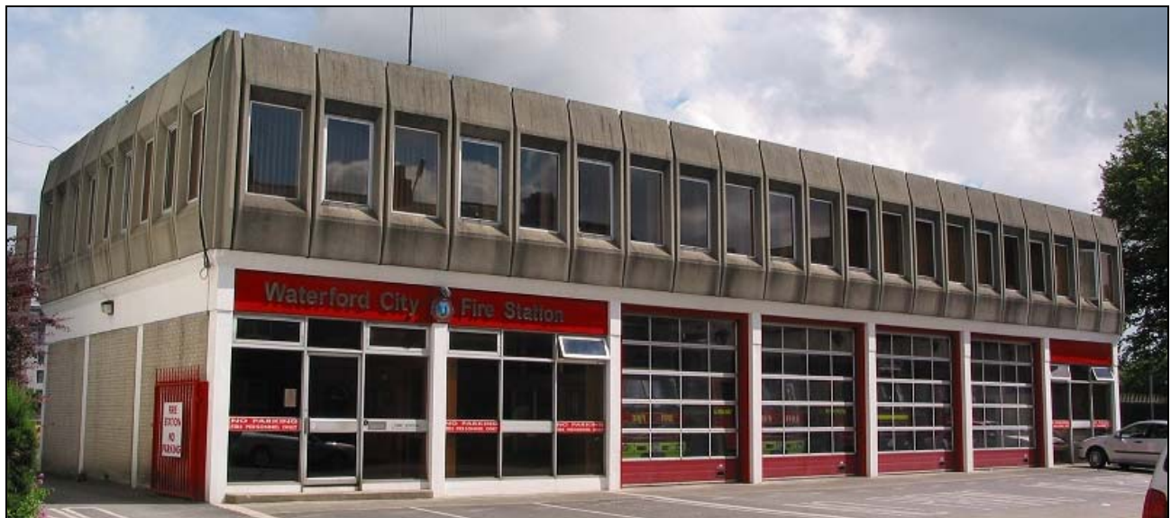
Waterford City Fire Station in Waterford County, Rep. of Ireland.