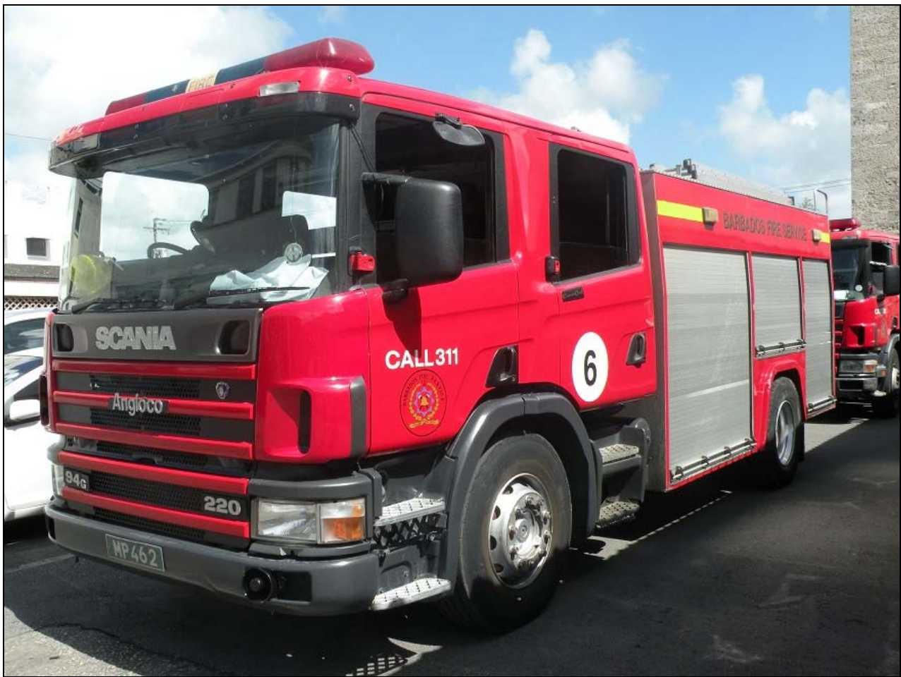
From our international desk This Scania 220/Angloco pump is located at Barbados Fire Headquarters. It's a 2000 model with a 600igwt and 100gft.