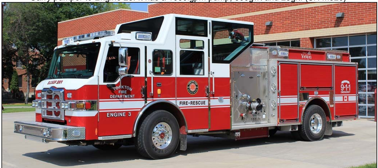
Yorkton Engine 3 is a 2014 Pierce Velocity unit, 1500/600/20A/15B. (SN 27084)