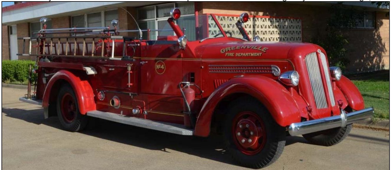
Also in the Texas Fire Museum collection, this former Greenville truck is a 1948 Seagrave engine, with a 750gpm pump and 300gwt. The Texas rigs were shown during the IFBA convention last year.