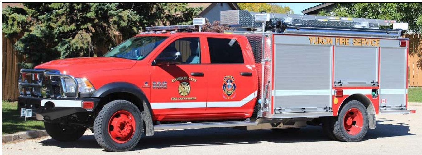
Starting out west: Yukon Fire Service put this 2014 Dodge 5500 4x4/Fort Garry mini into Dawson, it has a 675igpm Waterous pump, 275gwt, 20gft and a 140cfm CAFS.