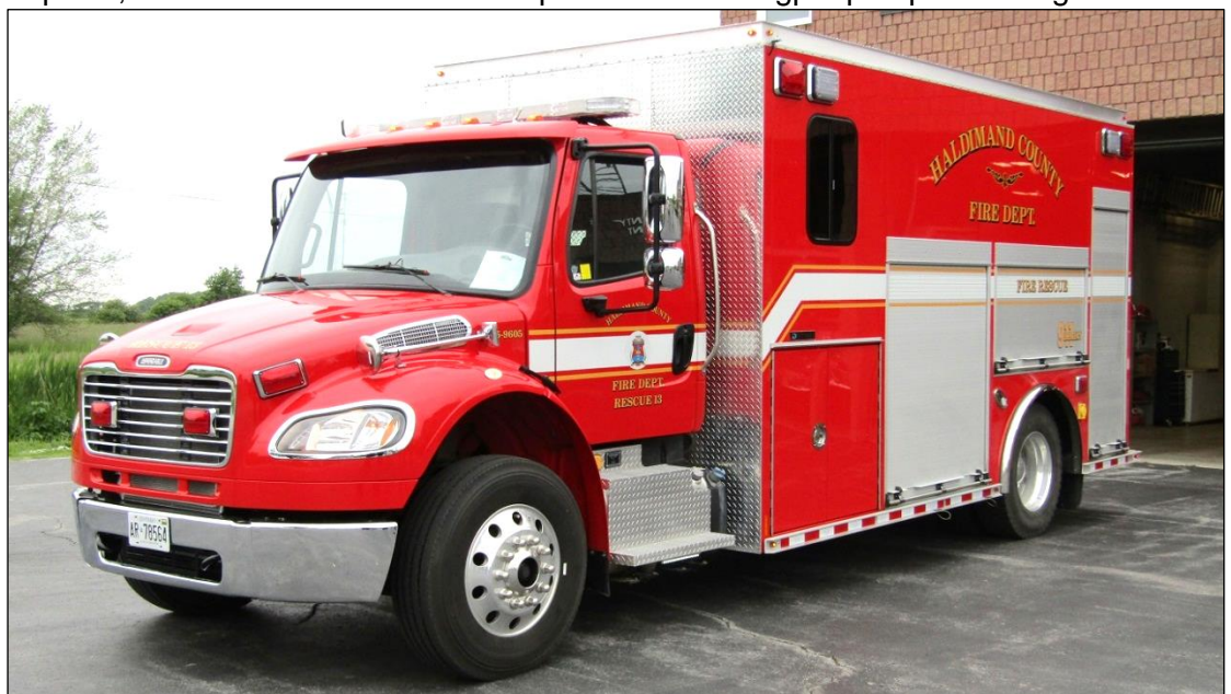
Haldimand Rescue 13, a 2016 Freightliner M2-106/Dependable