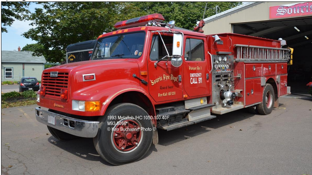
Souris, PEI Pump 1 a, 2002 IHC/Metalfab 1050igpm, 100gwt &40gft.