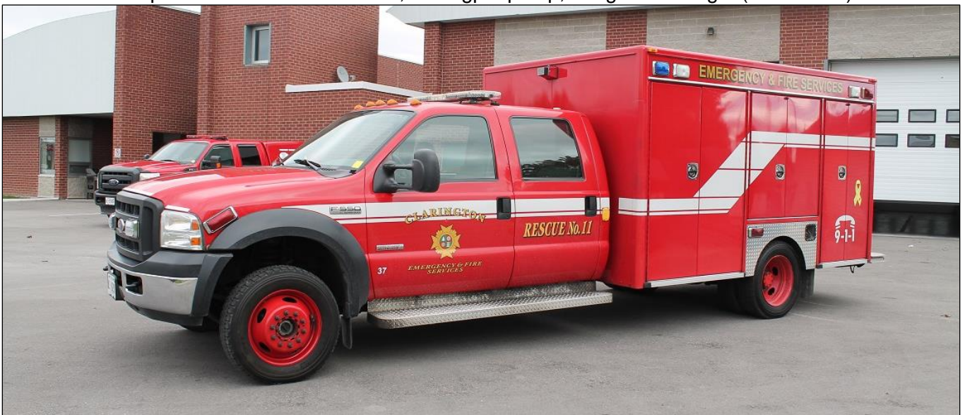
Rescue 11, a 2006 Ford F-550/PK Bodies light rescue