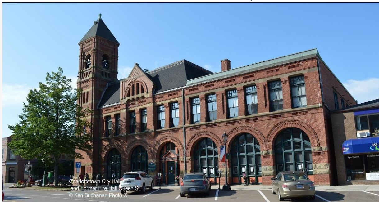
Old Charlottetown Station 1, part of the City Hall at 199 Queen St.