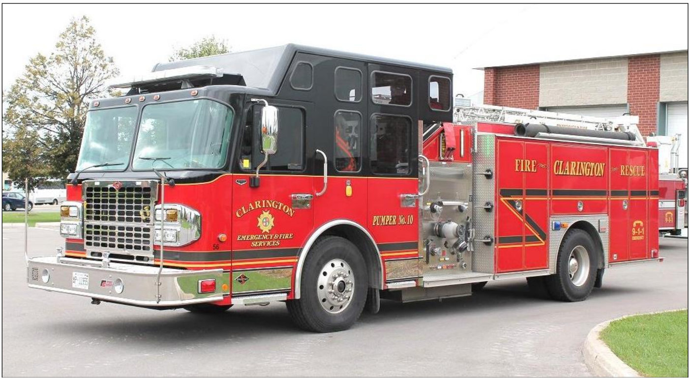
Pumper 10, a 2016 Spartan Gladiator Classic/Fort Garry rig with a 1250igpm pump, 500gwt and 25gft. (SN#M733)