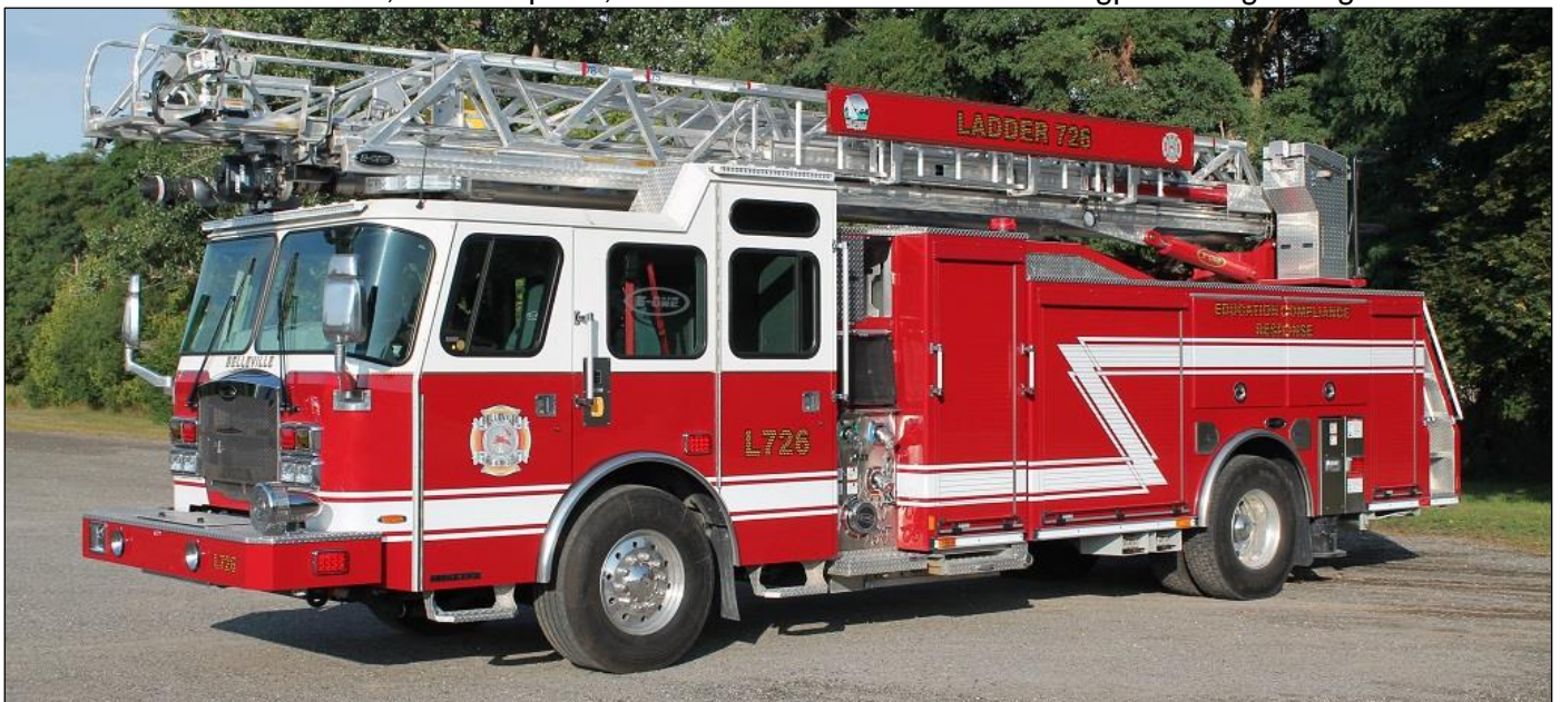
Belleville, ON Aerial 726, a 2019 E-One Typhoon quint 1250igpm/400gwt/25gft/78' sn 141816