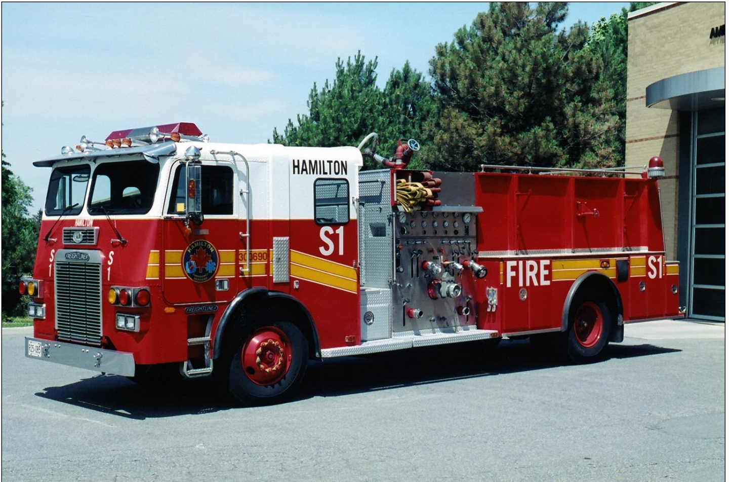
Hamilton ON Squad 1, a 1989 Freightliner FLL/Dependable 1050igpm/500gwt