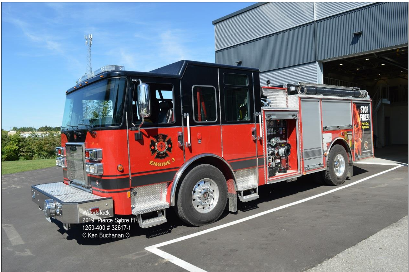
Woodstock, ON Engine 3, a 2019 Pierce Sabre 1250igpm, 400gwt. SN 32617-1