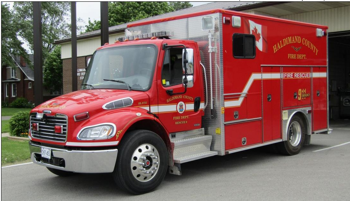
Haldimand County Rescue 9, a 2008 Freightliner M2 / PK Welding walk-in rescue. S#PK09-017