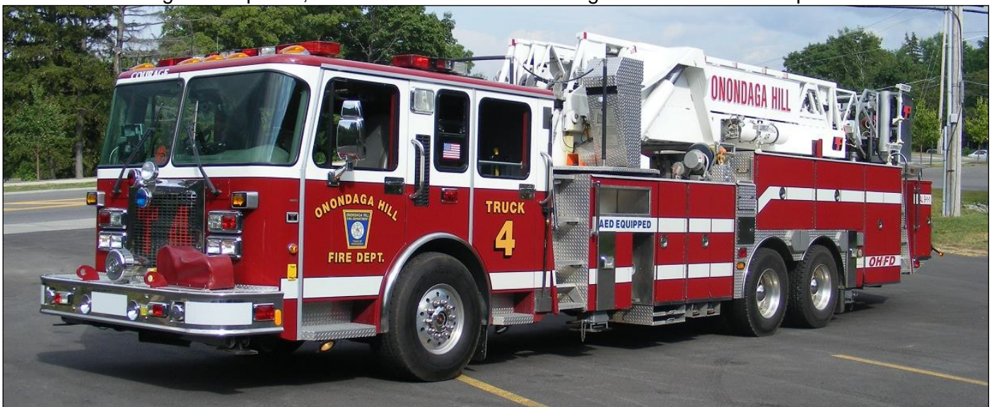
Onondaga Hill Truck 4, a 2000 Spartan Gladiator/LTI 95 foot tower.