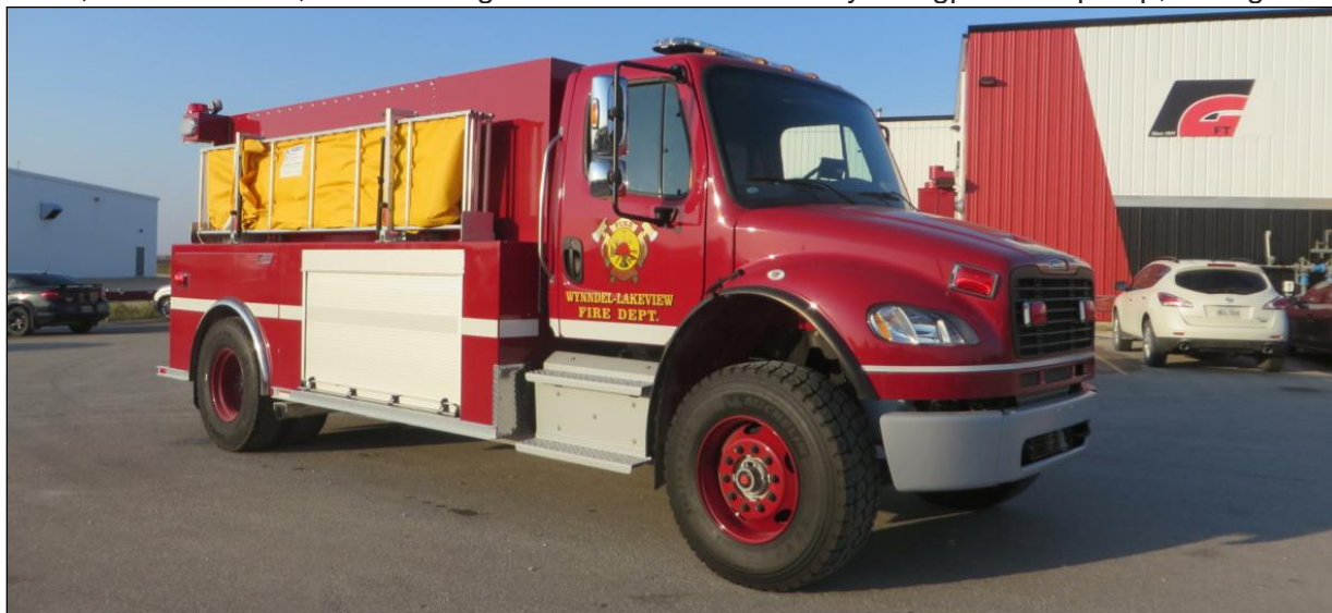
Wynndel Lakeview, BC, a 2019 Freightliner M2-106/Fort Garry 420igpm Hale pump, 2000gwt s/n M985