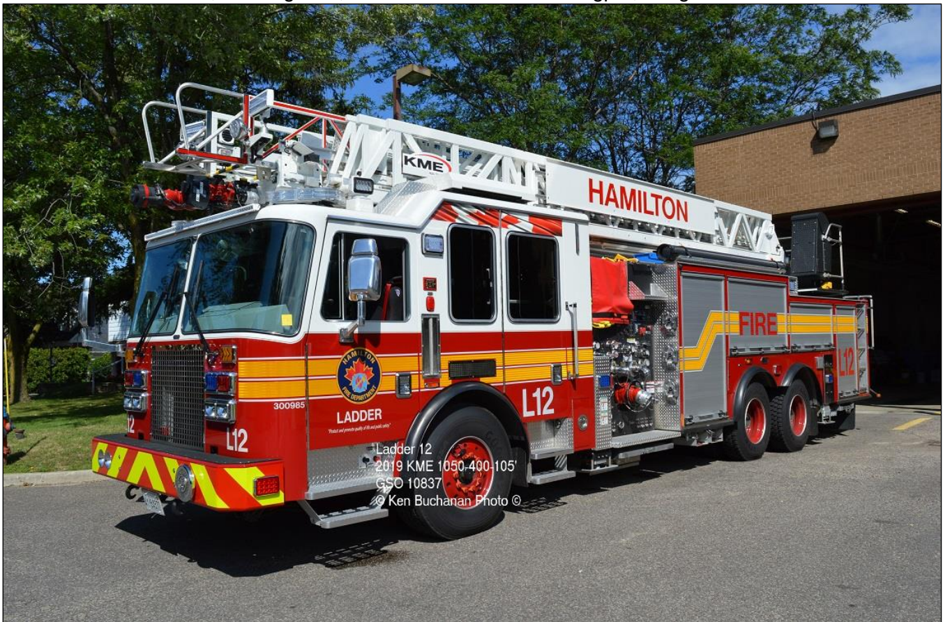
Hamilton, ON Ladder12, a 2019 KME 1050igpm/400gwt/100'