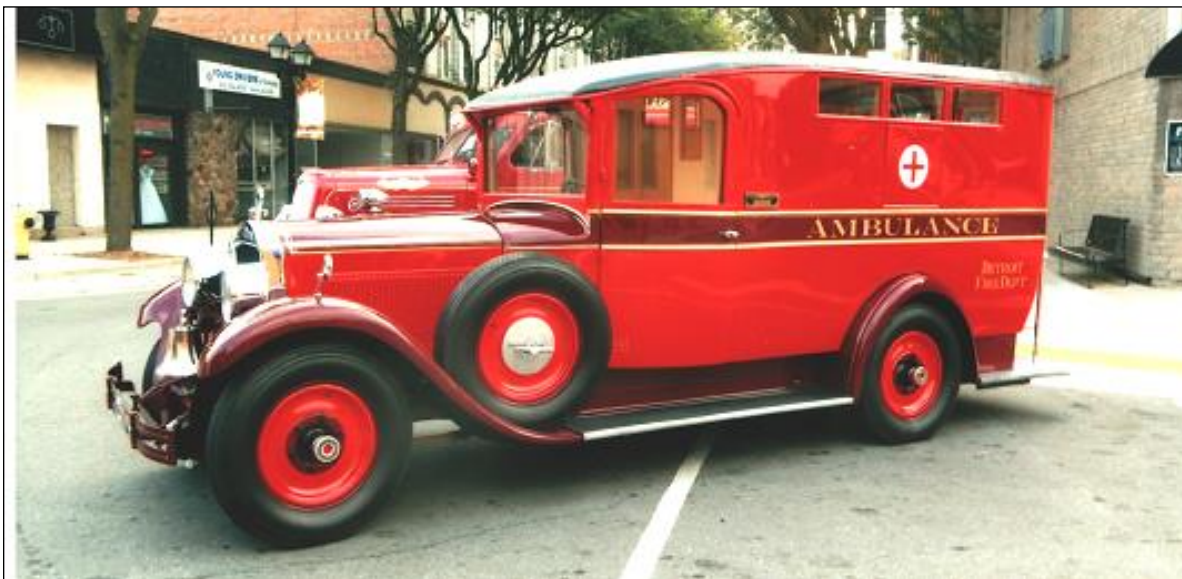
The 1927 Packard Ambulance