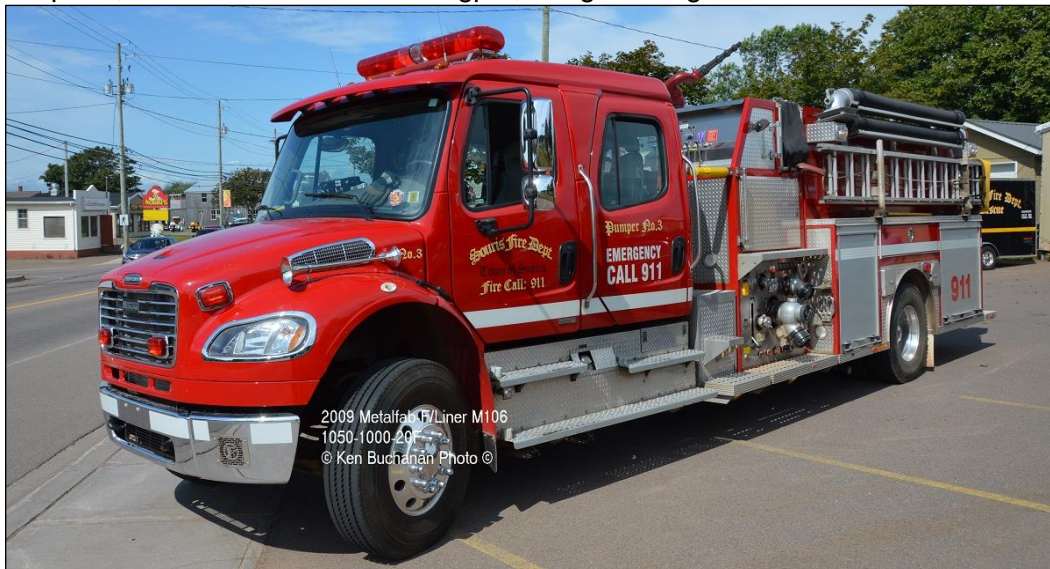
Pump 3, a 2009 Freightliner M2-106/Metalfab, 1050igpm pump, 1000gwt. snM7352