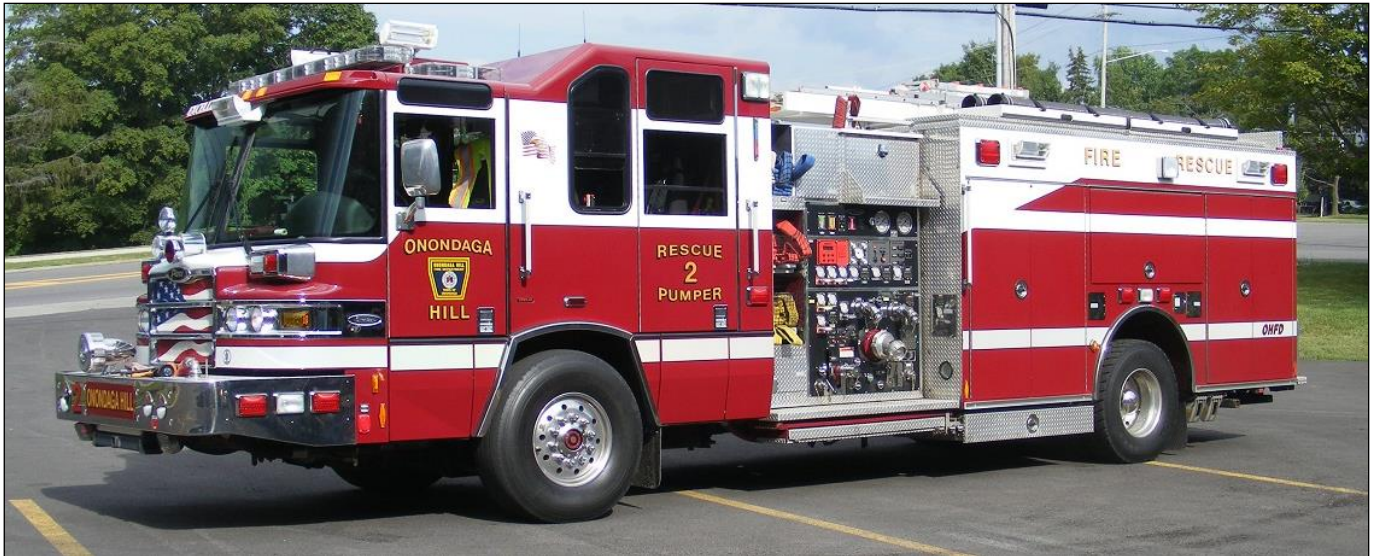
Onondaga Hill Rescue Pumper 2, 2006 Pierce Quantum with a 2000gpm pump and 750 gwt.