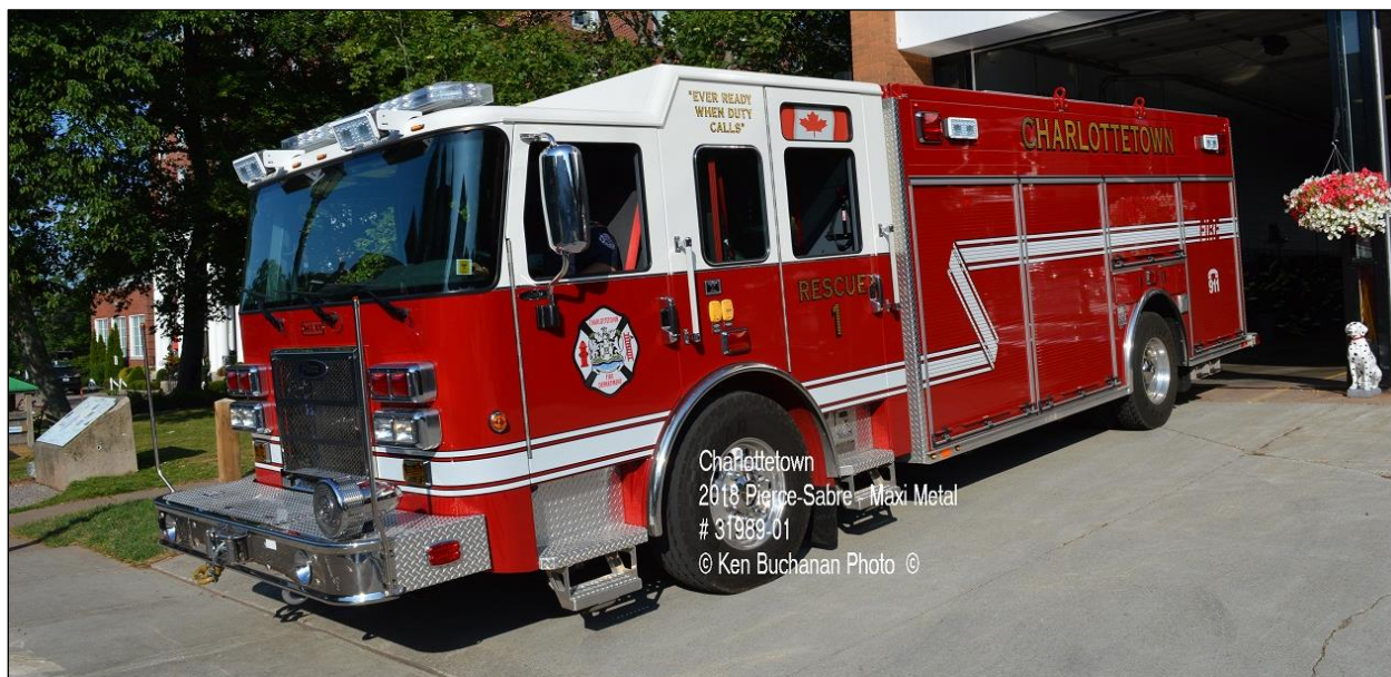
Charlottetown, PEI Rescue 1, a 2018 Pierce Sabre/Maxi Métal heavy rescue. (KB)