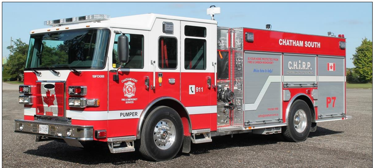
Chatham Kent, ON Pumper 7, a 2019 Pierce Saber Maxi. 1050igpm/1000gwt/25gft