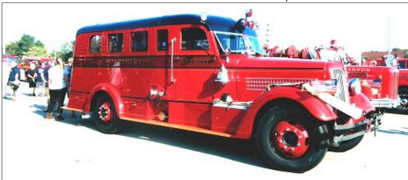
Detroit Firemens Fund's Memorial Caission -- 1937 Seagrave