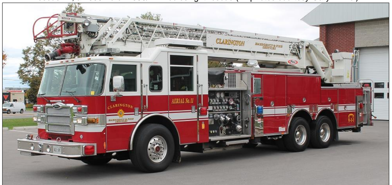
Aerial 11 is a 2007 Pierce Dash quint, 1750igpm pump, 500gwt and 105' HSL aerial. (SN#18867)