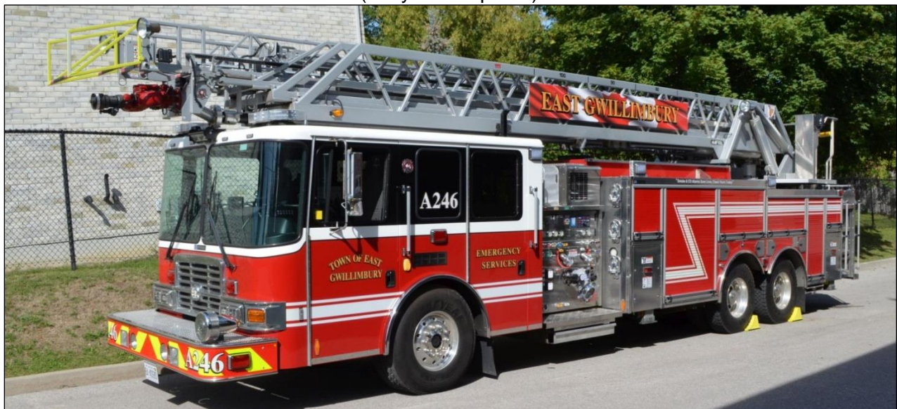
East Gwillimbury Aerial 246, a 2017 HME/Ahrens FoxSpectr/Dependable 111 ft, aerial, With a 2000igpm pump and 500gwt.S#22952, ex demonstrator.