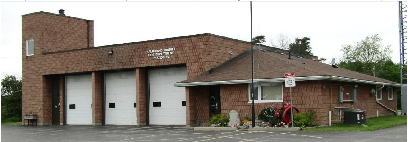
Haldimand Station 13 at 38 Main Street West, Selkirk.