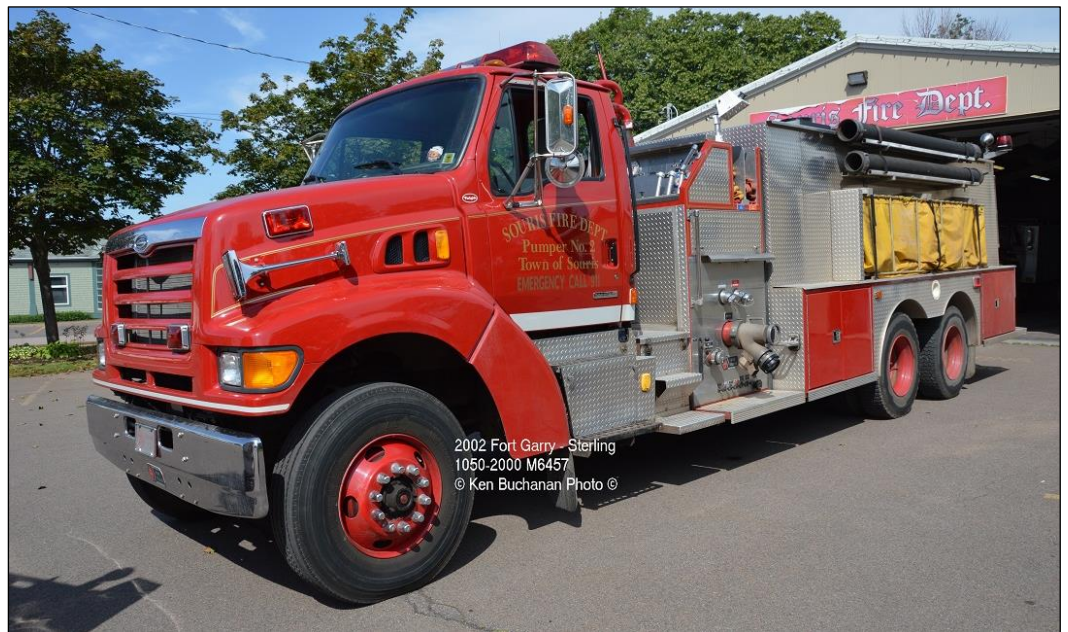
Souris, PEI Pump 2, a 2002 Sterling/Fort Garry 1050igpm, 2000gwt. sn M6457