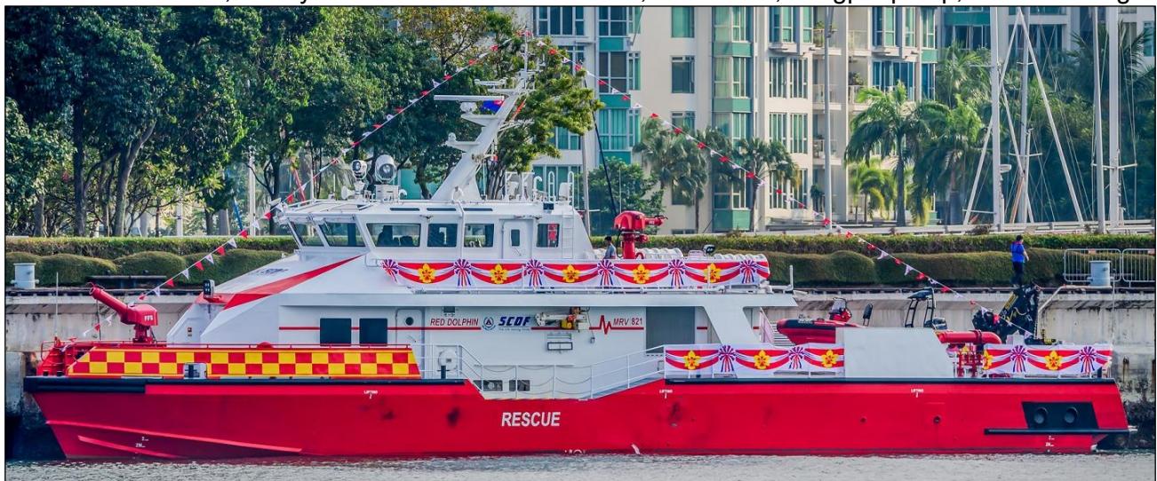
Finally, the SCDF Red Dolphin MRV821, 130' and 12,000gpm. Top speed of 35 kts, has the same crew but can carry 300 passengers and meant for mass casualty incidents.