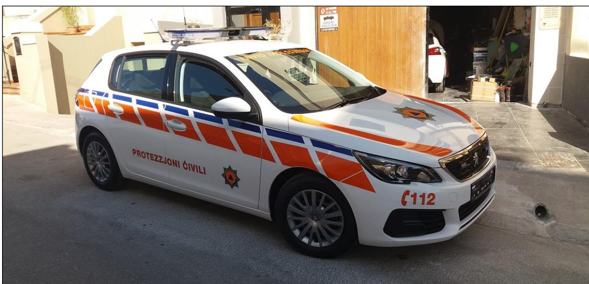
One of the new staff cars and the new 32m turntable ladder, prior to graphics.

Delivery will probably be next year. Also waiting for two fork lifts, one 2.5 ton and the other 5 ton. Four new fire stations are planned to be built - Floriana, Sta. Venera, St Julians and Hal-Far. The existing Kordin fire station will be transformed into a fire service museum. Many of the vehicles in the fleet are more than 20 years old, so the plan is to replace them in the next few years, giving priorities to the older ones as it is difficult to trace spare parts. They recently had the pass out parade for 129 new recruits.