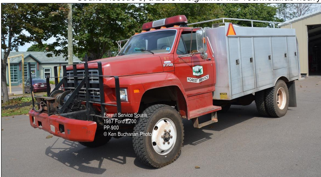
Souris Forestry is a 1987 Ford F700 tanker, 800igwt and portable pump.