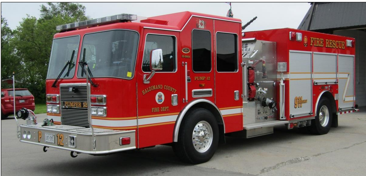
Haldimand Pump 12, a 2009 KME Predator with a 1050igpm pump and an 840gwt.