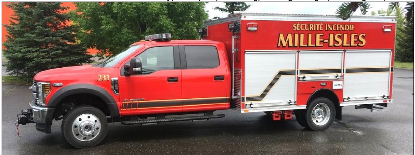
Mille-Isles, QC Unit 231 is a 2019 Ford F550/Maxi light rescue