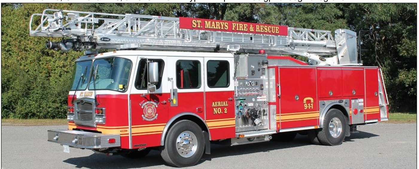
St Mary's, ON Aerial 2, a 2019 E-One Typhoon 1330igpm/400gwt/17gft s/n 165993