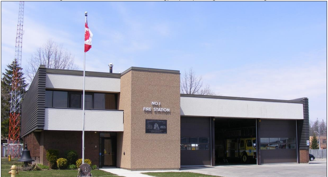
Fire Station 1 at 388 Erie Street.