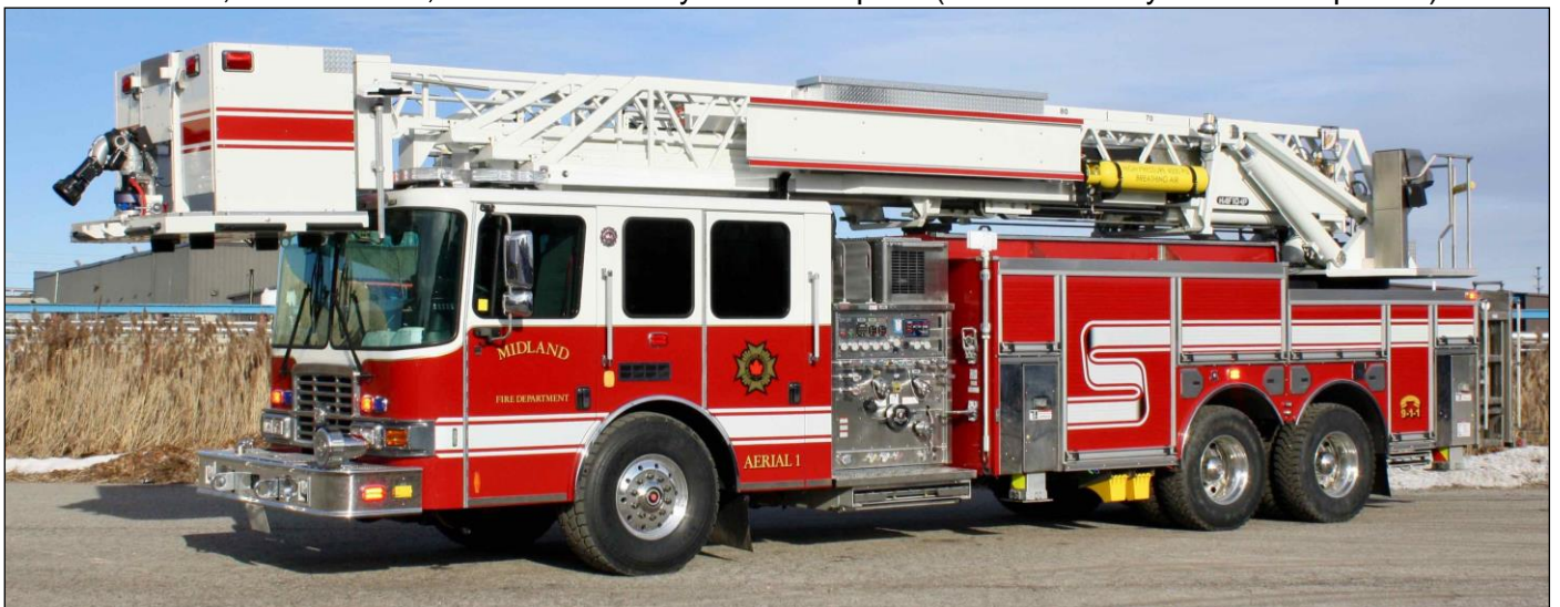
Midland Aerial 1, a 2018 HME Ahrens-Fox 1871-Spectr MFD 1665igpm/420gwt/104' platform.