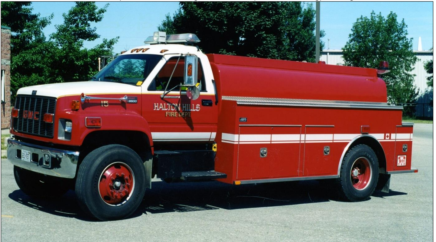
Halton Hills ON Unit 15, a 1999 GMC C8500/Almonte PP/1500igwt.