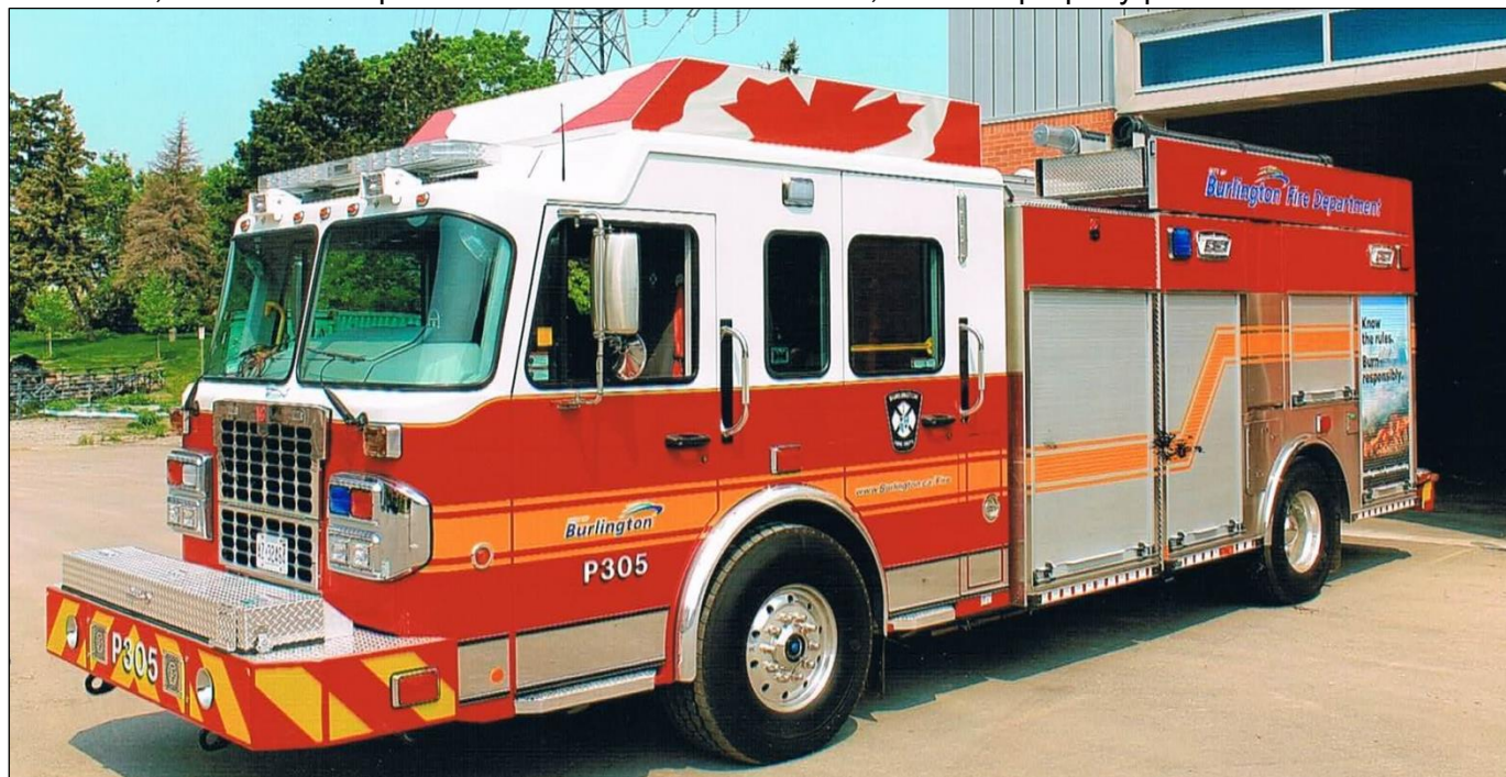
Burlington, ON Pump 305, a 2018 Spartan MetroSmeal, 1050igpm pump, 900gwt and 40gft. SN 4839