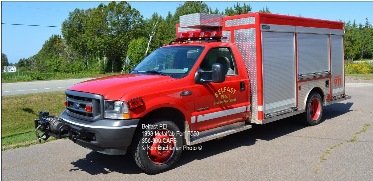
Belfast PEI 1998 Metalfab Ford F550 350-100 CAFS