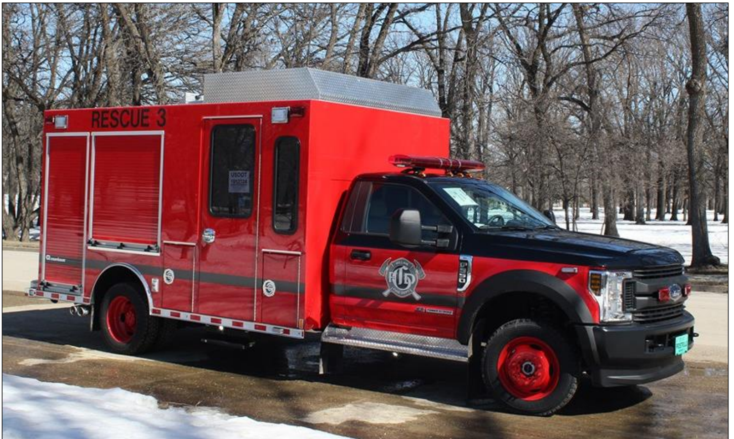
Gillam, MB Rescue 3 is a 2019 Ford F550 4x4/Rosenbauer s/n #42414