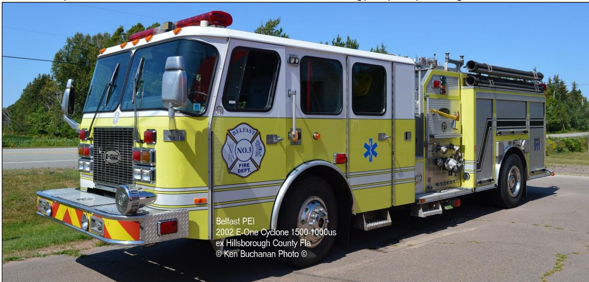
Belfast PEI 2002 E-One Cyclone 1500-1000us ex Hillsborough County Fla