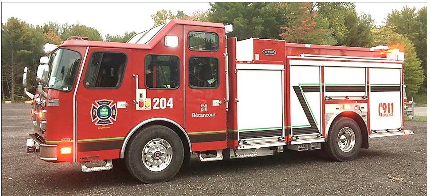
Bécancour, QC 204, 2019 E-One Typhoon pumper 1050igpm/840gwt/25gft (1200 degrees)