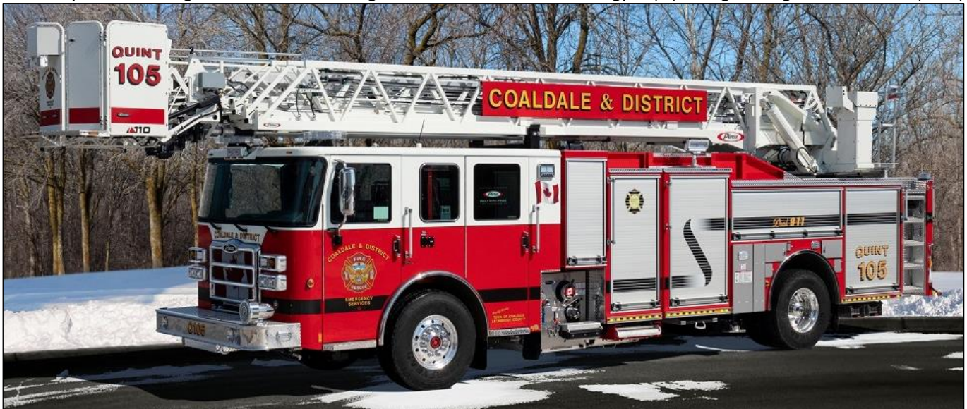
Coaldale, AB Quint 105, a 2019 Pierce Enforcer PUC 1250igpm/390gwt/25gft 110' platform SN 32750