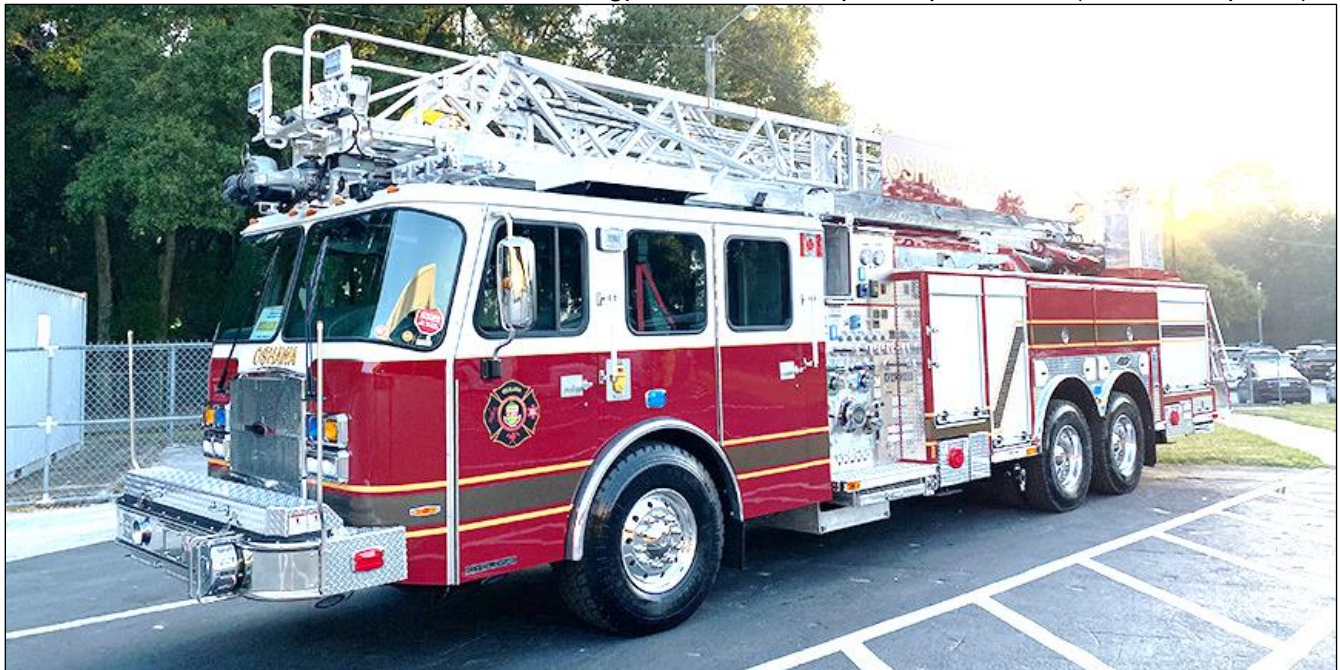
Oshawa, ON Aerial 22, a 2019 E-One Cyclone 100 quint.