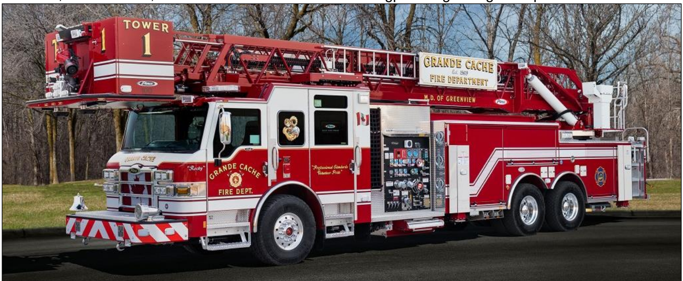
Grande Cache, AB Tower 1 2019 Pierce Velocity 2000gpm/300gwt/100' platform, Husky 12 FS sn32916