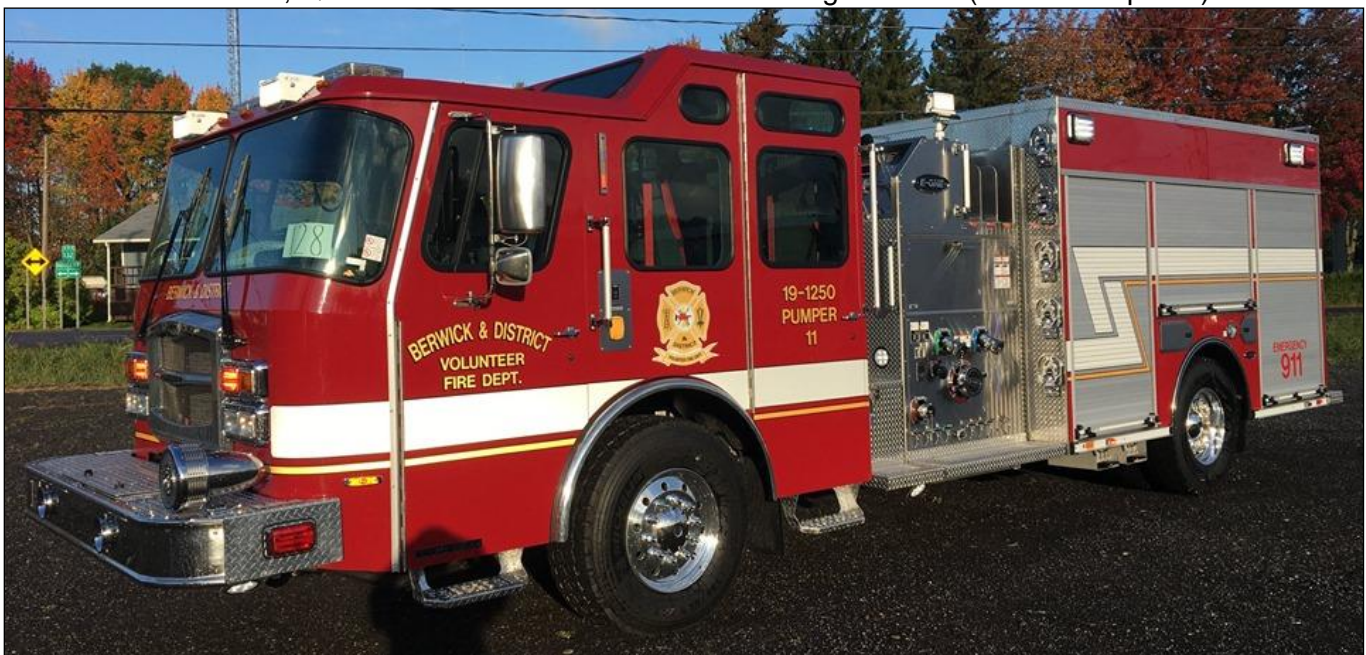
Berwick, NB Pumper 11 - 2019 E-One Typhoon 1250igpm/1030gwt/30gft (SN 142942) (1200 degrees)