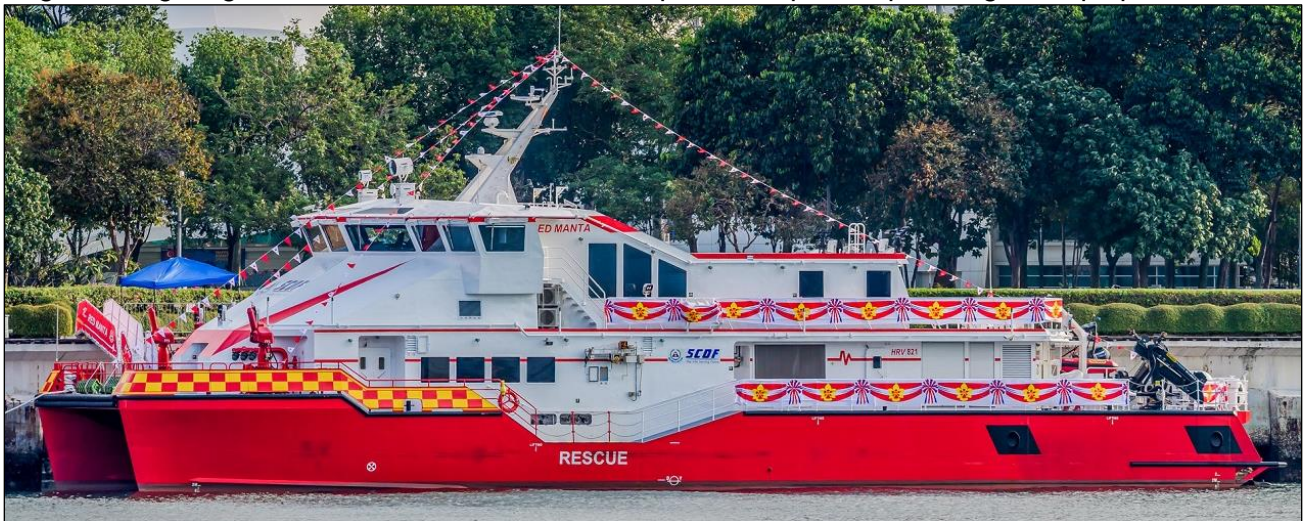
SCDF Red Manta, Heavy Rescue Vessel 821. At 115', it has a 23,000 gpm pump, same crewing.