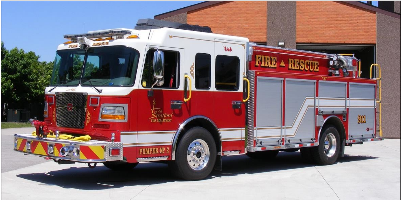
Engine 2, a 2008 Rosenbauer 1050igpm pump, 640gwt and two 20gfts.

Engine 2 2008 Rosenbauer 1050igpm/640gwt/2x20gft Aerial 1 1992 E-One Hurricane 1250igpm/640gwt/110' aerial (to be replaced in 2020)