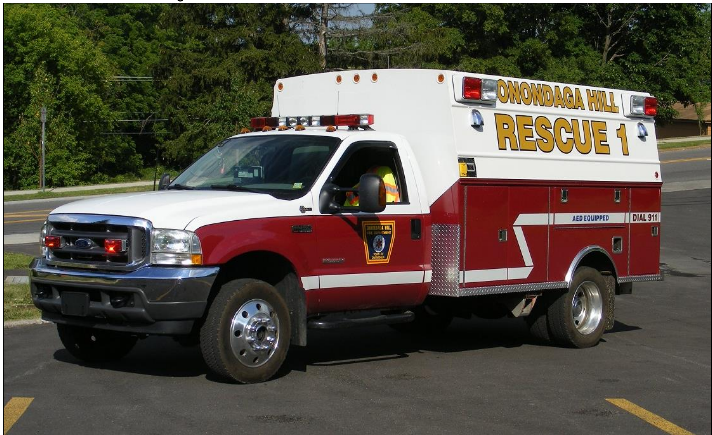
Onondaga Hill, NY Rescue 1, a 2003 Ford F450/Braun light rescue