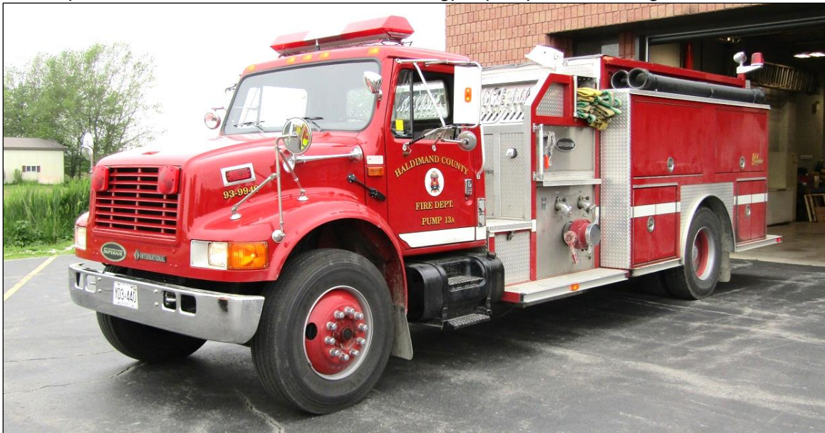
Haldimand Pump13A, 1993 International 4900 / Superior with 1050igpm pump and 800gwt.