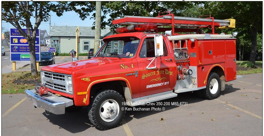
Souris Pump 4, a 1985 Chevrolet/Metalfab, 350igpm pump, 200gwt. snM85-4731