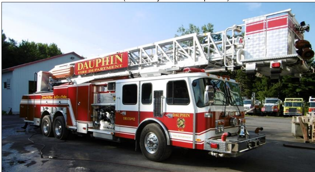
Dauphin, MB Truck 12, a 2001 E-One Hurricane 1875igpm/250gft/95' platform SO#123706) (Ex-Chicago Ridge Fire Department) (1200 Degrees)