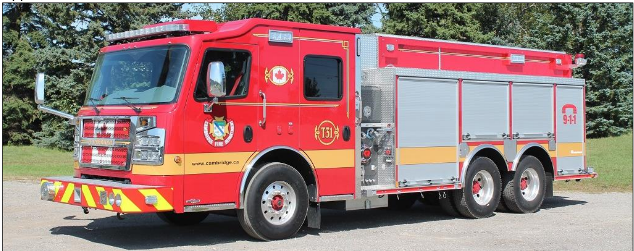
Cambridge Tanker 31, a 2019 Rosenbauer Commander, 1050igpm pump, 2083gwt & 25gft>