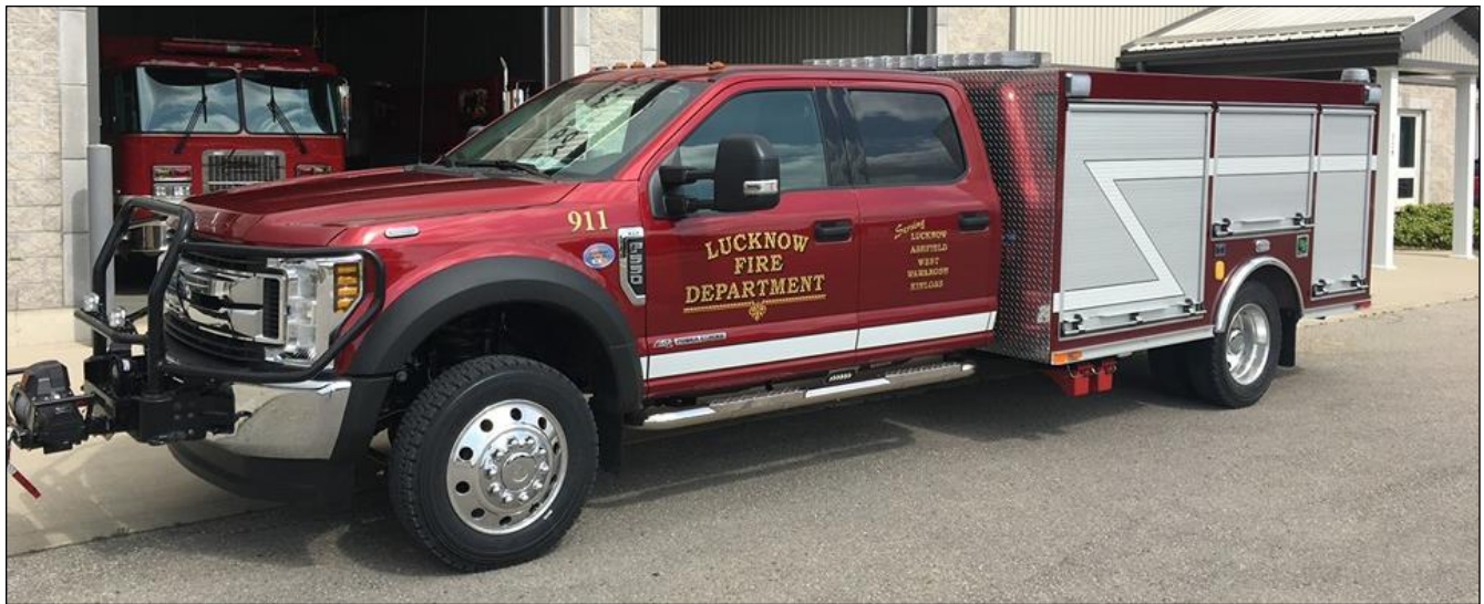
Lucknow, ON 911, a 2019 Ford E-One 1250igpm F550/CET rapid response unit