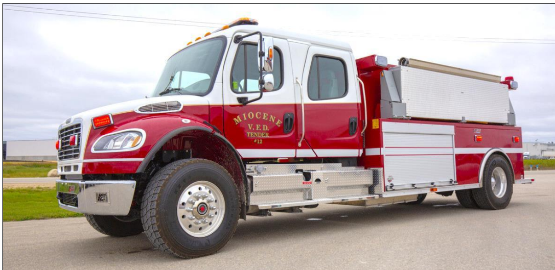
Miocene, BC Tender 12, a 2019 Freightliner M2-112 /Fort Garry 625igpm Hale pump, 1700gwt M989