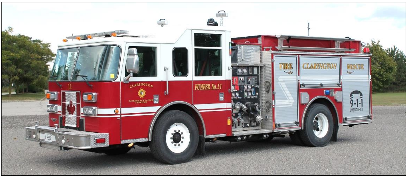
Pumper 11 - 2007 Pierce Saber, 1050igpm pump, 800gwt and 40gft. (SN#19641)