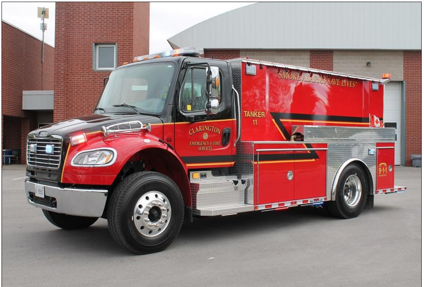
Just delivered is Tanker 11, a 2019 Freightliner M2 106/Dependable rig with a 1500igwt and a portable pump.