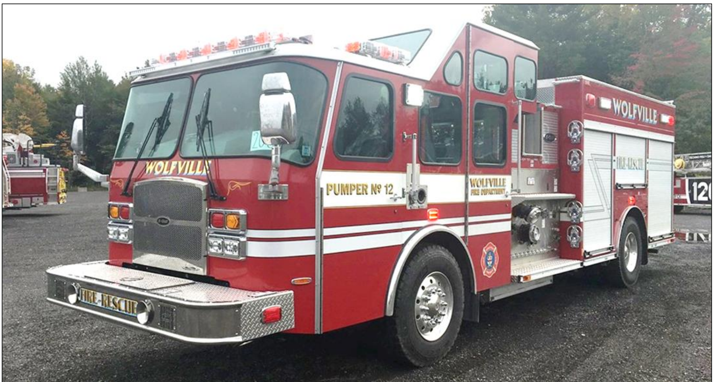
Wolfville, NS Pump12 2019 E-One Typhoon X 1500igpm Hale /650gwt/25gft (SO#142313) (1200 Degrees)