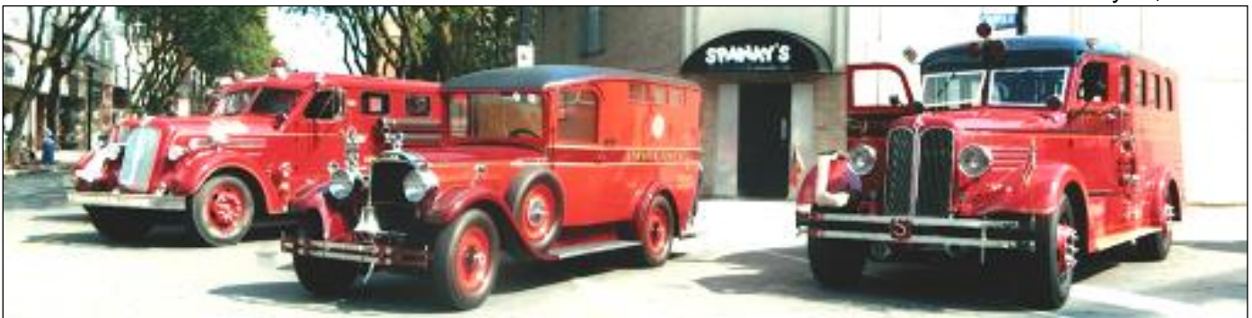
Three ex-Detroit Fire Department rigs on display at Chatham FireFest

More than 60 pieces of antique and vintage fire apparatus, ambulances and police cars participated in the 2019 FireFest. Another special display there this year was “ Aerial Alley ” – a display of no fewer than six tractor-drawn tillered aerial ladder trucks – probably the largest such gathering of tillered rigs ever seen in Canada. The display included a 1930 Seagrave with 85-foot spring-raised wooden ladder which saw many years of service in Syracuse NY; a 1938 Seagrave 75' aerial with a hydraulically-raised 75-foot metal aerial, ex-Rome NY; a 1948 Thibault/International KB tractor attached to a 1932 American-LaFrance aerial trailer, ex-Verdun QC; a 1962 Mack “B” Model tractor with a 1950 ALF 100' aerial trailer, ex-Philadelphia PA, and an ex-Phoenix AZ 1999 ALF Century Series 100' aerial owned by a group of fire apparatus buffs who drove it to Chatham from Fort Wayne, Indiana.