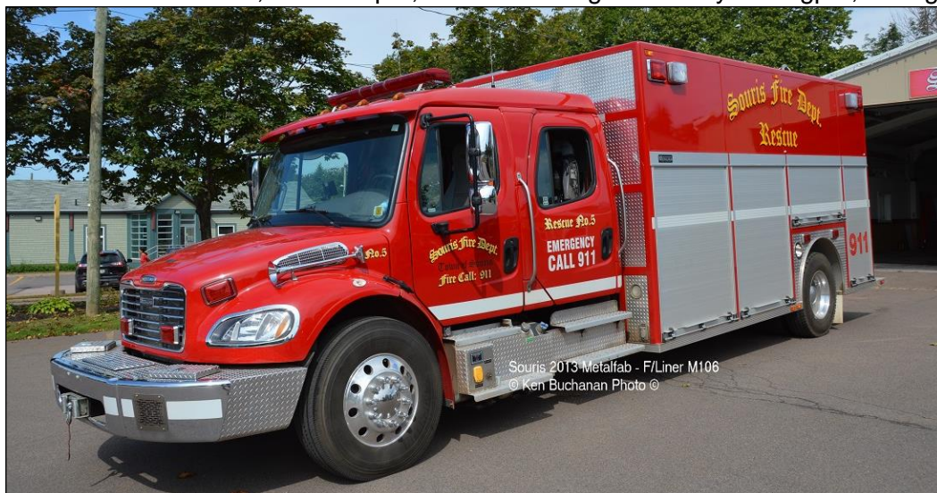
Souris Rescue 5, a 2013 Freightliner M2-106/Metalfab heavy rescue.