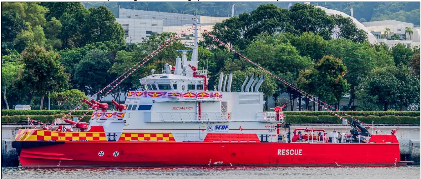
SCDF Red Sailfish or Heavy Fire Vessel 821. The boat is 164' long and is staffed with four crew and eight firefighters. It can pump 64,000 GPM (240,000 LPM) through 12 water & foam monitors, currently it is the largest firefighting vessel in the world. It also has space for up to 30 passengers, top speed of 20kts