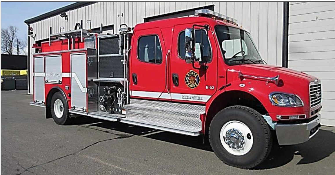
Malaspina, BC Engine 53, a 2019 Freightliner M2-106/Hub 1050igpm(H)/900gwt/20gft SO# 1249 (Hub)