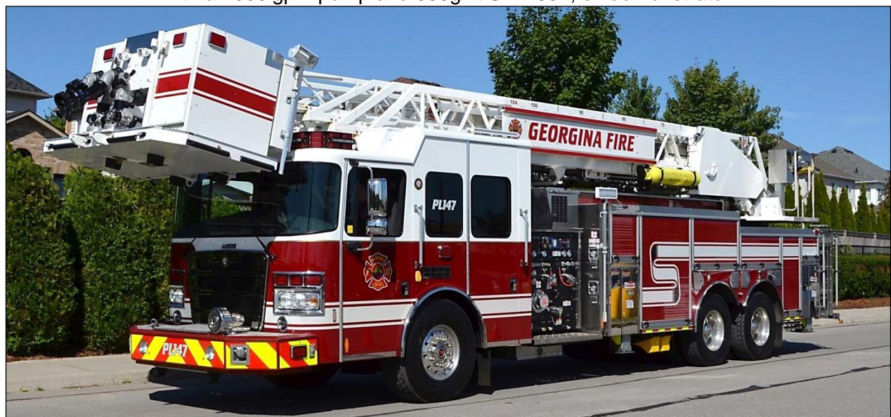
Georgina Platform 147, a 2019 HME Ahrens Fox AF-1, 104' platform equipped with a 1750igpm pump, and a 400gwt. This was also a demonstrator.