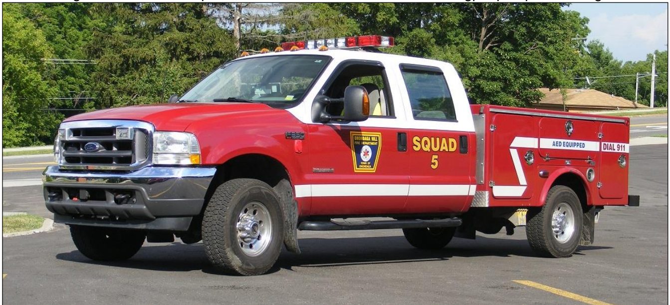
Onondaga Hill Squad 5, a 2003 Ford F350/Brand FX light rescue/medical response