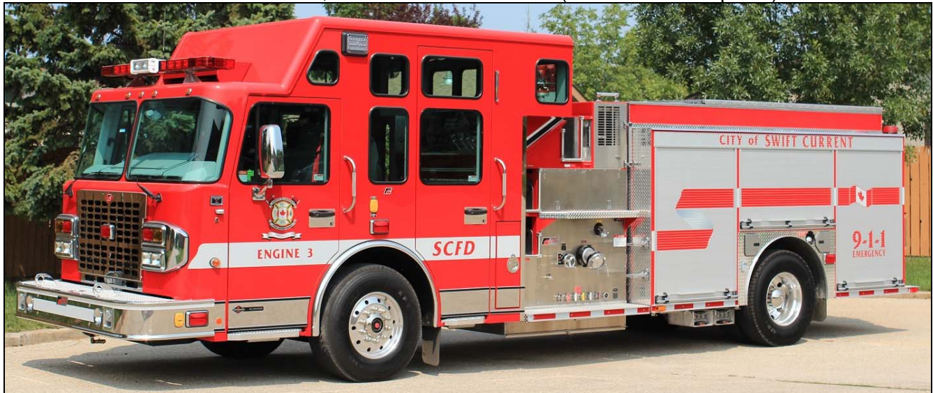
Delivered in July to Swift Current, SK, Engine 3 is a 2014 Spartan Gladiator/Fort Garry product with a 1050igpm pump, 600gwt and 25ft. It carries serial number M524.