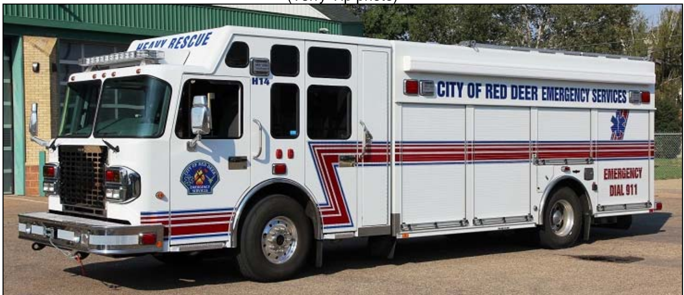
Red Deer, AB recently took delivery of this 2014 Spartan Gladiator ELFD/SVI walk-up rescue, 20' box.