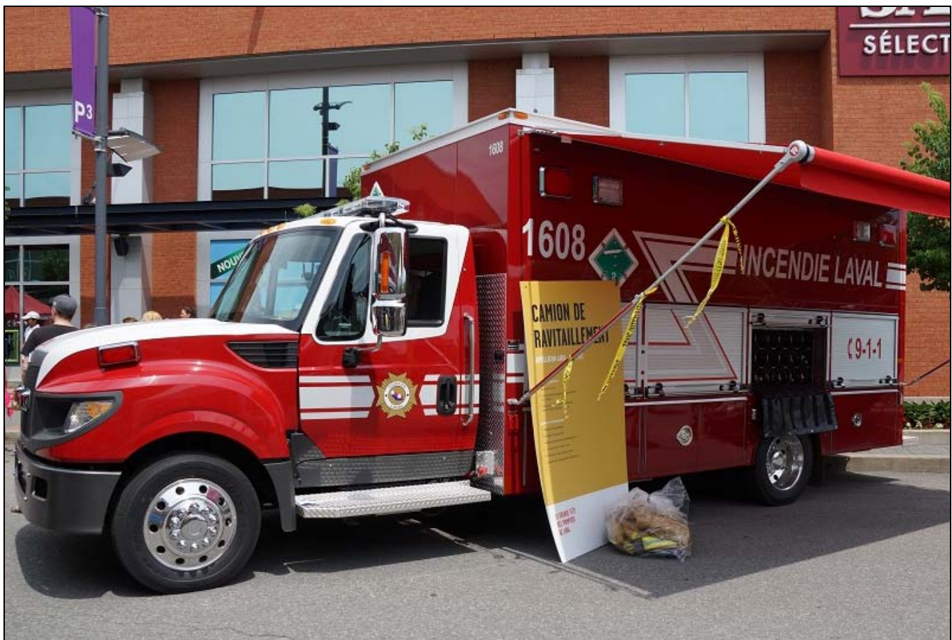
Delivered last year, this is Laval's Airlight, a 2013 IHC Terrastar/Lafleur product.