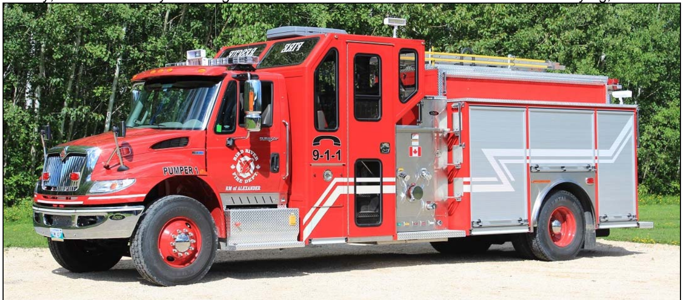
Late last year Bird River, MB put this 2013 IHC 4400/Acres pumper in service. It sports a 1050igpm pump, and an 800gwt (s/n 131220111).