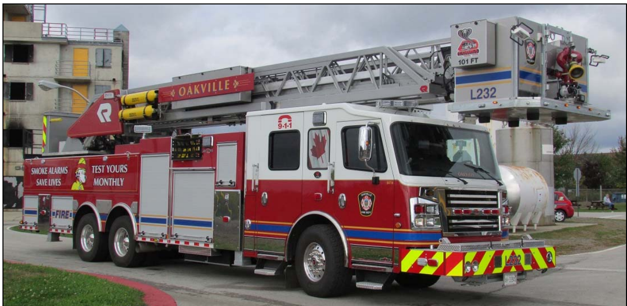
Oakville just received this 2014 Rosenbauer Cobra 101' platform for L232