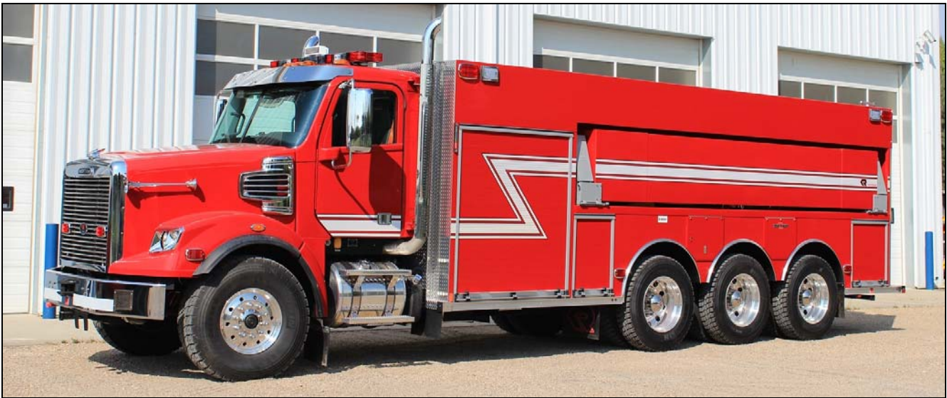
This is Rosenbauer's first four axle tanker. Just delivered to Valleyview, AB, on a Freightliner Coronado chassis, it has a 420igpm pump and a 4000gwt.