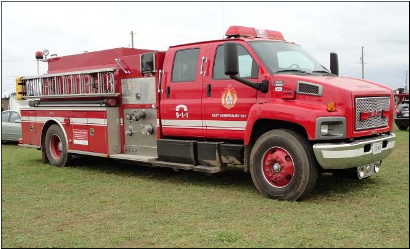
From even further east we have East Hawkesbury Twp. Unit 1, a 1999 GMC 8500/Almonte pumper with an 840igpm pump and 1250gwt.