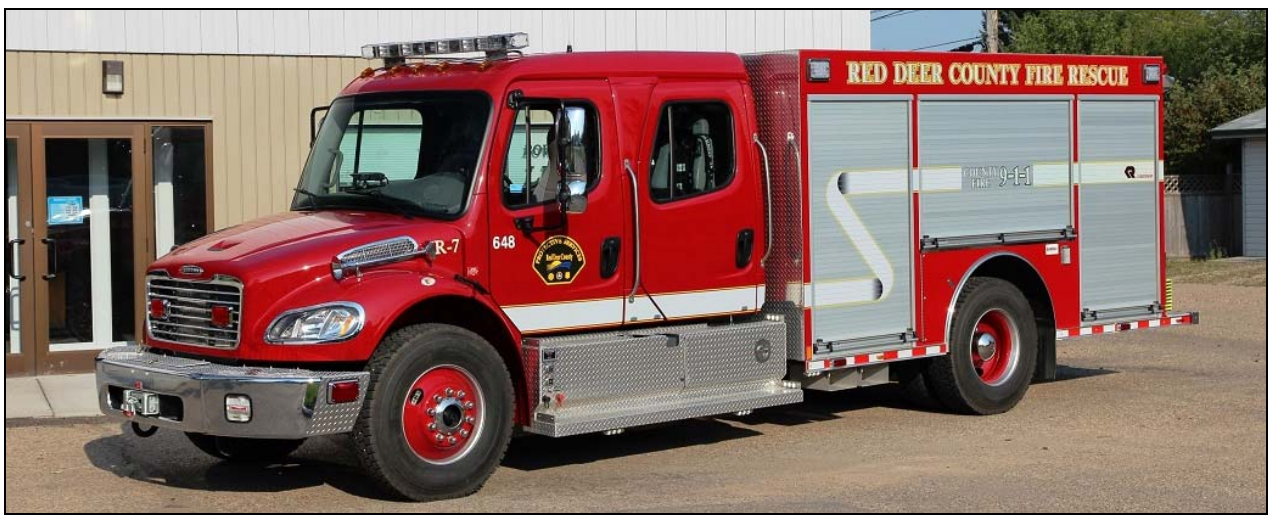
Red Deer County, AB recently got this 2014 Freightliner M2-106/Rosenbauer heavy rescue, with a 14' box. Labeled Rescue 7, it's stationed in Bowden.