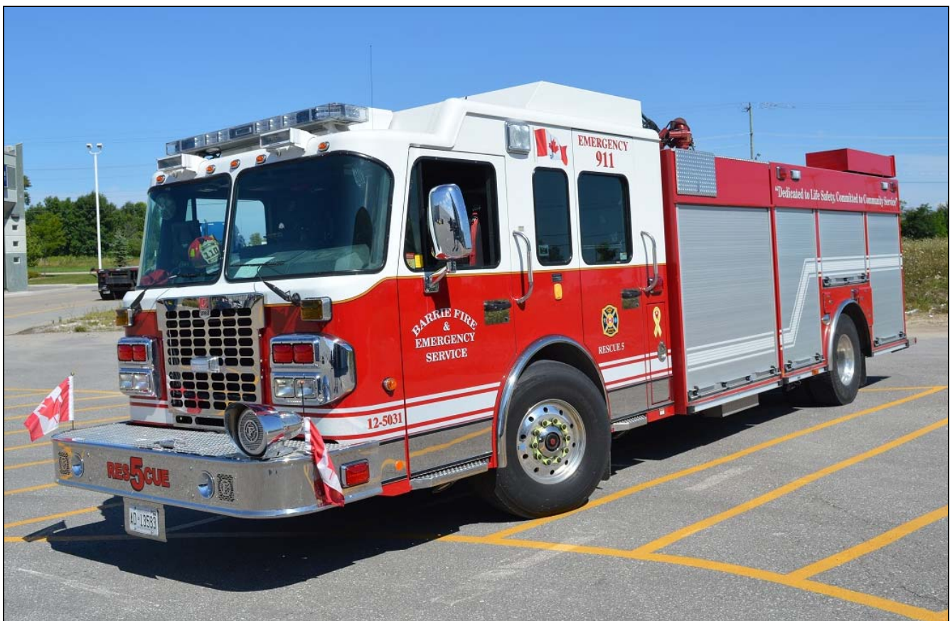
Barrie Rescue 5 is a 2012 Spartan/Smeal rescue pump. It has a 1050igpm pump, a 625gwt and a pair of 20gfts. It runs from a temporary Station 5 on 371 King St. until the new hall is built. (SN xx75830)