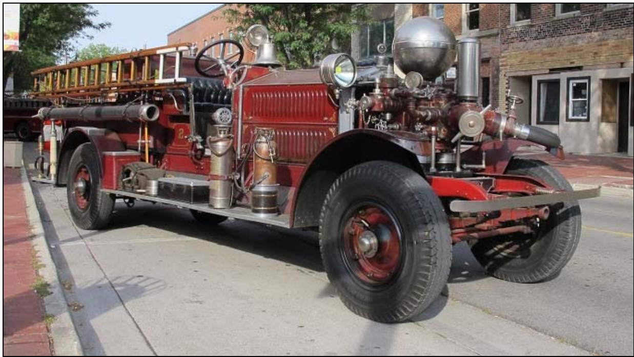
At Chatham Firefest: A 1925 Ahrens-Fox piston pumper owned by RM Restorations of Blenheim. This JS4 model served with Washington Courthouse, OH