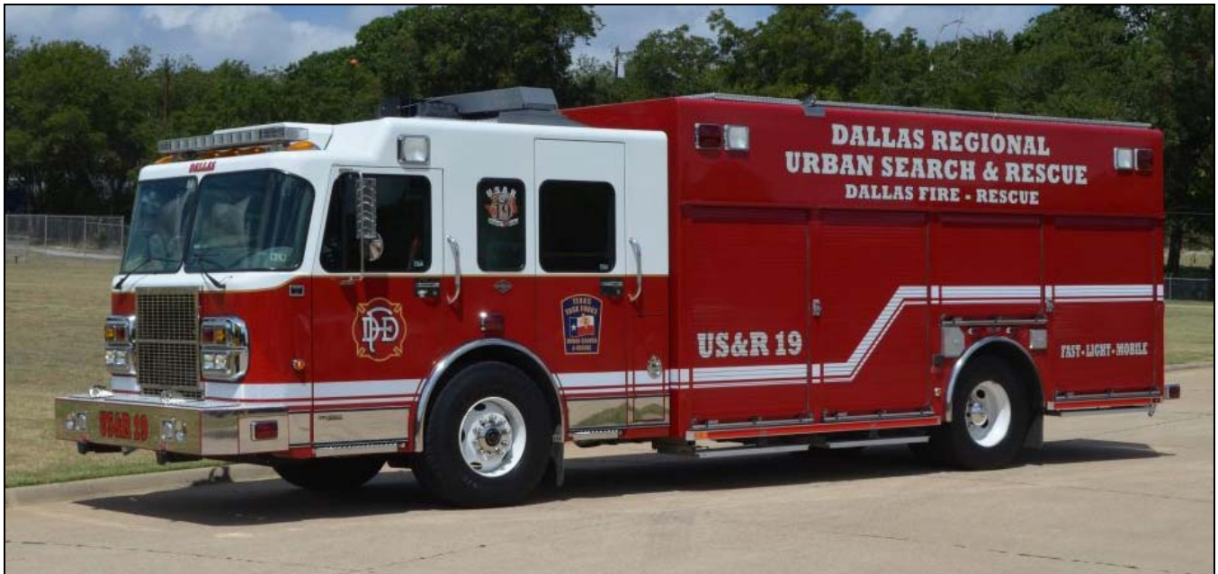
Two Dallas FD rigs: Urban Search & Rescue 19, a 2011 Spartan / SVI Heavy Rescue (SN 559) and Truck 37, a 2014 Spartan ERV/Crimson 103' Aerial (SN 213104-01).

There were no major fires but the weather was spectacularly sunny and the locals were friendly and welcoming. Next year Hartford, CT is hosting, (August 12 to 15), and 2016 is in Baltimore.