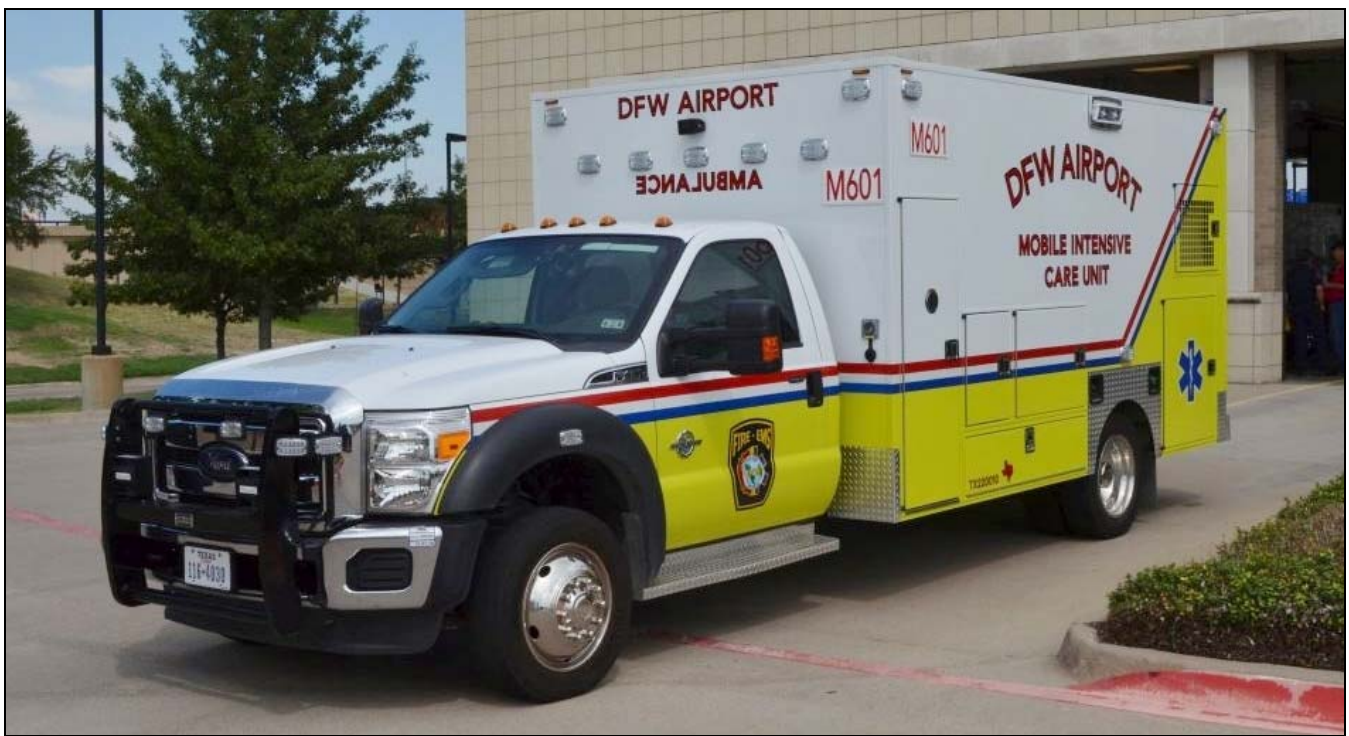
Two rigs presented at the 2014 IFBA Convention in Dallas. Run by the Dallas Fort Worth Airport Fire/EMS Service, Mobile Intensive Care Unit 601 is a 2012 Ford F450/Frazer ambulance (SN E2365), and Trauma 611 is a 2004 Pierce Heavy Rescue (SN 15523).