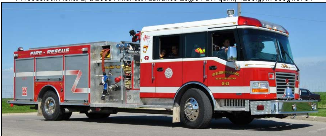
Strathroy-Caradoc Engine 21. A 2003 Rosenbauer Commander 3000, 1050igpm, 800gwt, 30gft.