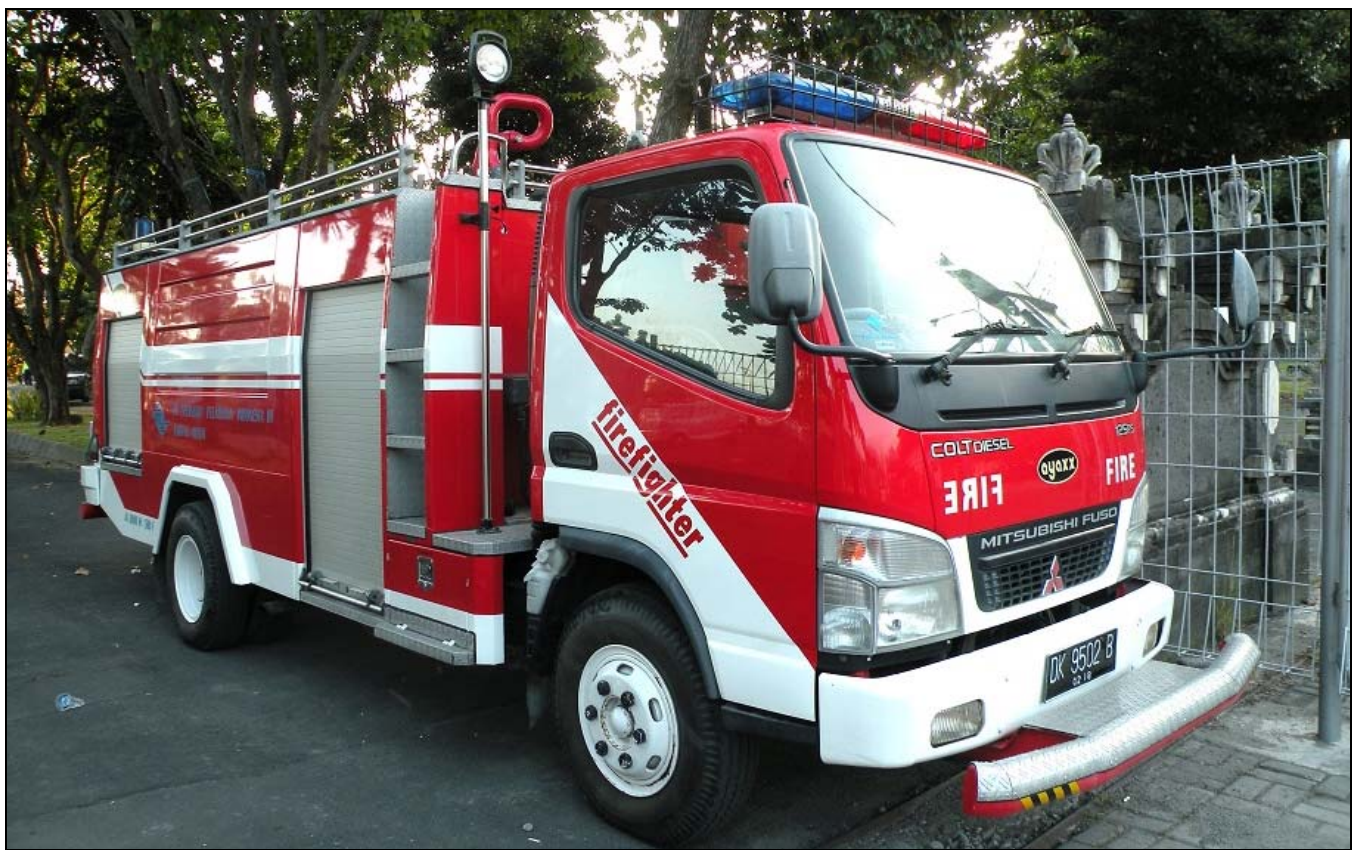
From the international desk: This small pump belongs to the Benoa, Bali fire service. It's a 2007 Mitsubishi Fuso/Ayaxx tanker that carries 3000L of water and 500L of foam.