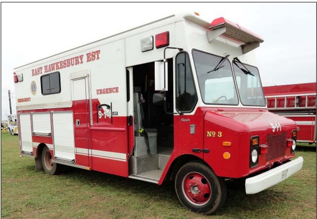
Also East Hawkesbury Twp. Unit 3, a 2001 GMC/Almonte step van rescue.