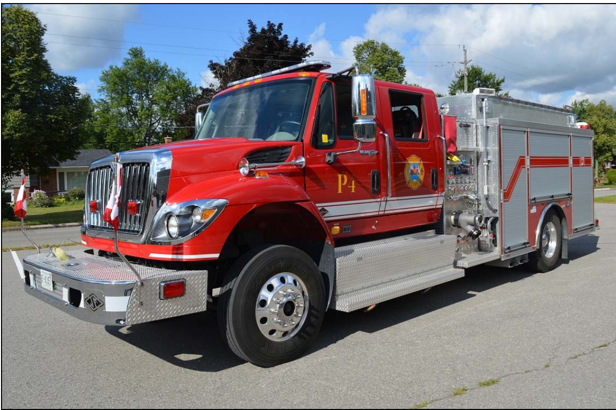
Delivered late last year, Niagara Falls Pump 4, a 2013 IHC Workstar/Spartan ERV/DEV compilation came with a 1500gpm pump and a 1000gwt.