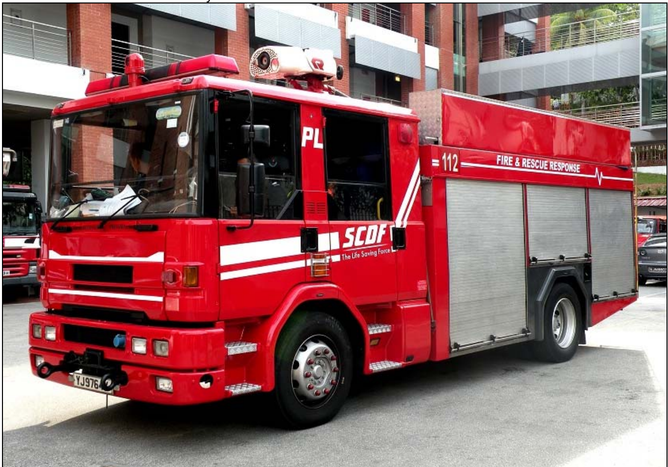
From Singapore, this is PL 112, a Dennis RS235/Rosenbauer pump-ladder in the new paint scheme. It runs from the SCDF Central Station.