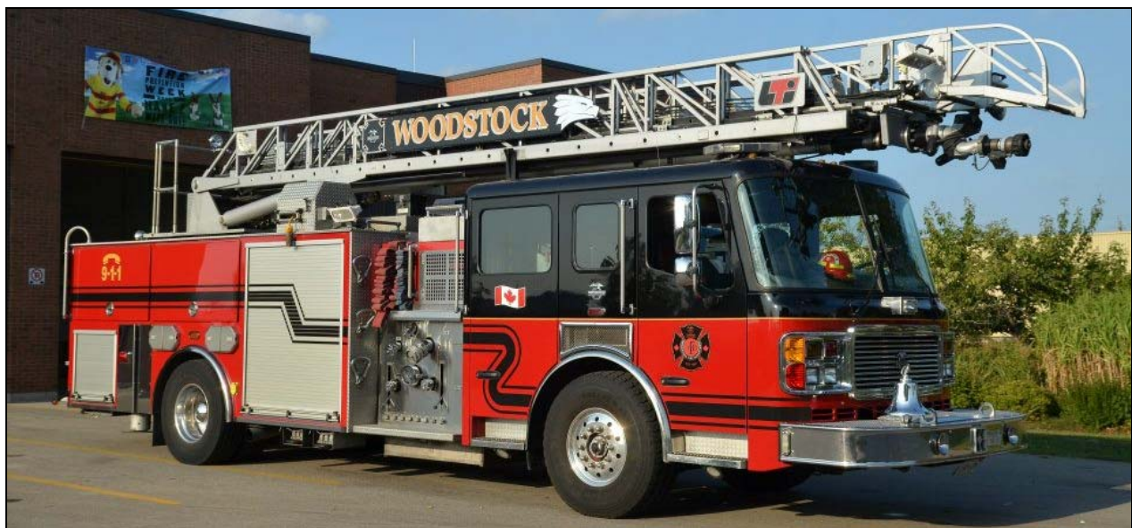
. Woodstock Aerial 2, a 2005 American LaFrance Eagle / LTI quint, 1250igpm/300gwt/75'.