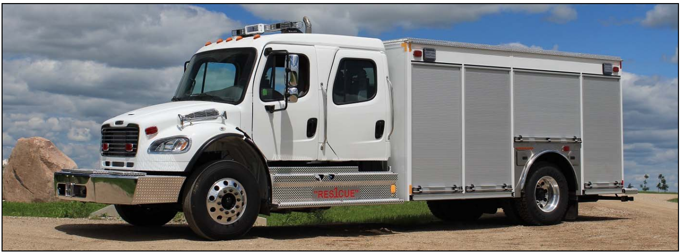
Some more unmarked rigs recently delivered: Fort Assiniboine, AB recently received a 2014 Freightliner M2-106/Facres heavy rescue. (s/n 140620117)