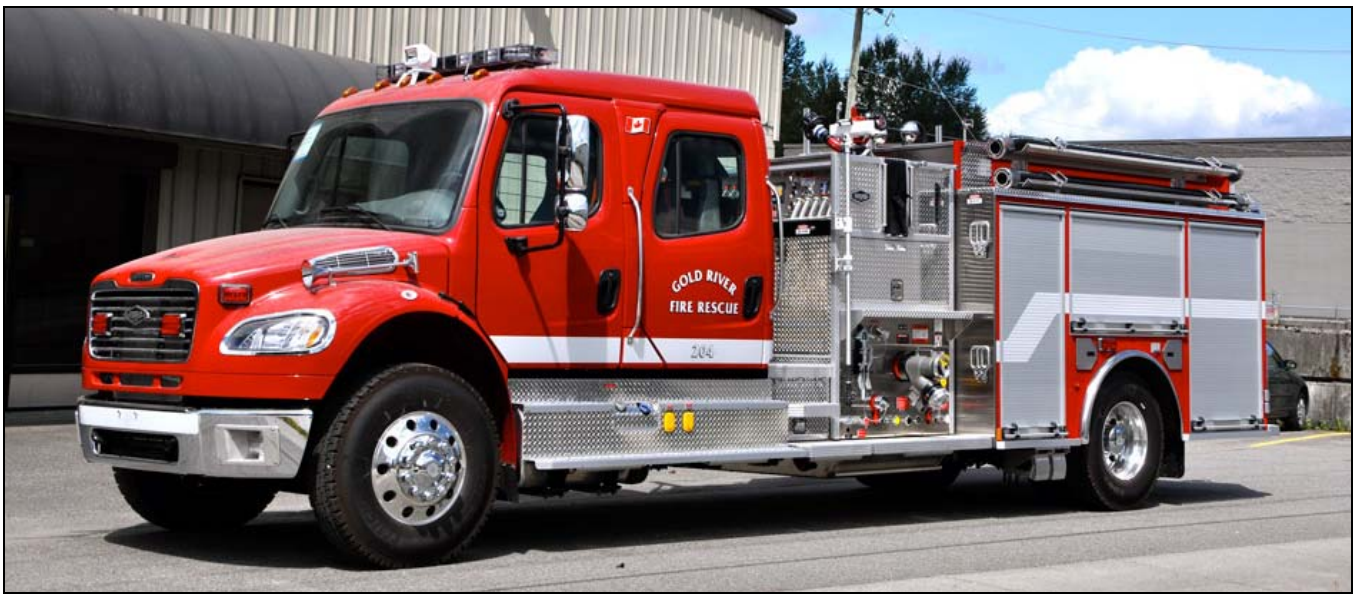
Gold River BC just got this 2014 Freightliner M2/Hub pumper, it has a 1050igpm pump and 1014gwt.