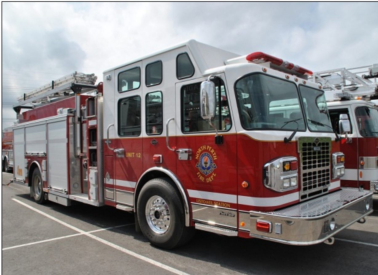
North Perth Unit 12 appeared at the OAFC show in 2012, it then went in service in Listowel. It is a 2012 Spartan Metro Star/Metalfab rig with a 1050igpm pump, 700gwt and a FoamPro 2002 foam system. More photos, next page.