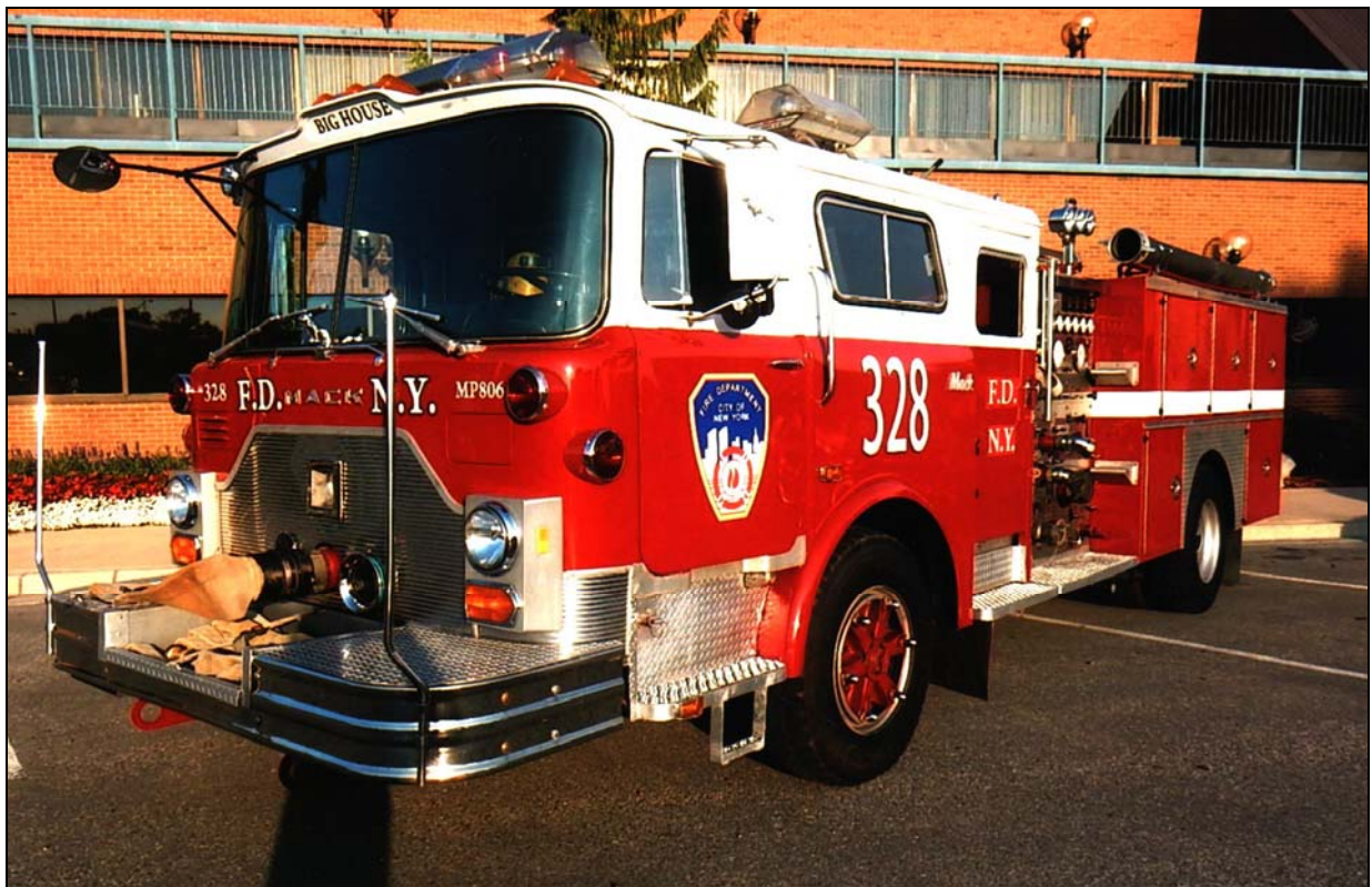
Another rig from Firefest owned by Brent DeNure, this 1988 Mack CF 1000 GPM Pumper, ex-FDNY Engine 328, saw service at Ground Zero.