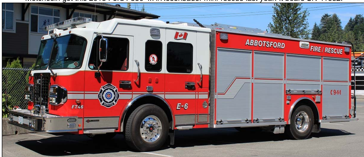
This 2014 Spartan Metro Star/Hub pumper went to Abbotsford last April. Engine 6 sports a 1500igpm Hale pump, and a 500gwt.