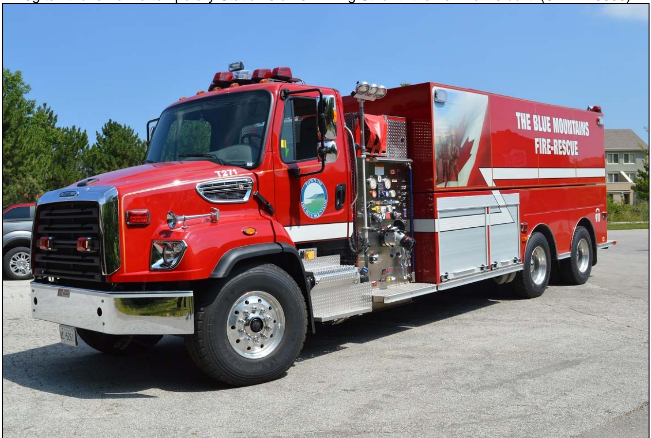
This is Blue Mountains Tanker 271, a 2012 Freightliner FL114SD/Fort Garry rig equipped with a 1050igpm pump and a 3000gwt. SN M392.