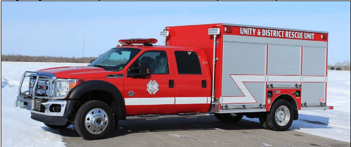
Unity, SK took delivery of this light rescue last winter. It's a 2013 Ford F550/Fort Garry rig, 12' box.