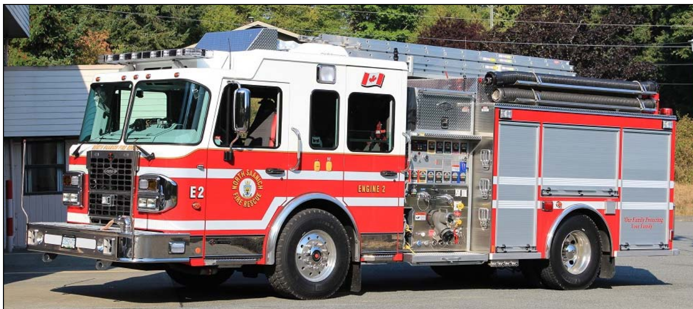
New stuff from B.C.: North Saanich Engine 2, a 2014 Spartan Metro Star/Hub with 1500igpm Hale pump, 600gwt and 20gft.