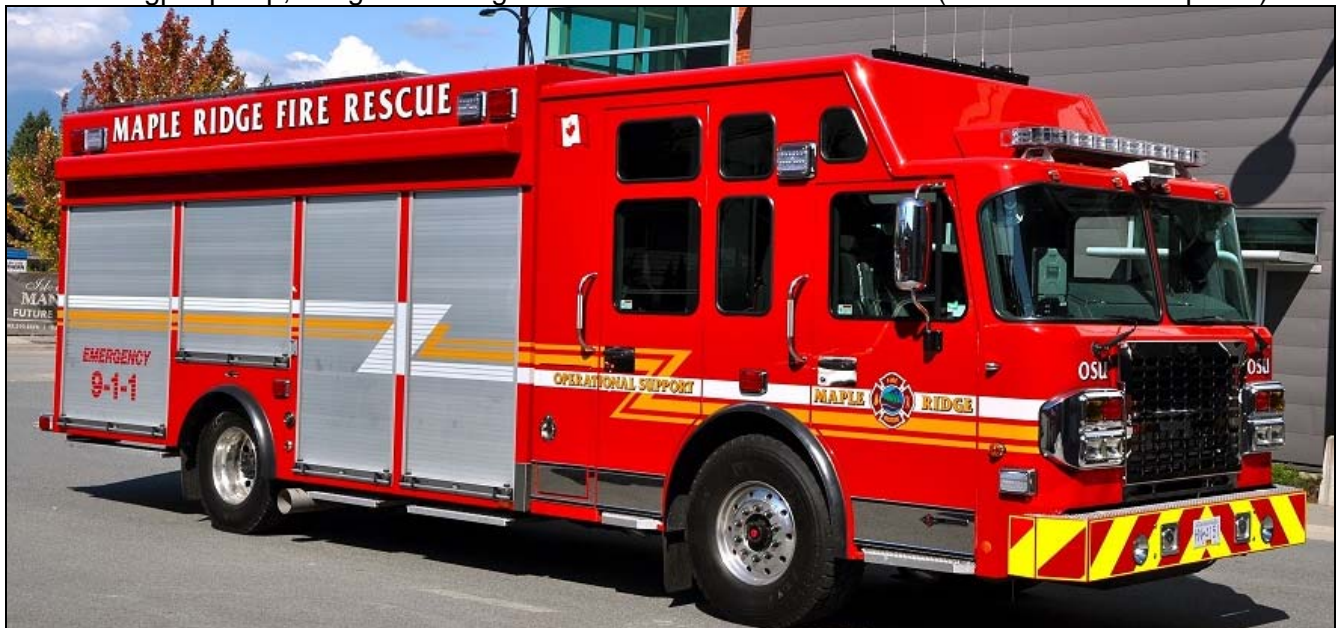
This is Maple Ridge, BC's Operational Support Unit, built by SVI on a Spartan Gladiator chassis. Equipped with a 20' box, it is essentially an airlift unit with a crew cab.