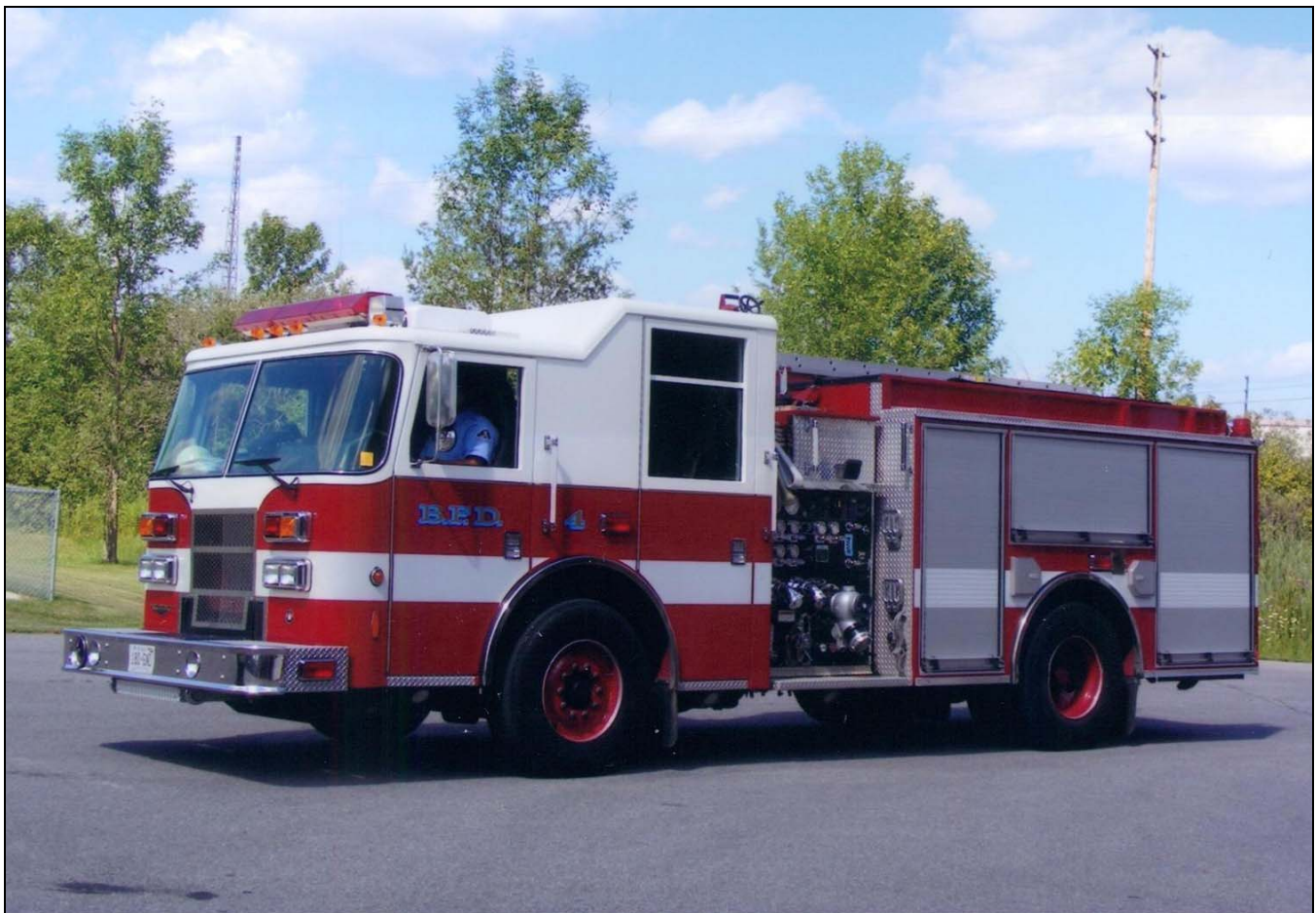
Brockville Pump 4 is a 2004 Pierce Contender pumper with a 1250gpm pump and 600gwt.