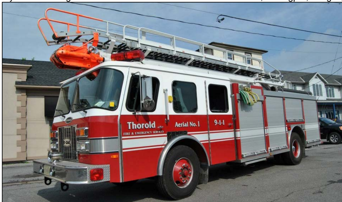
Thorold Aerial 1.a 1992 E-One Protector quint, 1050igpm pump, 400gwt and 65' Telesqurt.