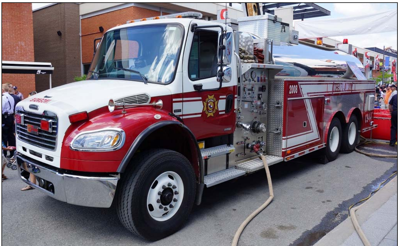
Laval, QC U.2008, a 2007 Freightliner M2/Carl Thibault tanker with a 420igpm pump and a 2500gwt.