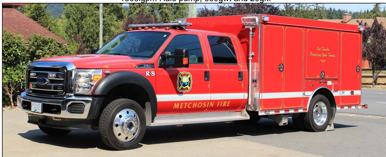
Metchosin got this 2013 Ford F550 4x4/Rosenbauer mini-rescue last year. It bears SN 41632.