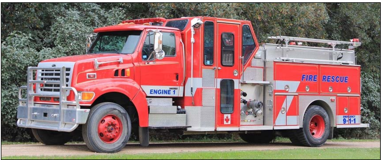
More Western deliveries: Strathclair, MB just received this 2001 Sterling L8500/Fort Garry 1050igpm/800gwt/25gft unit from Rocky Mountain Phoenix. It was formerly with the Thorsby, AB FD. SN M6713