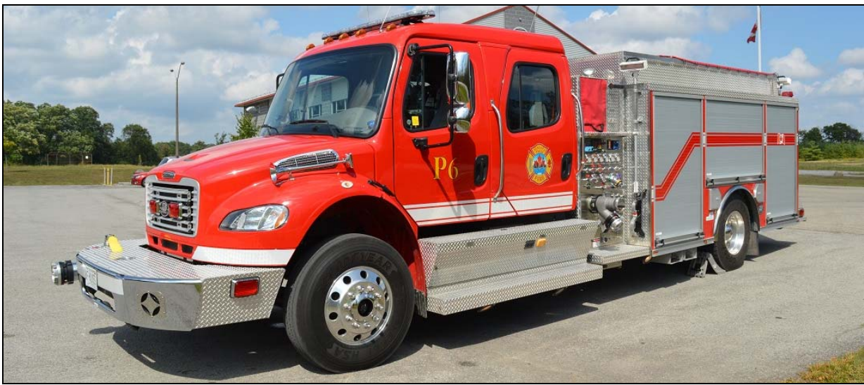
Niagara Falls P.6 2013 Freightliner M2/Spartan ERVDEV 1500gpm/1000gwt (SN 211093-1) and Hamilton's new Ladder 10, a 2014 KME Predator quint with 2000igpm/500gwt/25gft/103'