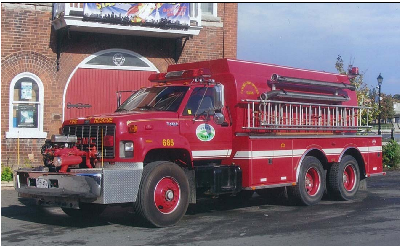
Another pair from the Neil McCarten collection: Trent Hills Unit 685, a 1995 GMC Top Kick/ Almonte 2500 gallon tanker with a 400igpm front-mount pump. It's stationed in Campbellford.