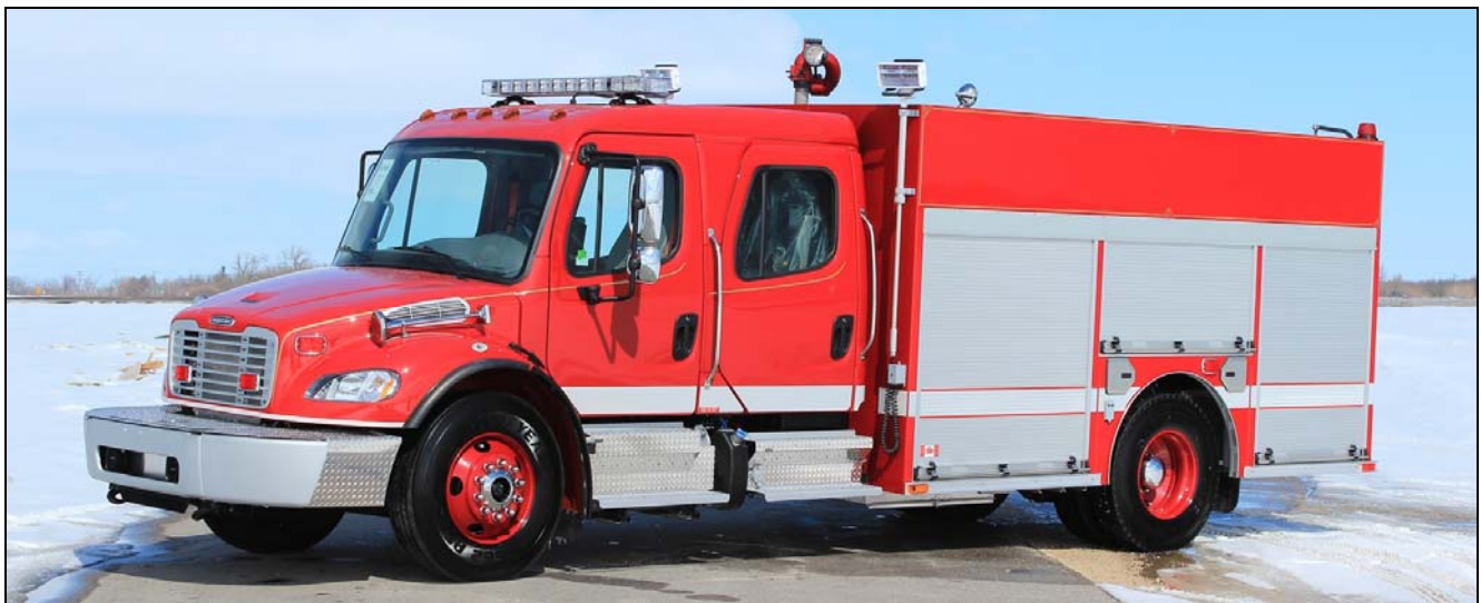
Magrath, AB got this 2014 Freightliner M2-106/Fort Garry pumper during the winter. It came with a 1050igpm pump, 800gwt and 25gft. It also has a CAFS, s/n M509.